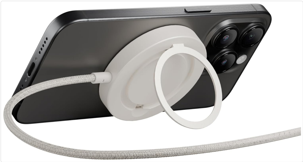
The Native Union SnapStand Magnetic Wireless Charger securely attached to the back of a smartphone, demonstrating its integrated kickstand for hands-free viewing.