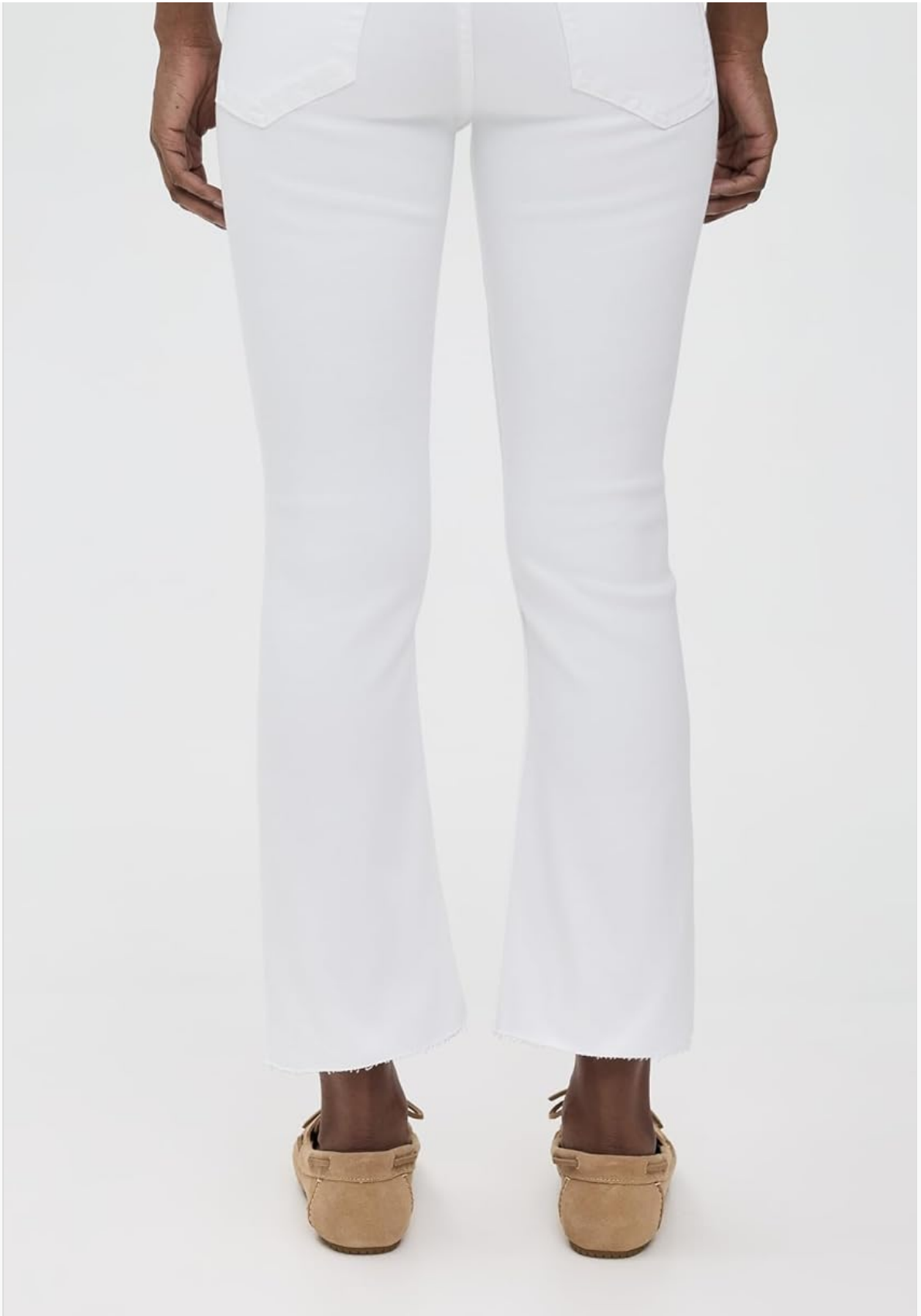
Image: Back view of the jeans, illustrating the pocket placement and leg shape.