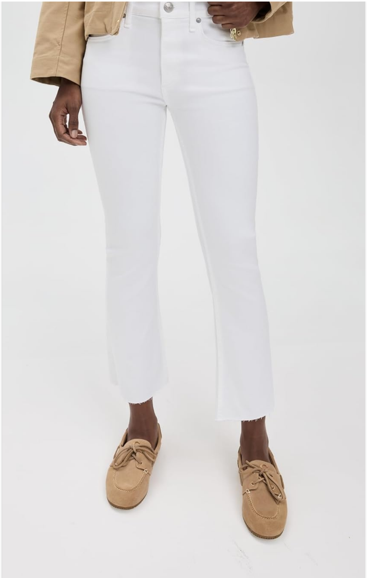
Image: Model wearing the jeans, demonstrating the overall fit and style.