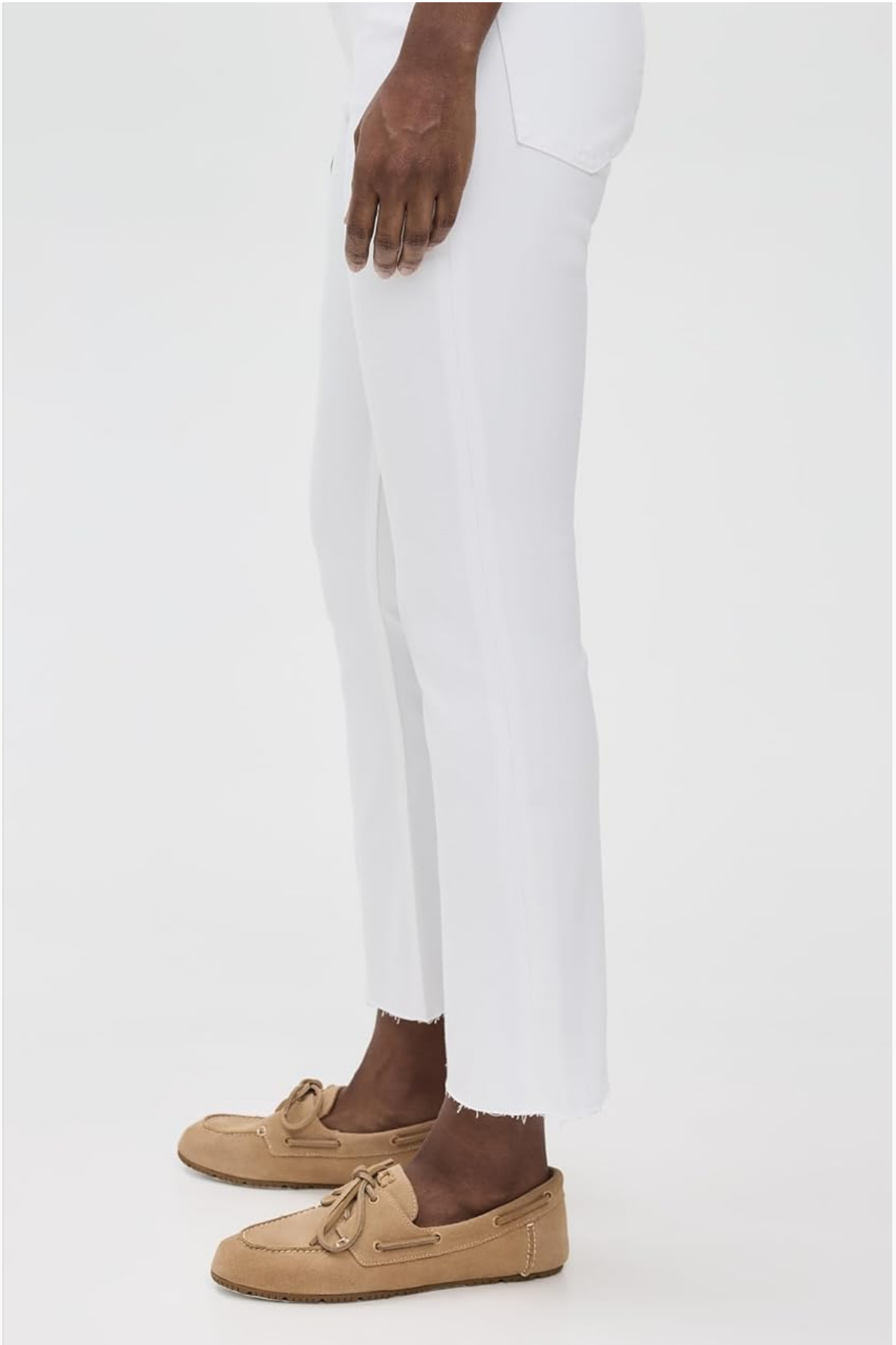
Image: Side view of the jeans, showing the ankle length and bootcut flare.