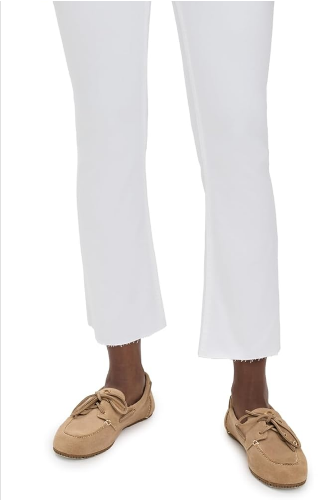
Image: Front view of the jeans, showcasing the mid-rise and bootcut silhouette.