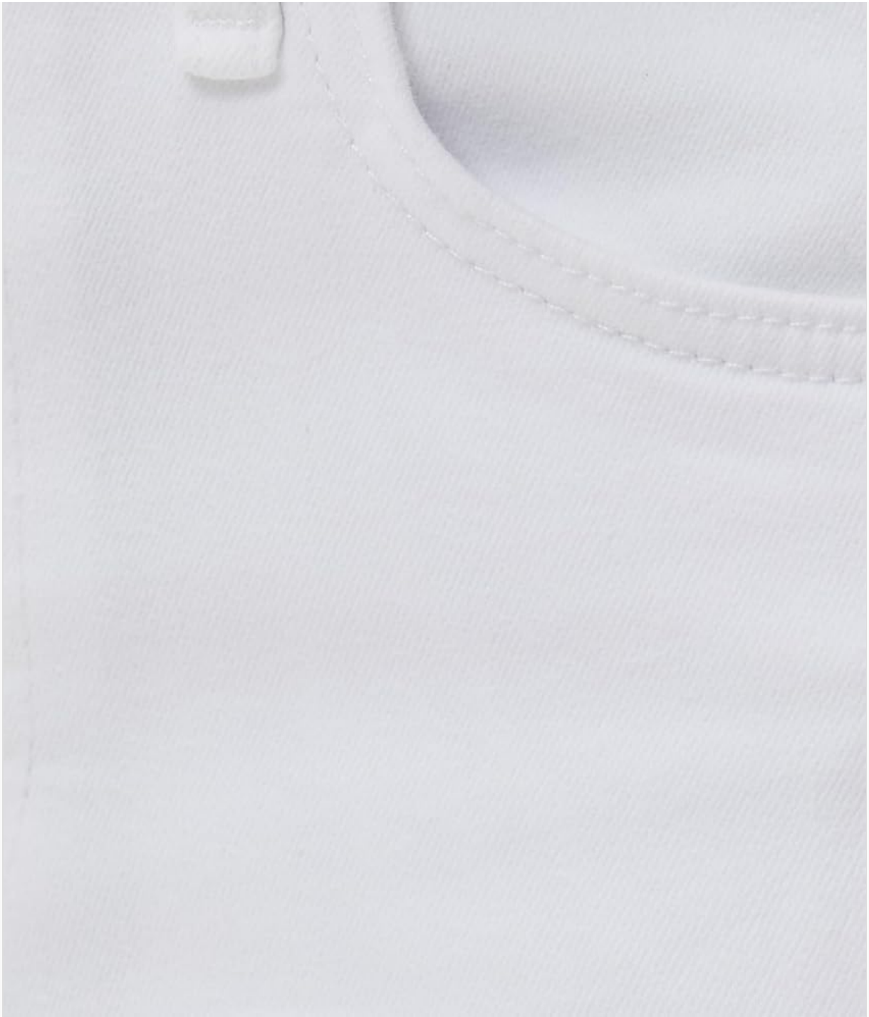
Image: Detail of the button closure and front pocket, highlighting the classic 5-pocket design.