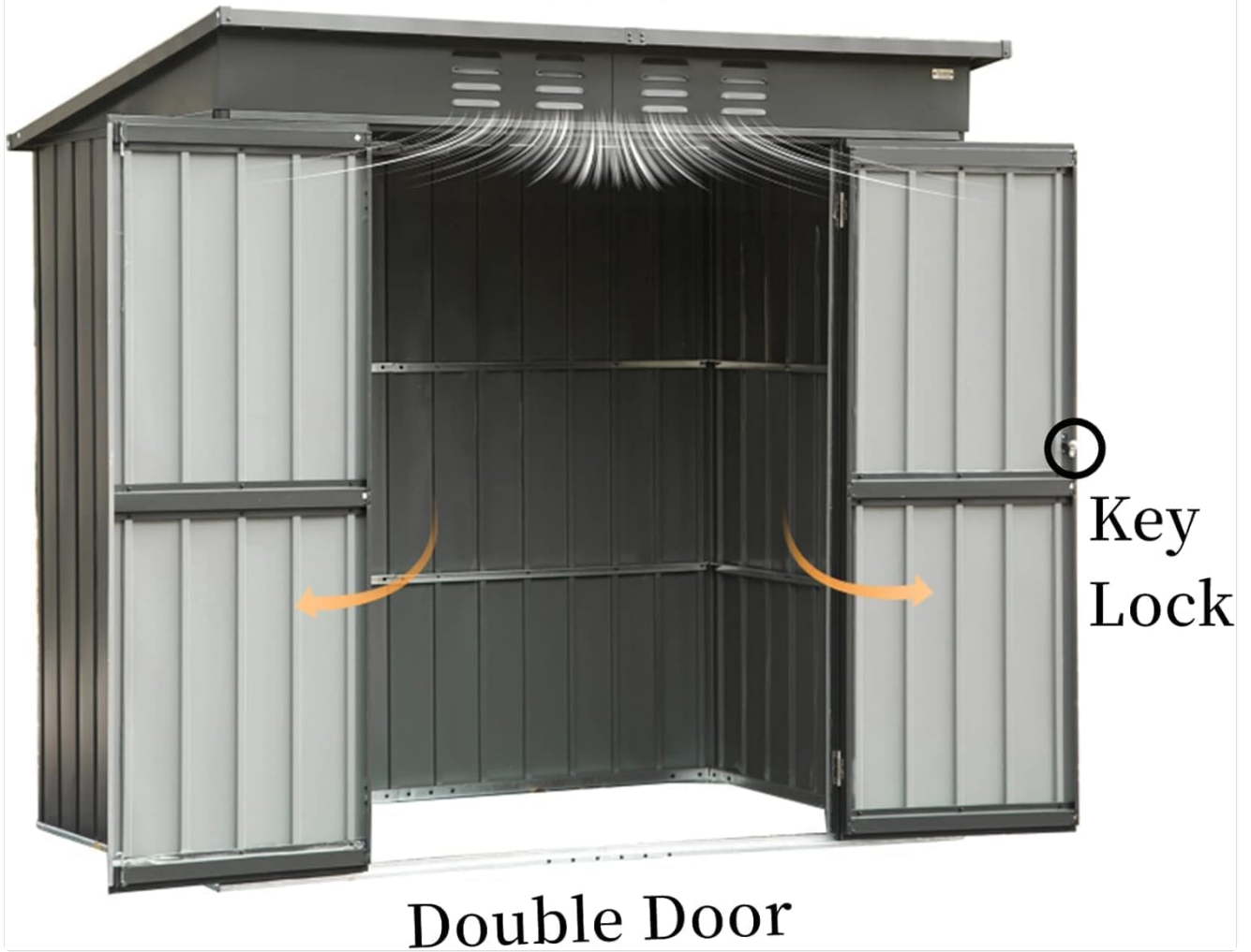
Image: The shed features double doors for easy access, a key lock for security, and vents for air circulation.