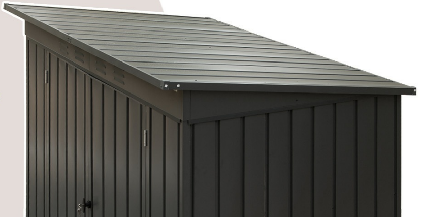
Image: Detail of the galvanized steel roof material, designed for weather protection.