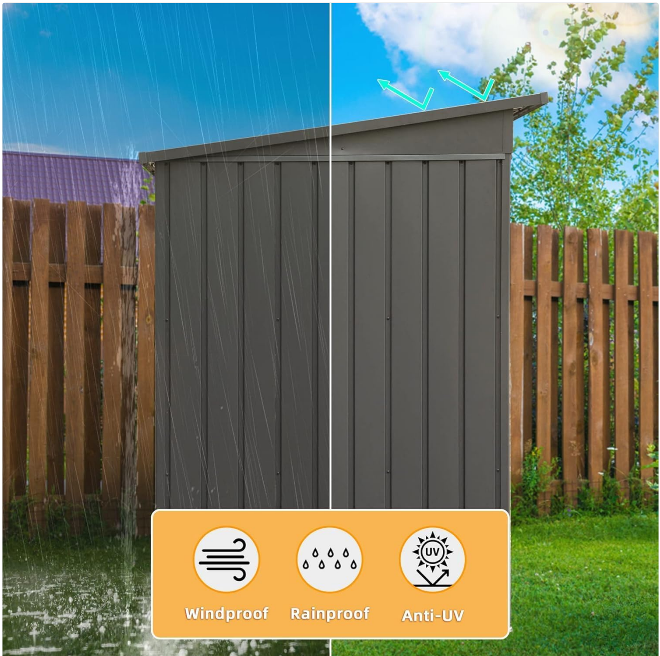
Image: The shed is designed to be windproof, rainproof, and anti-UV, contributing to its low maintenance requirements.