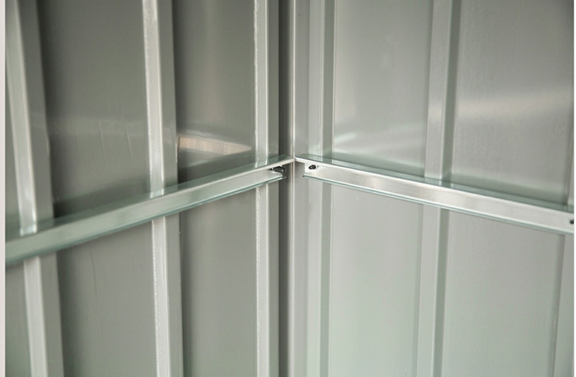
Image: The frame design includes stable right-angle fixed points for enhanced structural integrity.