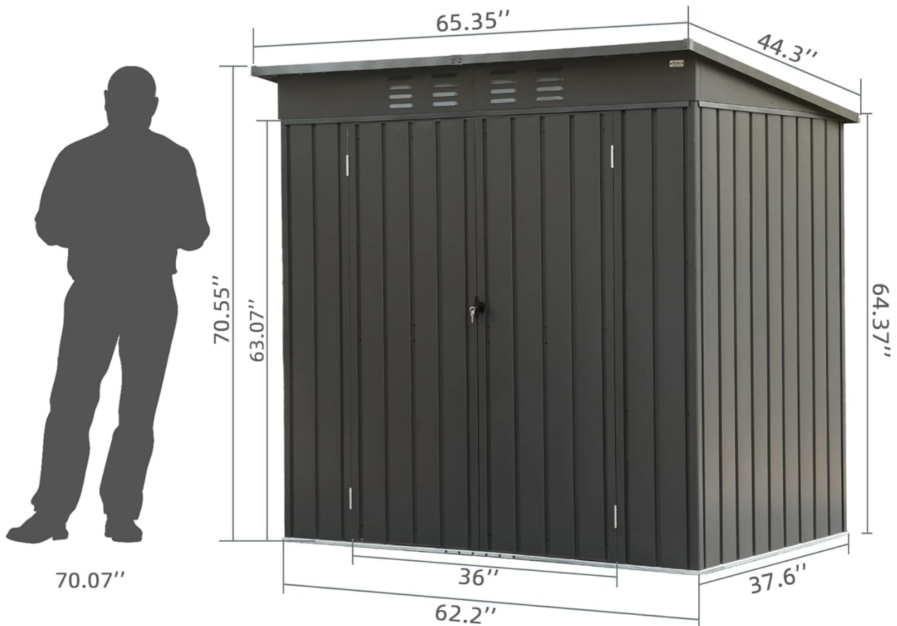
Image: Detailed product dimensions including height, width, and depth.