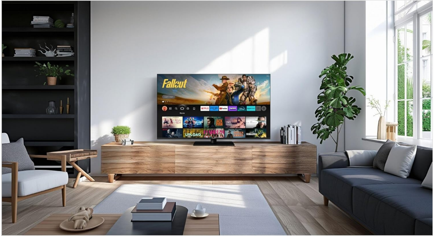
Image 3: The Panasonic TV-43W80AEZ positioned on a media console in a modern living room, demonstrating typical installation.