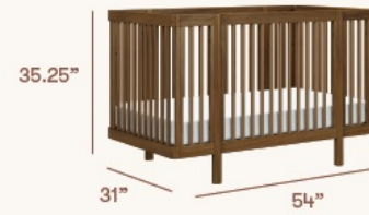
Image: This image provides detailed dimensions and illustrates the two adjustable mattress height options available for each stage of the Pogo crib: bassinet, midi, and full-size.