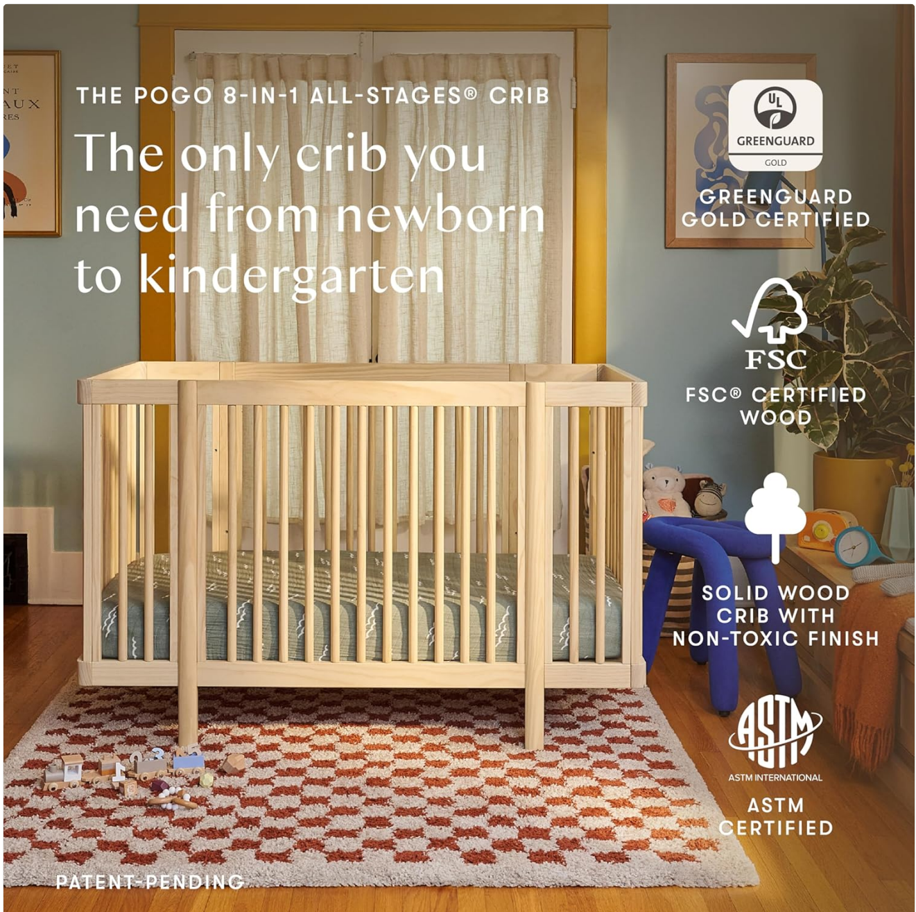
Image: A front view of the Babyletto Pogo Convertible Crib in its standard crib configuration, showcasing its design and blonde finish.