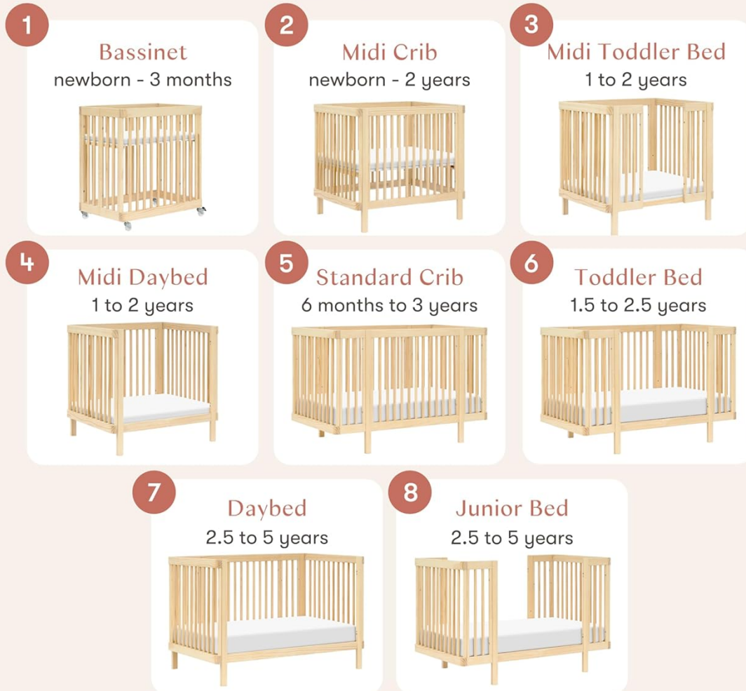
Image: This image highlights the removable locking caster wheels on the Pogo bassinet, allowing for easy movement between rooms.

for newborns, infants, toddlers, and every stage in between