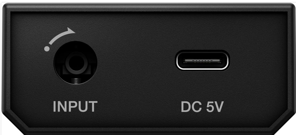
Figure 2: Rear View of HP-TX01 Transmitter. This image shows the rear panel of the transmitter, featuring the 3.5mm audio INPUT jack and the DC 5V USB-C charging port.