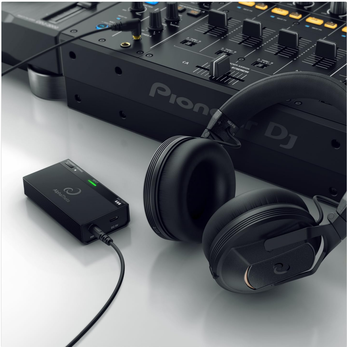
Figure 3: Transmitter Connected to DJ Mixer. This image illustrates the HP-TX01 transmitter connected to a DJ mixer, with a pair of professional DJ headphones positioned next to it, demonstrating a typical setup.