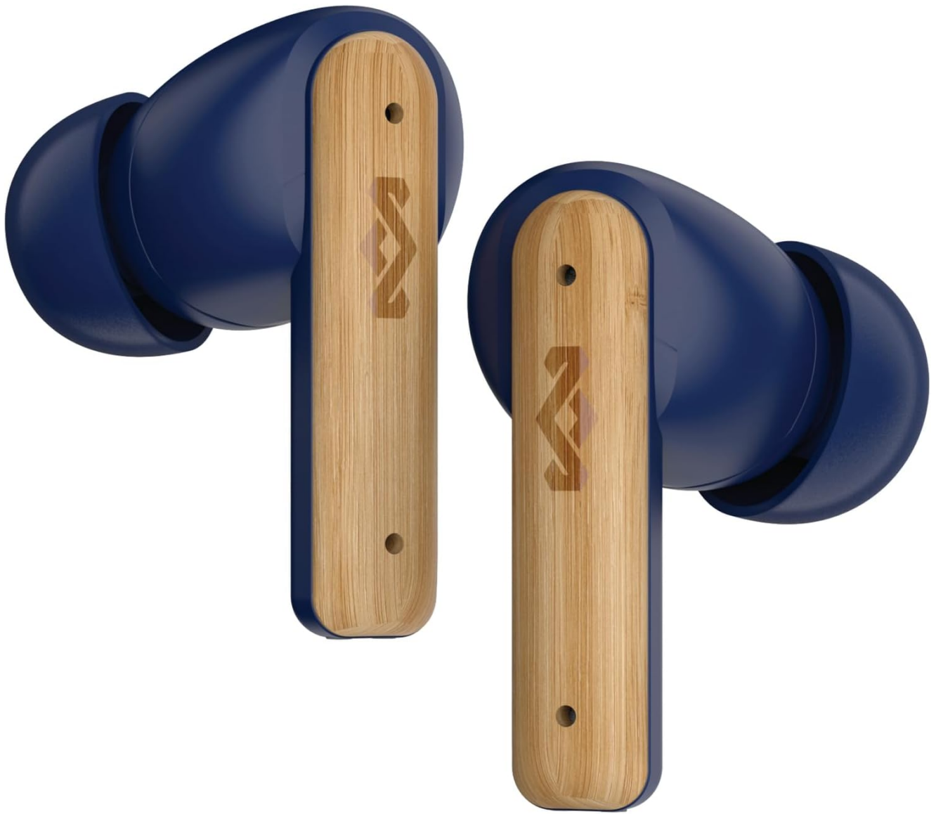
Image: The Little Bird True Wireless Earbuds in blue, showcasing their compact design and bamboo-finished stems.