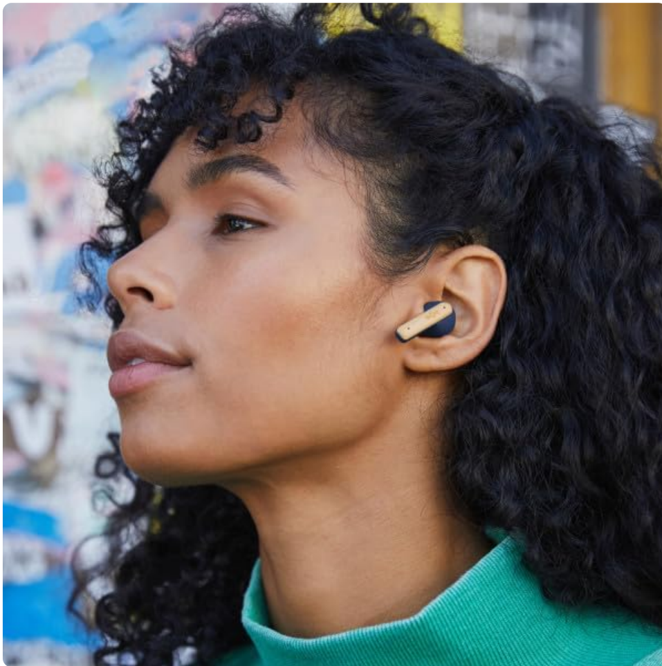
Image: A person wearing a Little Bird earbud, demonstrating its in-ear fit.