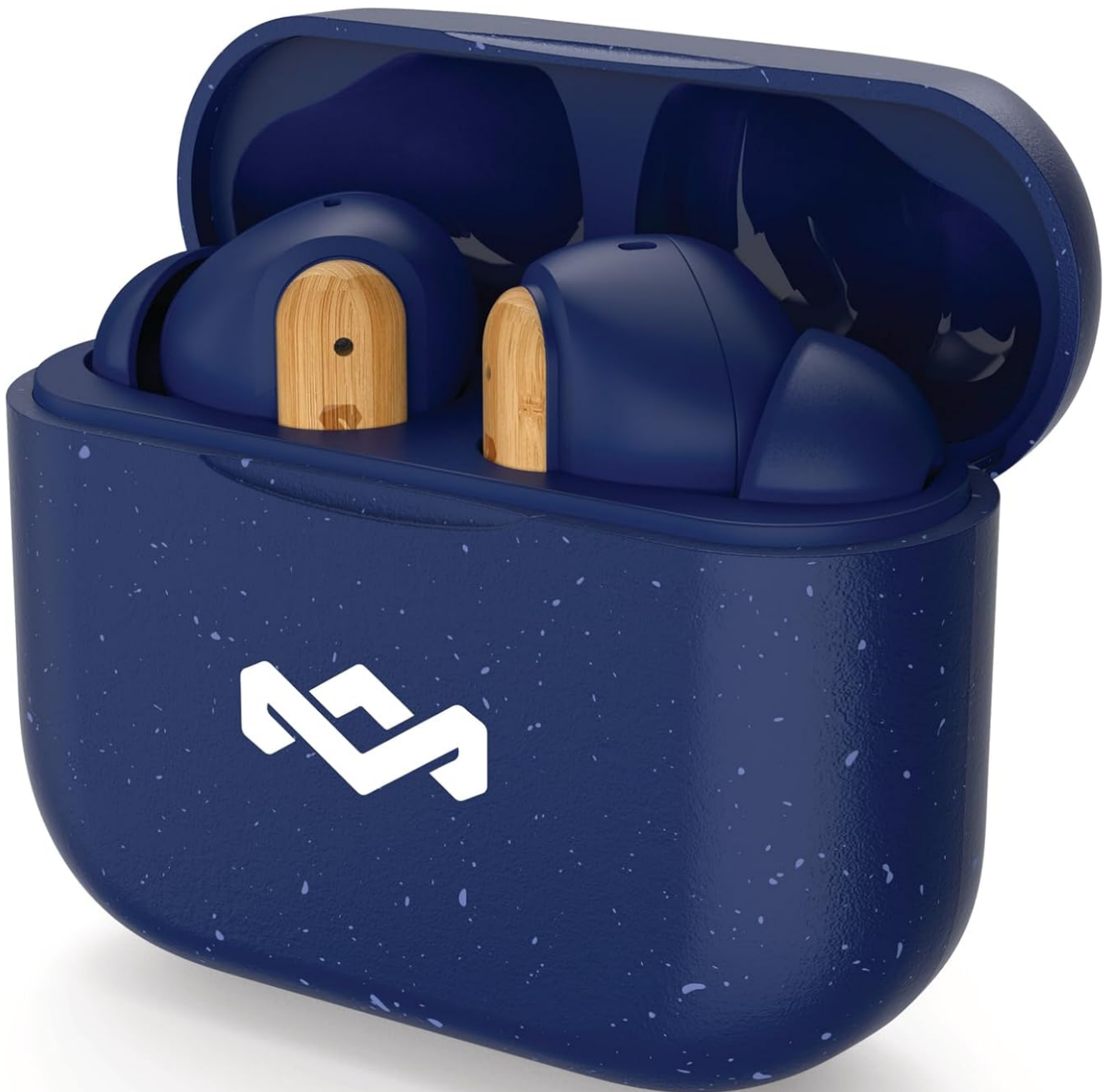
Image: The Little Bird Earbuds nestled within their blue charging case, ready for storage or charging.