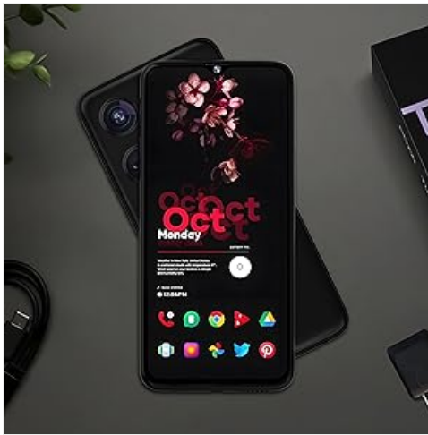
Image: POZZI Turbo smartphone with its power adapter, USB-C cable, and protective case.