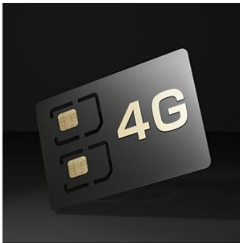
Image: Illustration of dual Nano SIM card slots and 4G network compatibility.