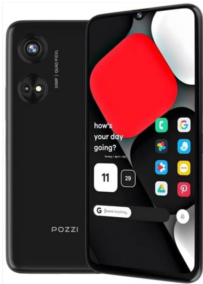
Image: Rear view of the POZZI Turbo smartphone highlighting the 50MP camera system.