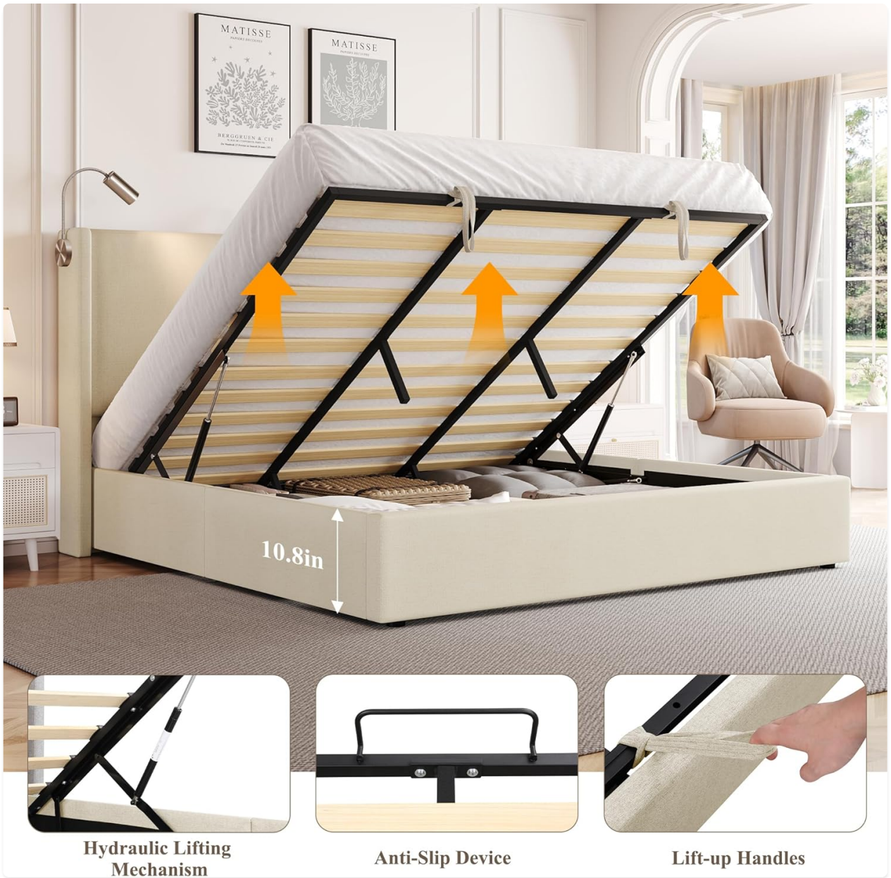
Hydraulic Lifting Mechanism