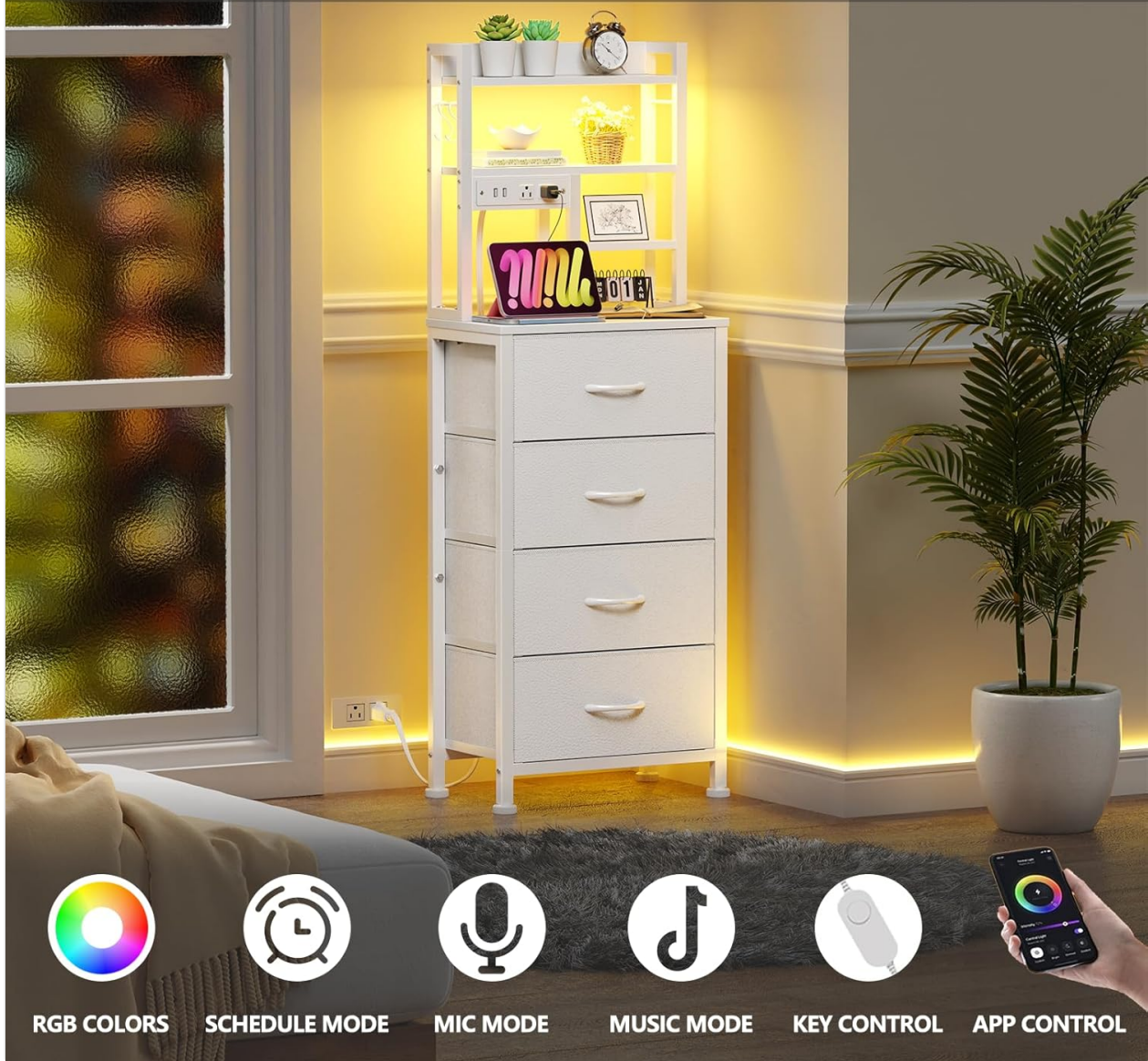
Image 4.1: The LED lighting system showcasing various color options and control methods.