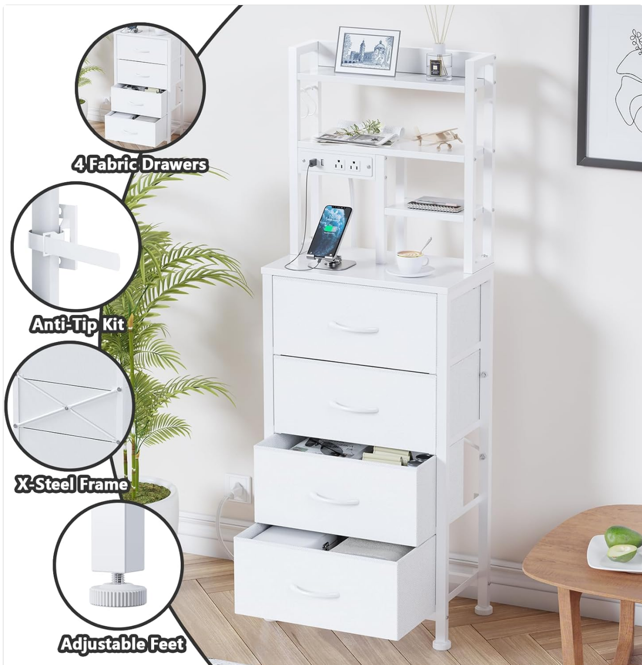
Image 3.2: Key structural features including the anti-tip kit, X-steel frame, and adjustable feet.