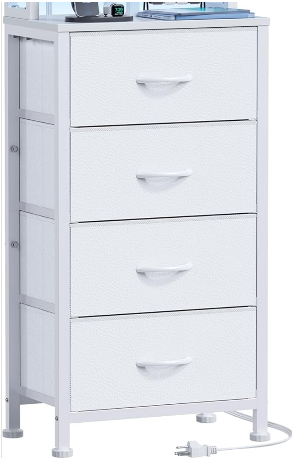
Image 1.1: The Furnulem Tall LED Nightstand in a bedroom environment.