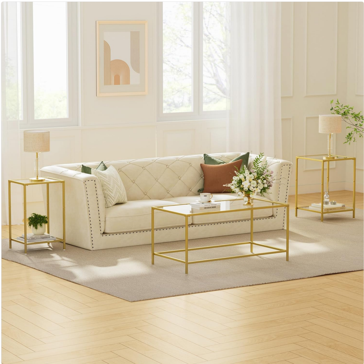
Image: The coffee table serving as a central piece in a living room, demonstrating its functional placement.