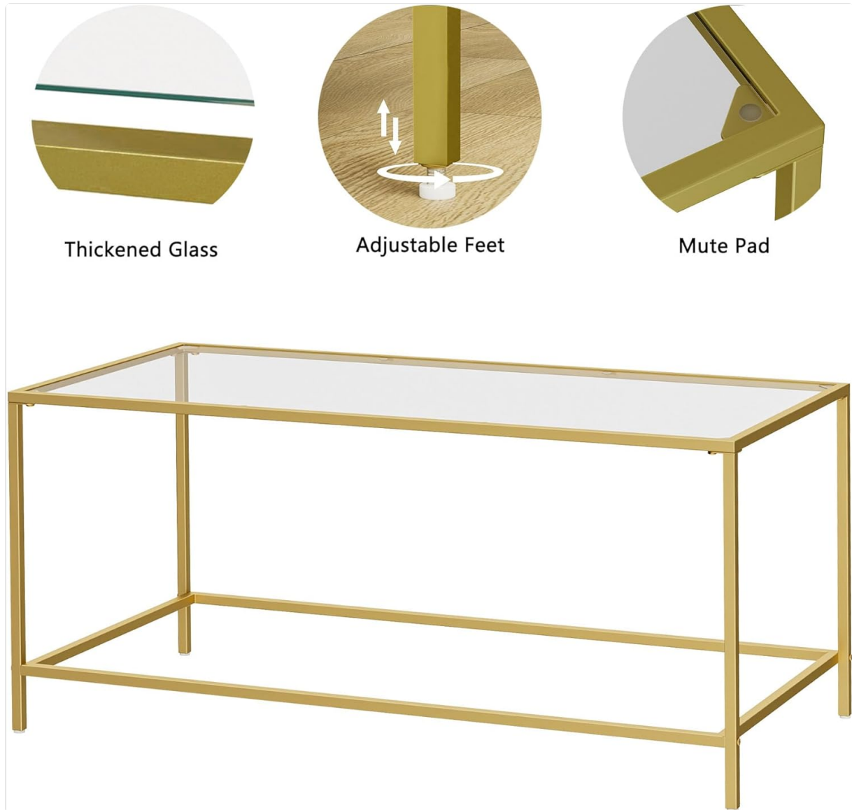
Image: Detailed views highlighting the thickened glass, adjustable feet for leveling, and mute pads for stability and protection.