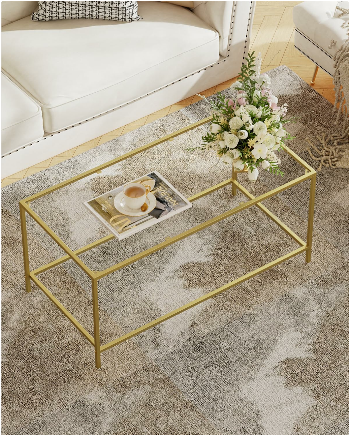
Image: A complete view of the Homleke CT10G Glass Coffee Table, highlighting its golden frame and clear glass top.