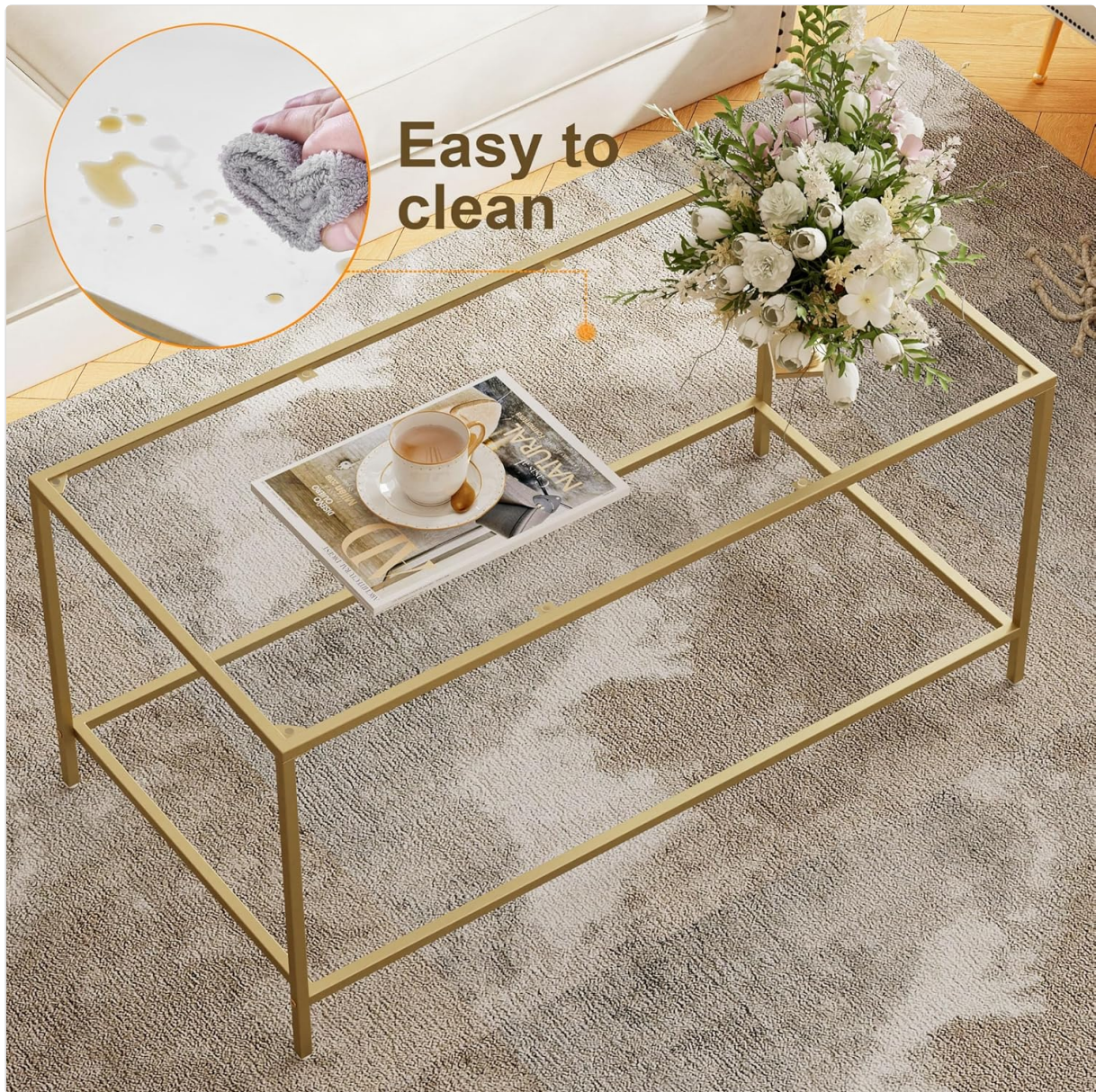
Image: A hand wiping a spill on the glass tabletop, illustrating the ease of cleaning the surface.