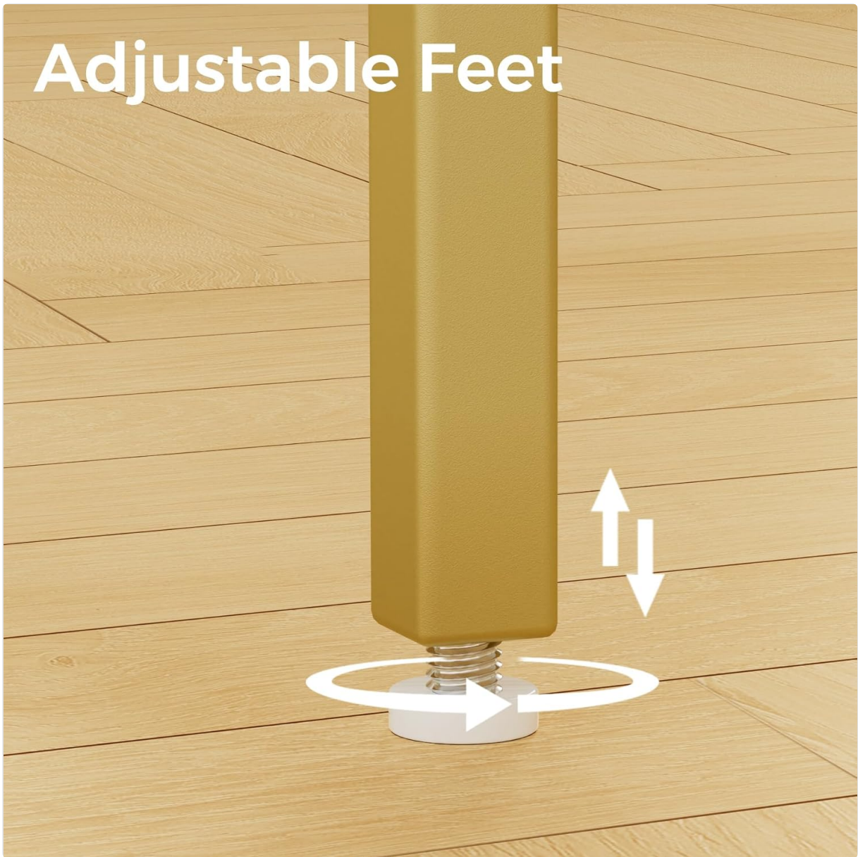
Image: A close-up of the adjustable foot mechanism, allowing for easy leveling of the table.