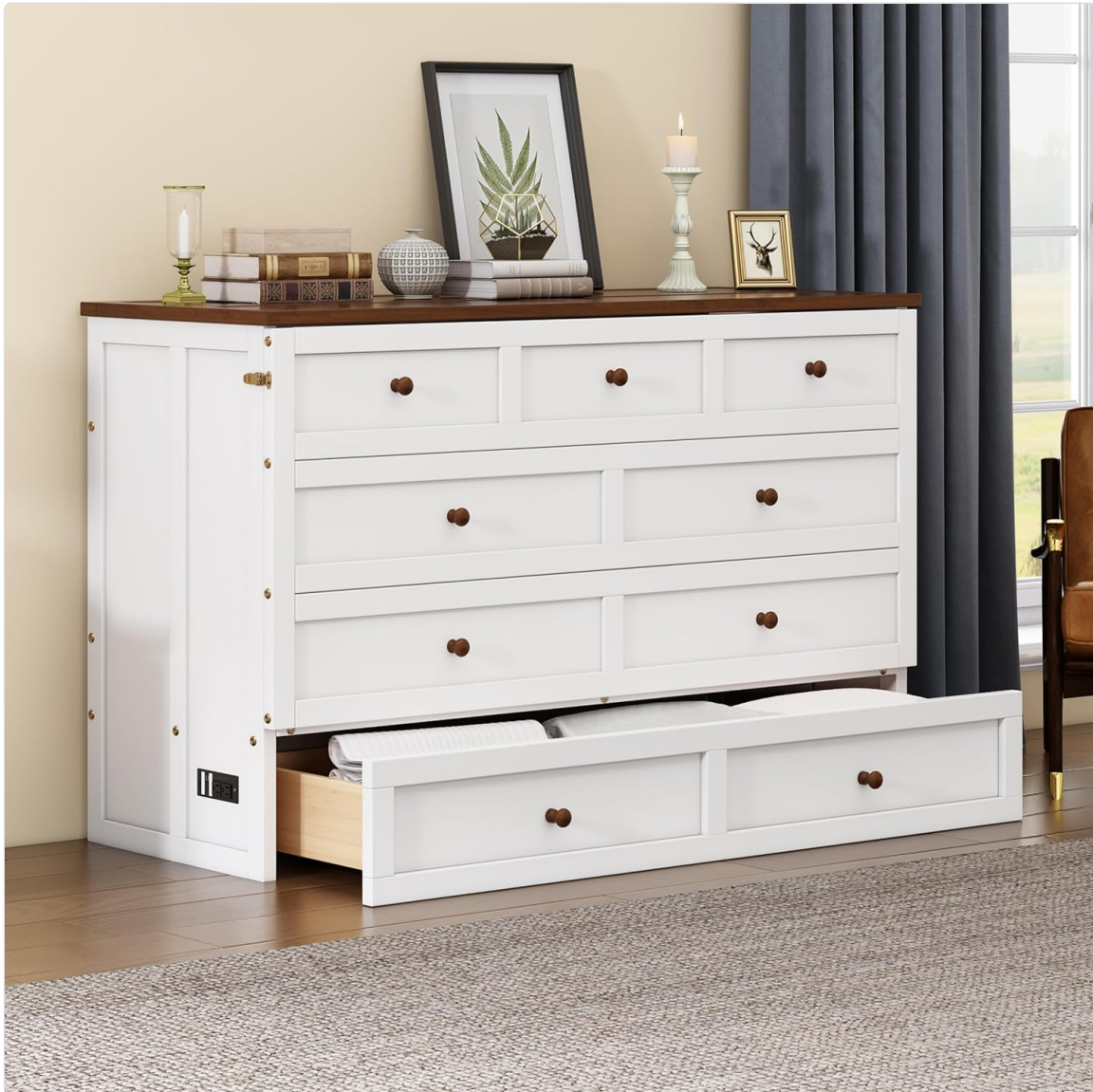
Image: The Murphy Cabinet Bed in its compact cabinet form, showcasing one of the integrated storage drawers pulled open.

The integrated storage drawers provide convenient space for storing bed linens, pillows, or other items. Simply pull the drawer handles to open and push to close. Ensure drawers are fully closed before converting the bed.