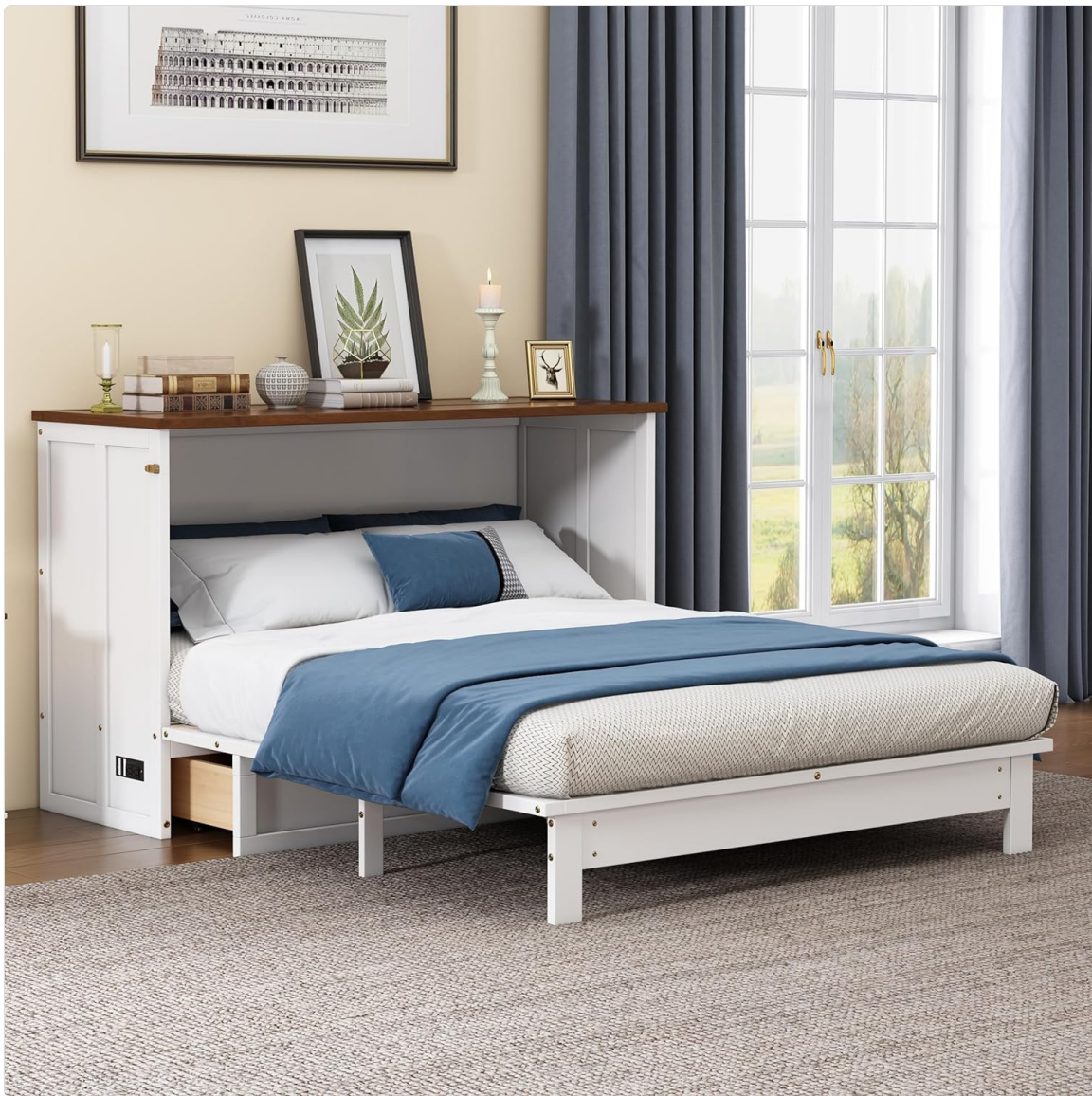
Image: The Merax Murphy Cabinet Bed shown in its fully extended bed configuration, ready for use.