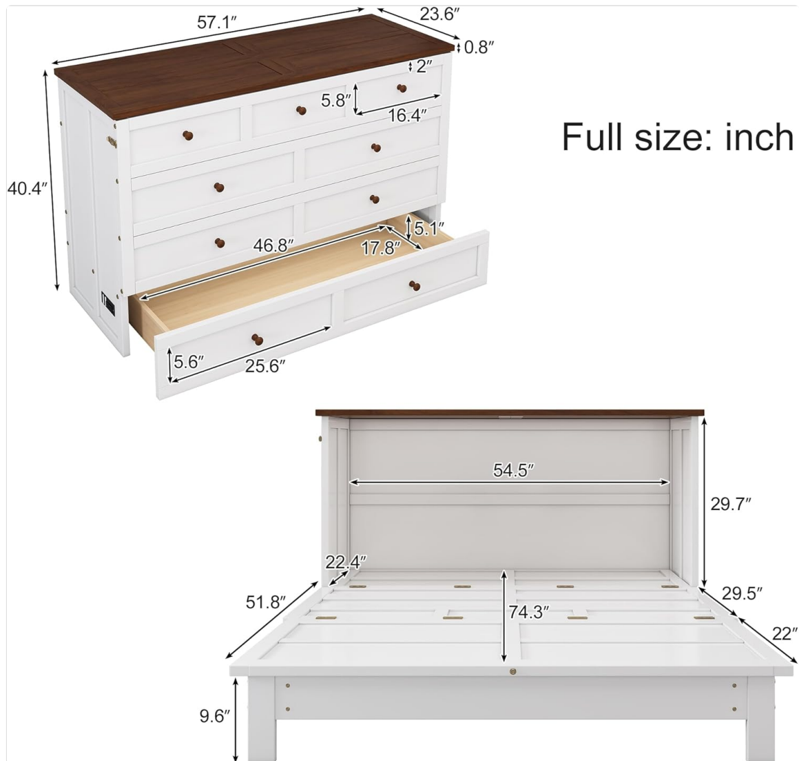
Image: Detailed dimensional diagram of the Murphy Cabinet Bed, illustrating measurements for both the cabinet and the extended bed frame.