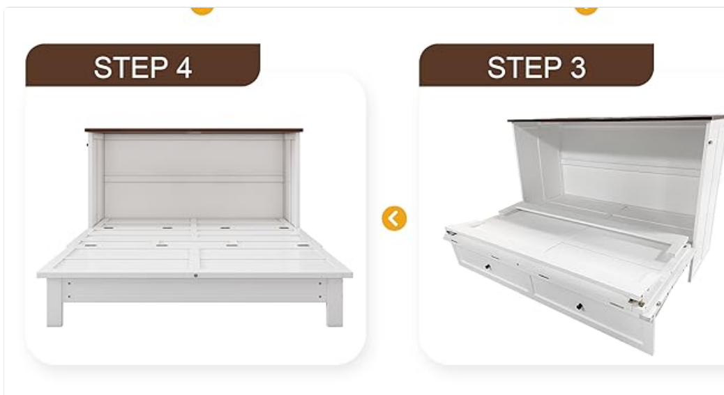
Image: Visual guide for assembly, showing the later steps of installing the bed frame and drawers (Steps 3 and 4).