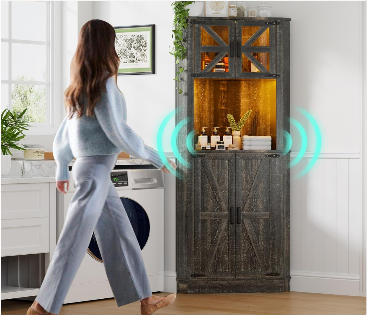
Figure 4: Human Sensor Lights in Operation. This image demonstrates the automatic activation of the LED lights when motion is detected, highlighting the convenience of the auto-sensing feature.

When the human body sensor is turned on, the light will automatically light up when the person is about 1-2 meters