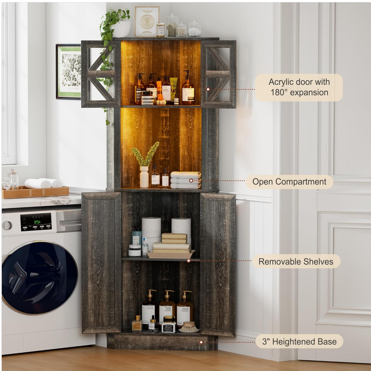
Figure 6: Removable Shelves. This image highlights the adjustable nature of the interior shelves, showing how they can be reconfigured to suit different storage needs.