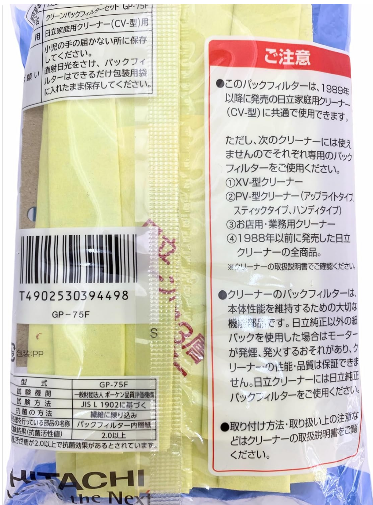
Image 2: Back of the GP-75F filter package, detailing compatibility and important cautions regarding filter usage.