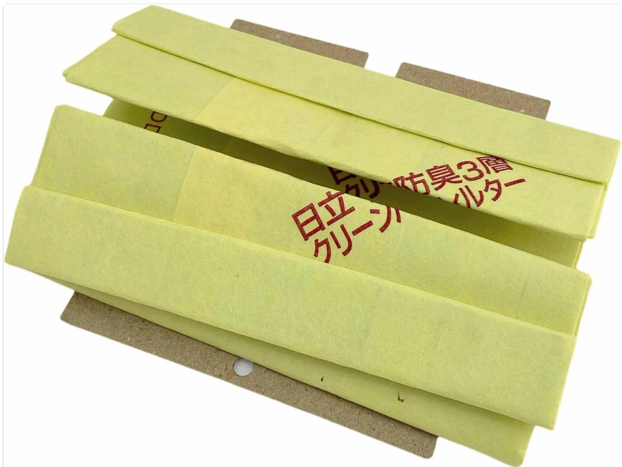
Image 4: Multiple Hitachi GP-75F pack filters, folded and ready for storage or use.