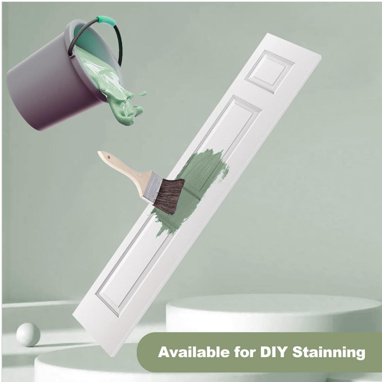
Image 5.3: Door panels are primed and ready for painting or staining.