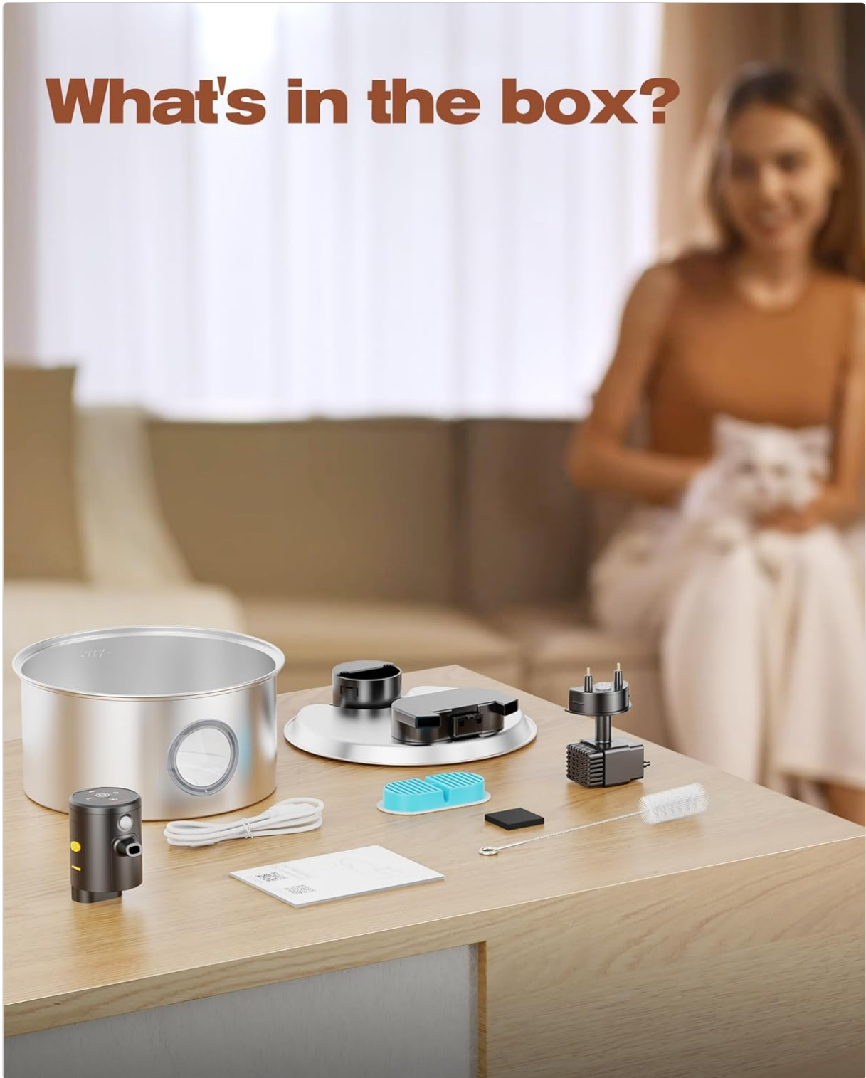
Image: All components of the TOONIOOS Cat Water Fountain laid out, including the stainless steel basin, pump module, filters, and cleaning tools.