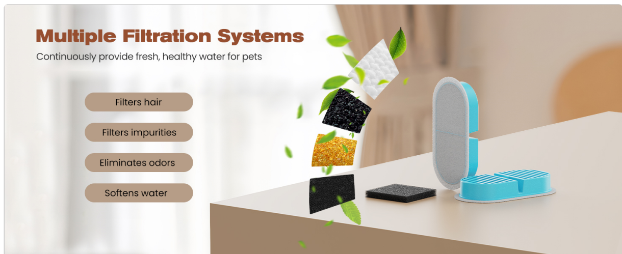
Image: An exploded view of the multi-layer filtration system, highlighting the different filter components.