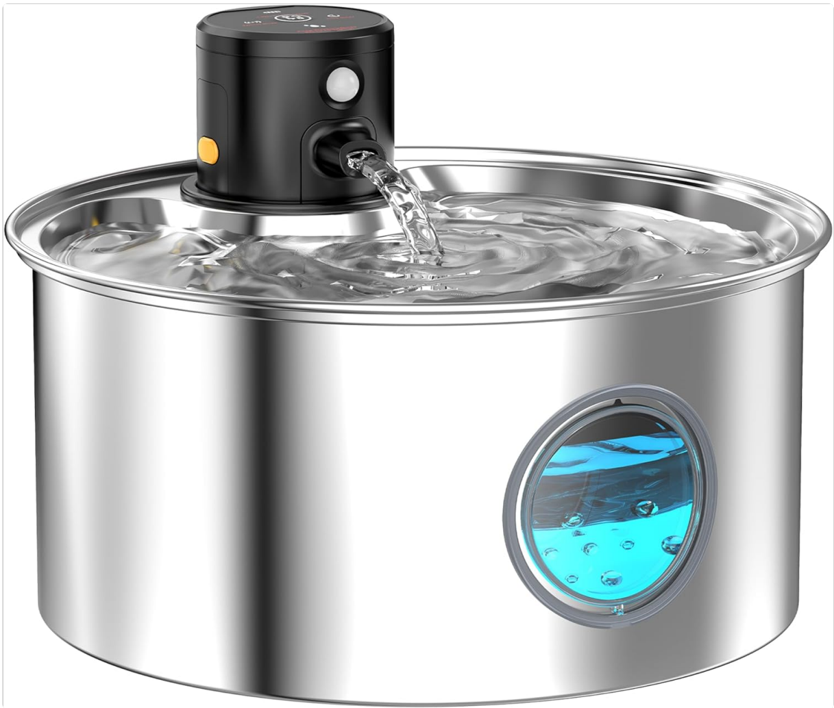
Image: The TOONIOOS Wireless Cordless Cat Water Fountain, Model W2, assembled and ready for use.