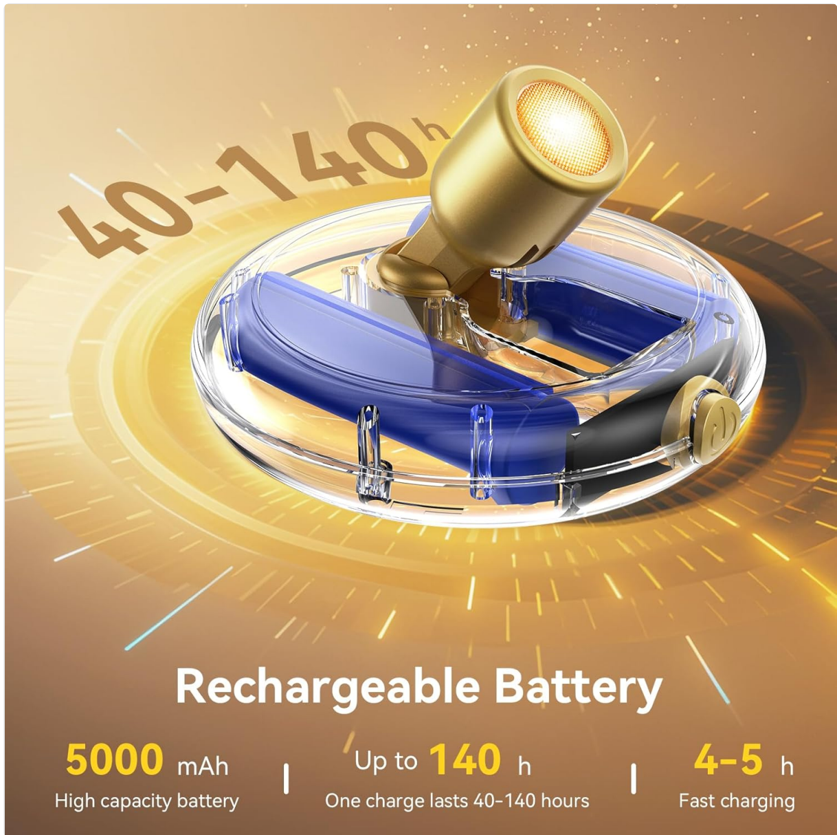
Image: An exploded view of the spotlight highlighting the 5000mAh rechargeable battery, indicating 40-140 hours of use per charge and 4-5 hours for fast charging.