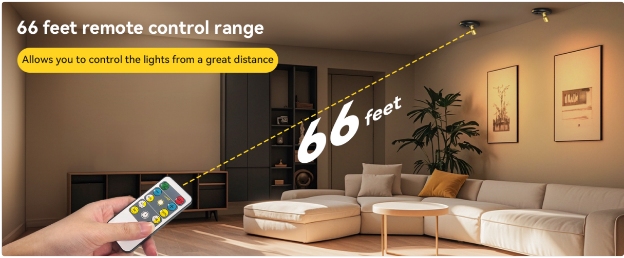
Image: A visual representation of the spotlight's 66-foot remote control range, showing a hand operating the remote from a distance in a living room.

Allows you to control the lights from a great distance