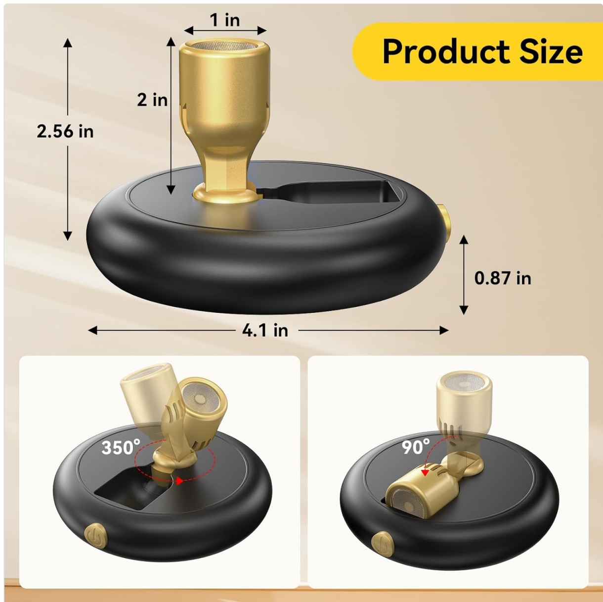
Image: Illustrations demonstrating the spotlight's adjustable head, capable of 350° rotation and 90° vertical swivel.