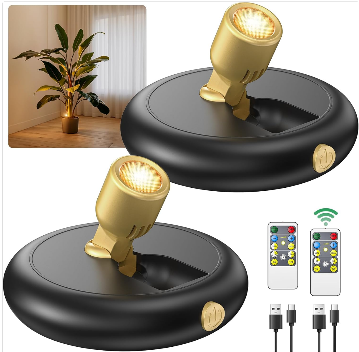
Image: Two Ler0ktr rechargeable LED spotlights, showing the main units, remote controls, and charging cables. One spotlight is shown illuminating a plant in a room.