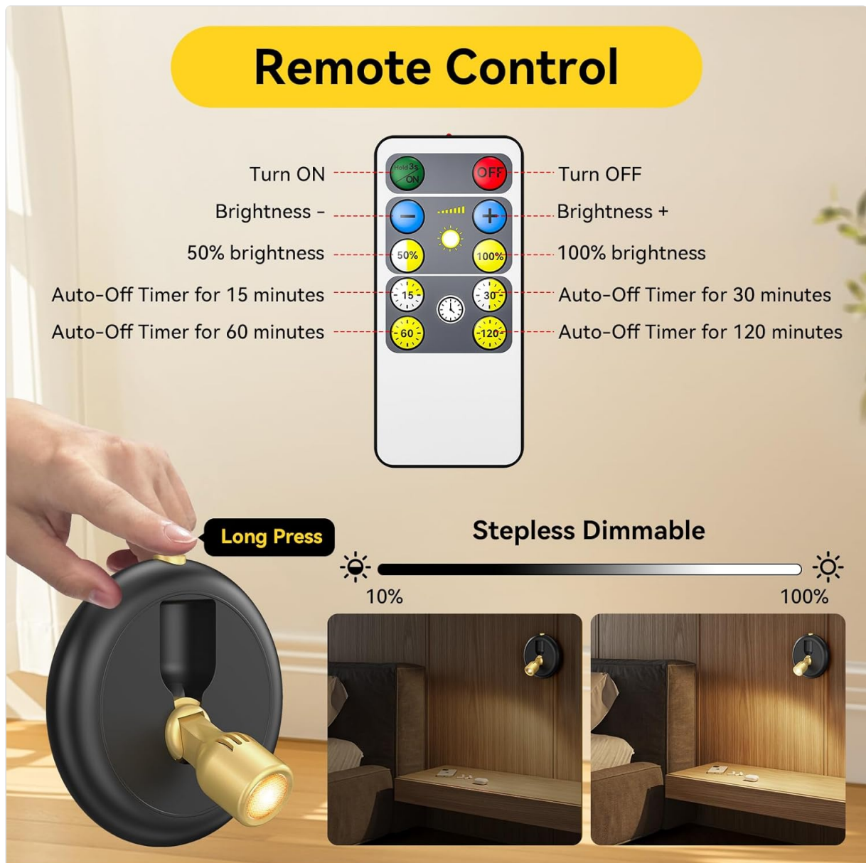
Image: A detailed diagram of the remote control, labeling buttons for ON/OFF, brightness adjustment (+/- and 50%/100%), and auto-off timer settings (15, 30, 60, 120 minutes). Below, an illustration shows stepless dimming from 10% to 100% brightness.