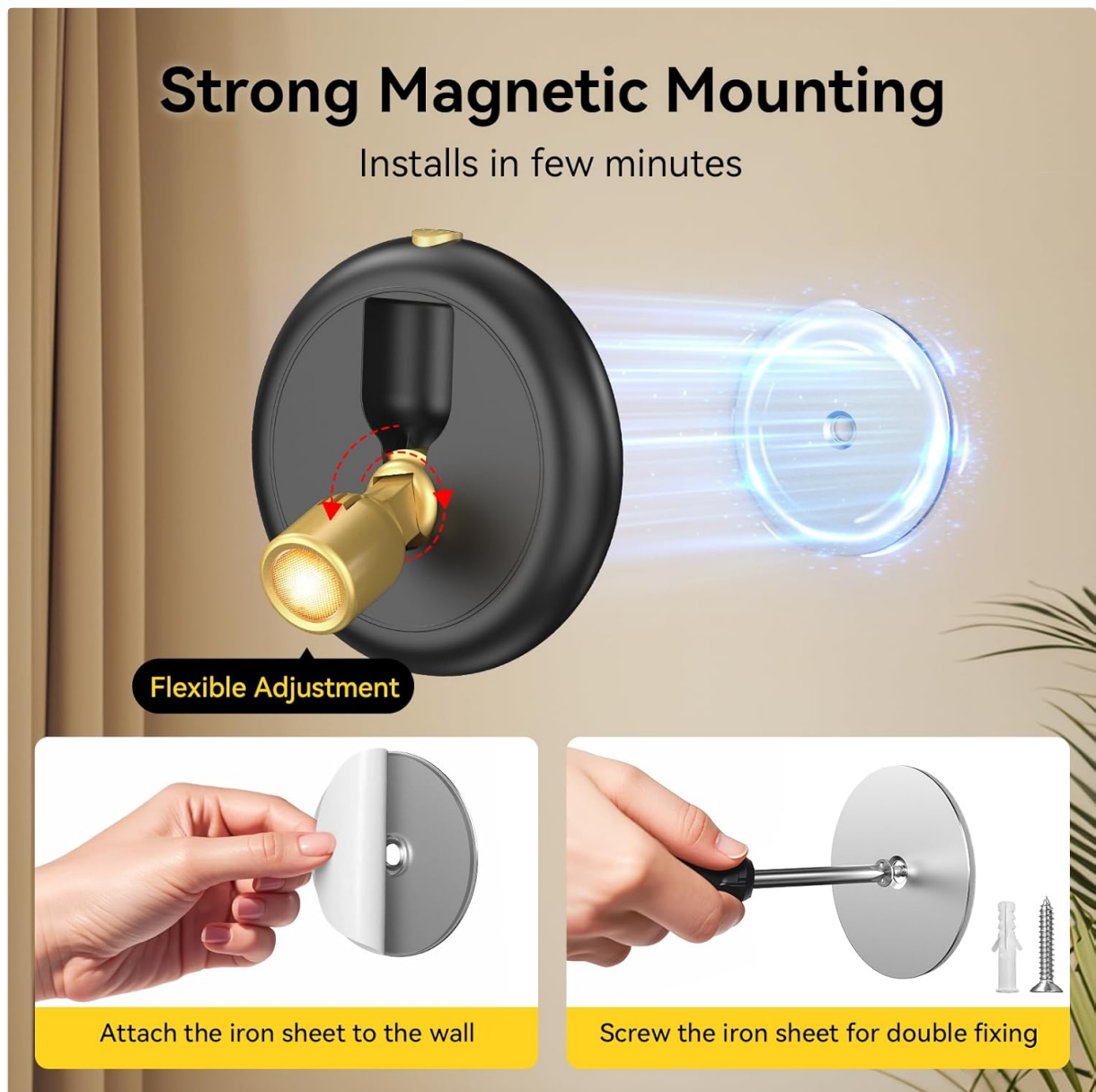
Image: Illustration demonstrating how to attach the iron sheet to a wall using adhesive and how to further secure it with a screw for double fixing.