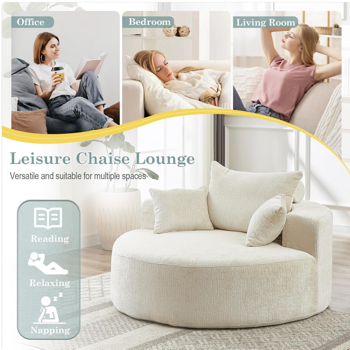
Figure 6: Showcases the chair's suitability for various leisure activities in different rooms.