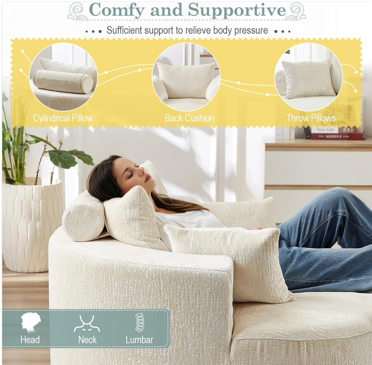
Figure 3: Illustrates the comfortable and supportive pillows included with the chair.