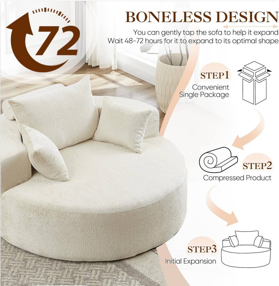
Figure 5: Demonstrates the premium chenille fabric and comfortable lounging experience.