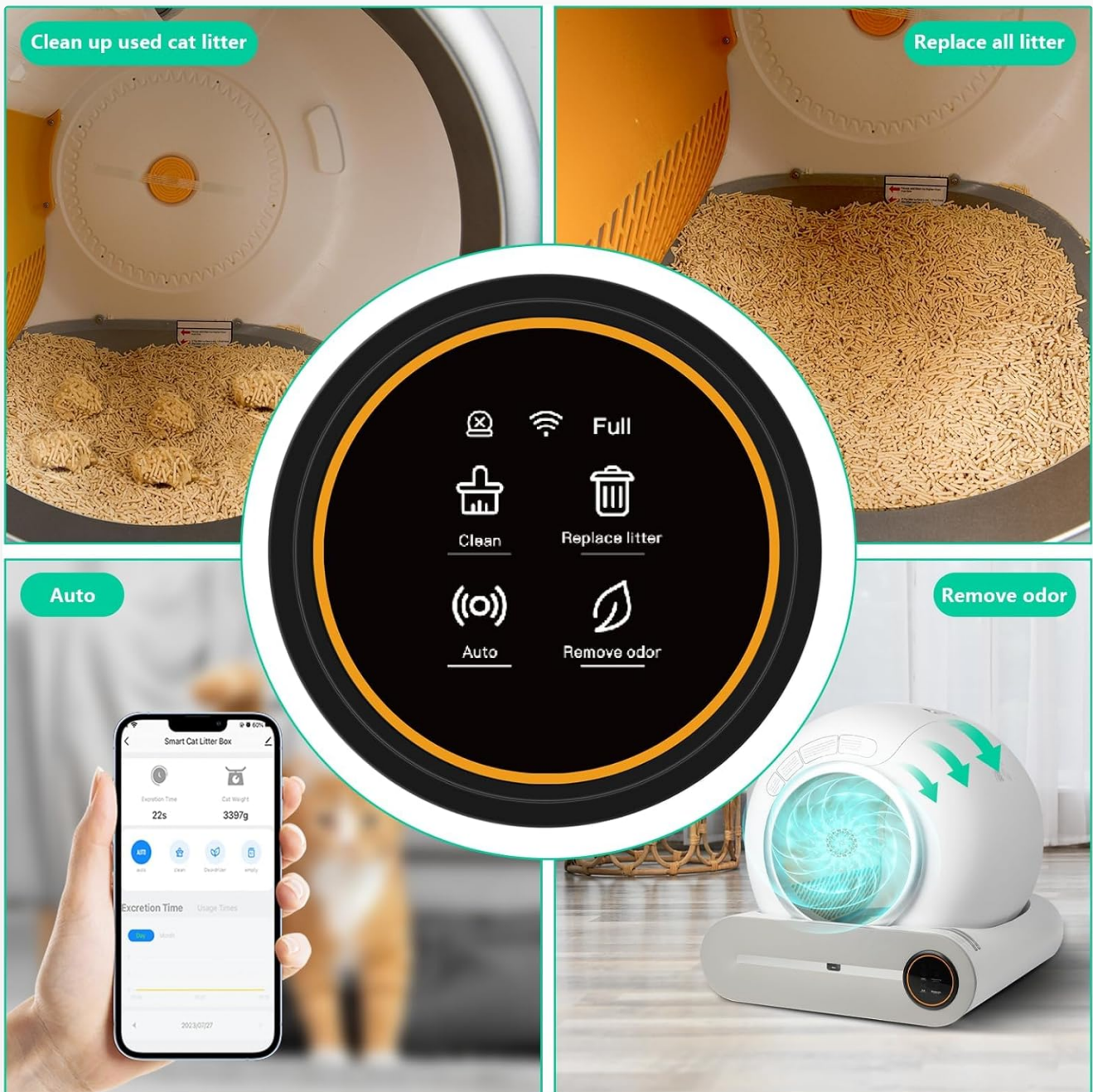
Overview of the control panel functions and app interface.

The control panel on the front of the unit allows for basic operations.