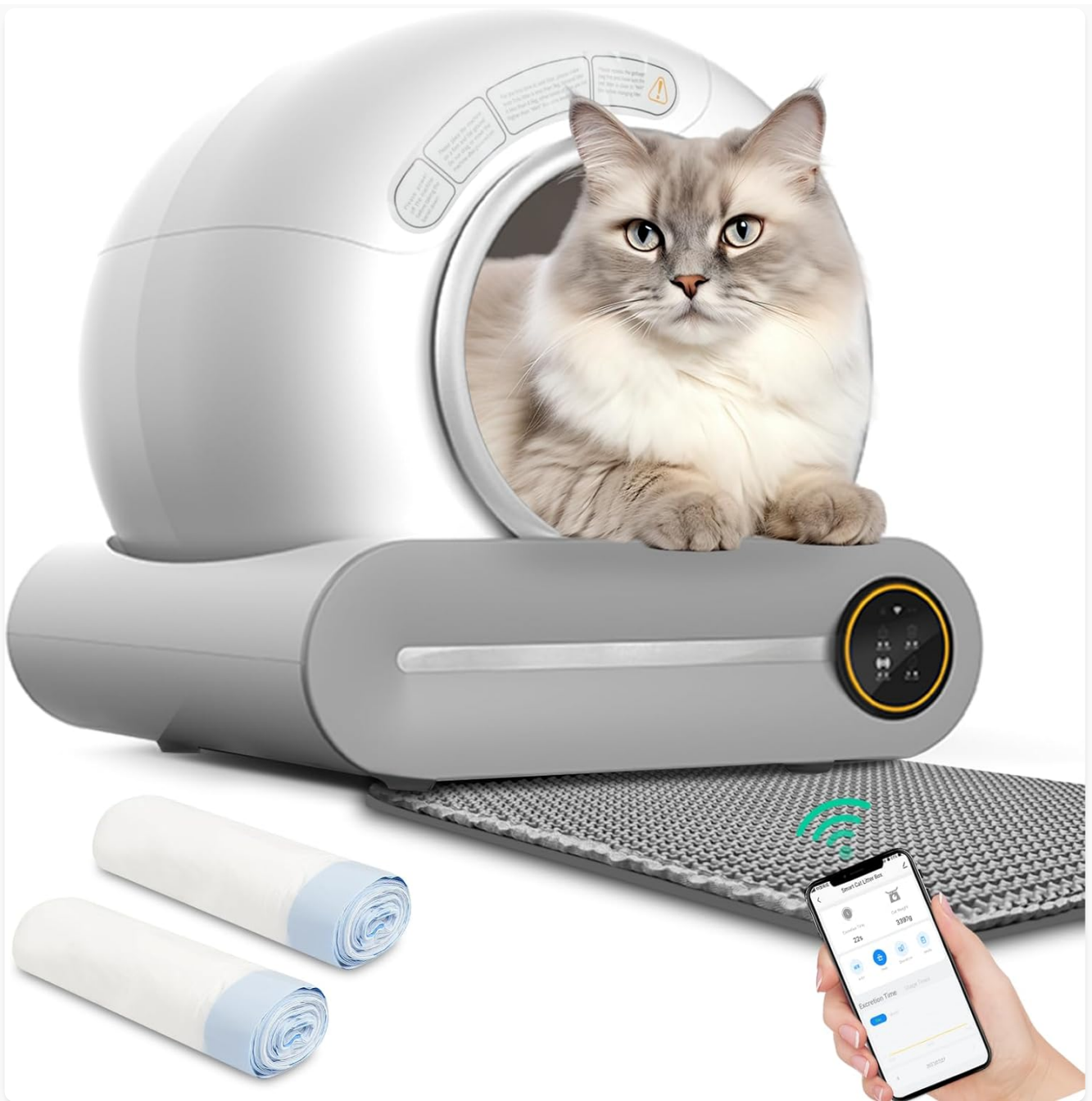
The Faazy Tuya Smart Cat Litter Box, designed for convenience and cleanliness.