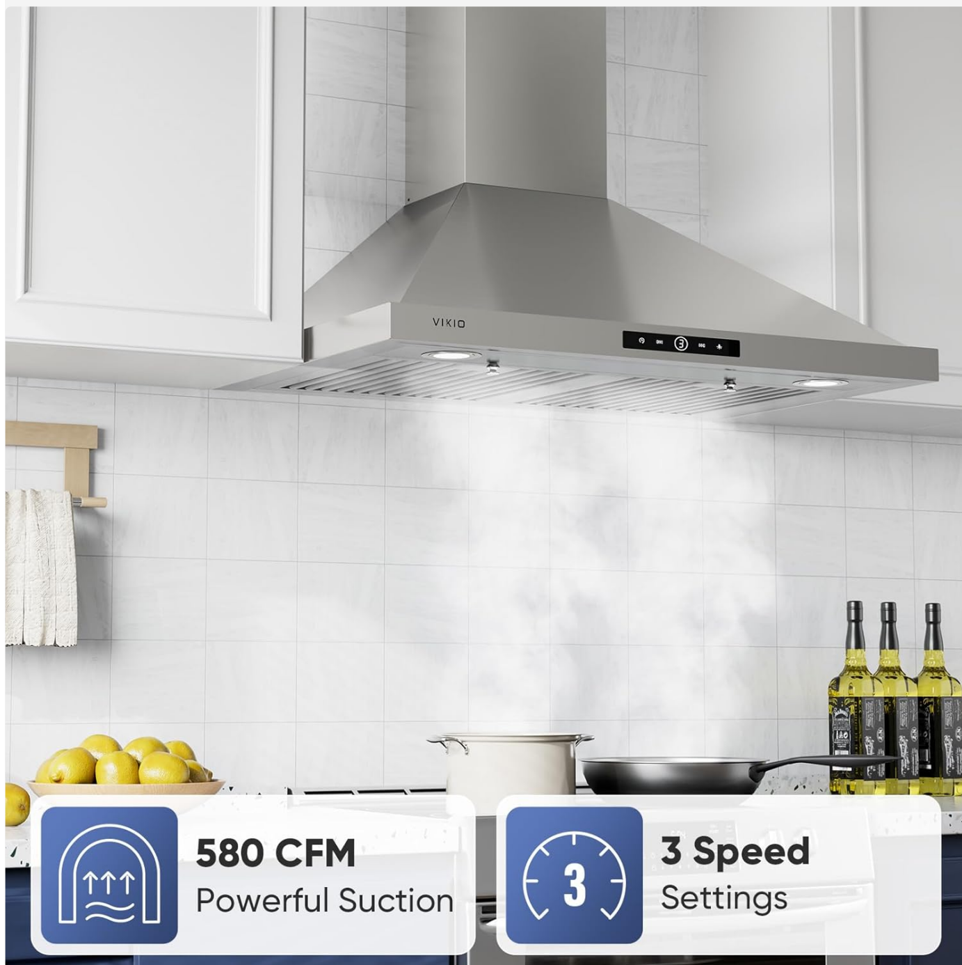
Illustration highlighting the 580 CFM powerful suction and 3-speed settings of the range hood.