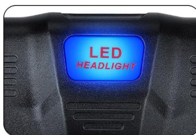
Night warning blue light