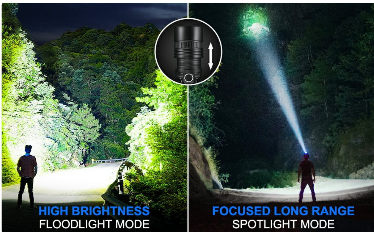
Image: Illustration of the headlamp's adjustable focus feature, demonstrating both spotlight and floodlight capabilities.