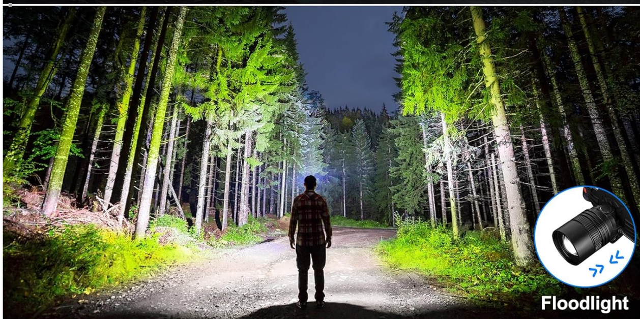
Image: The headlamp demonstrating its 90-degree adjustable angle and the comfortable, adjustable headband.