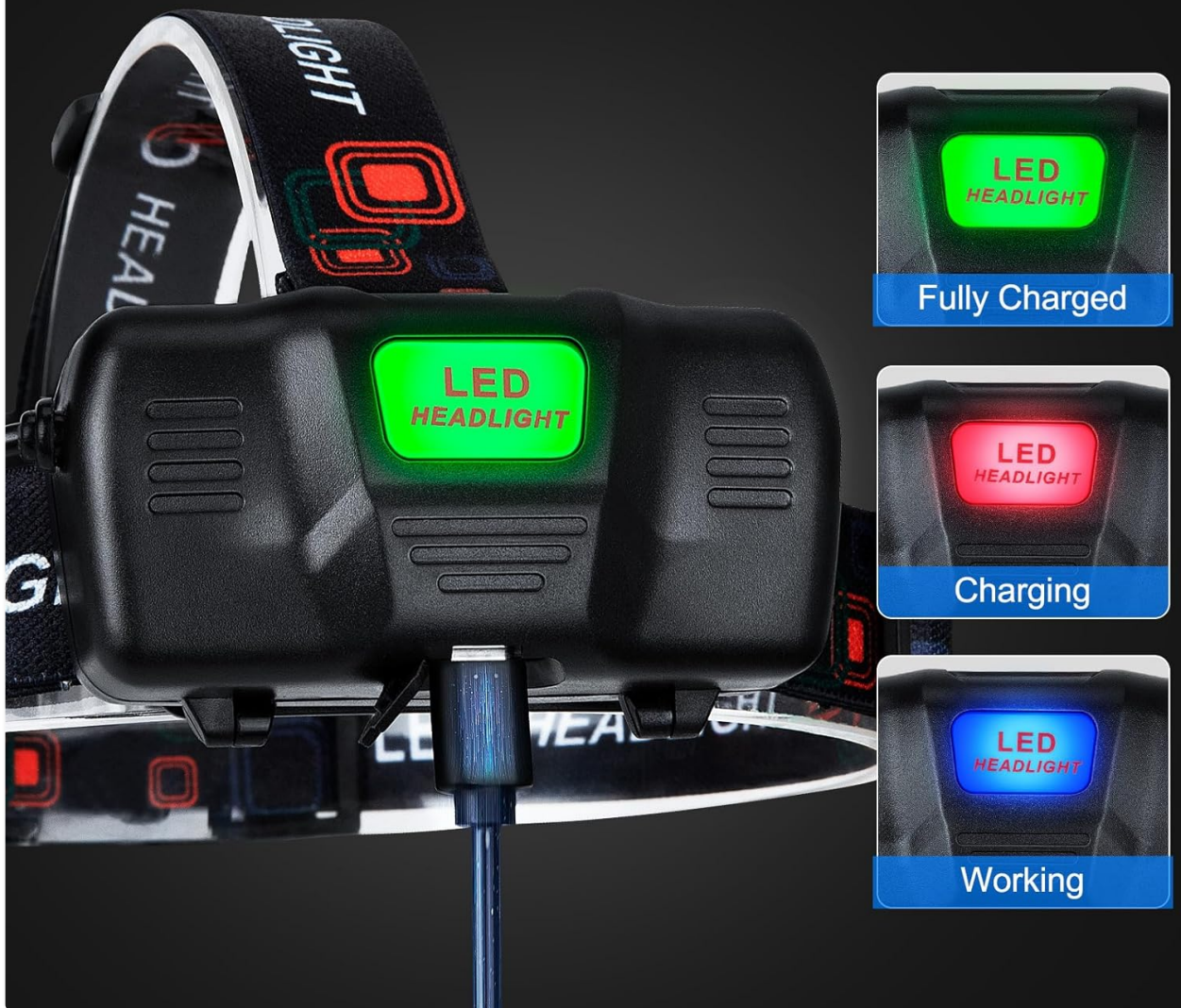
Image: A detailed view of the headlamp's components, highlighting the battery compartment and charging port.

Charged for 4 hours and can be used for up to 45 hours