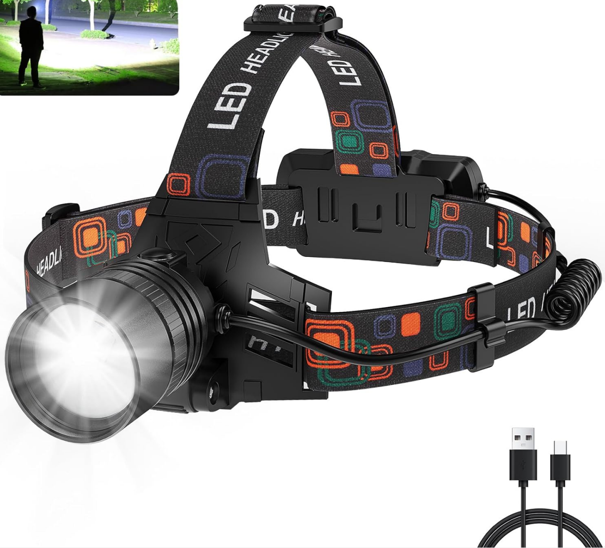
Image: The SKNSL P50 Rechargeable Headlamp, showing the main unit, adjustable headband, and USB charging cable.