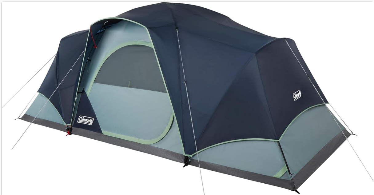
Image 1.1: The Coleman Skydome XL Large Family Tent, fully assembled.

The Coleman Skydome XL Large Family Tent is designed for comfortable outdoor living, offering quick setup and robust weather protection. This manual provides detailed instructions for assembly, use, and care to ensure optimal performance and longevity of your tent.