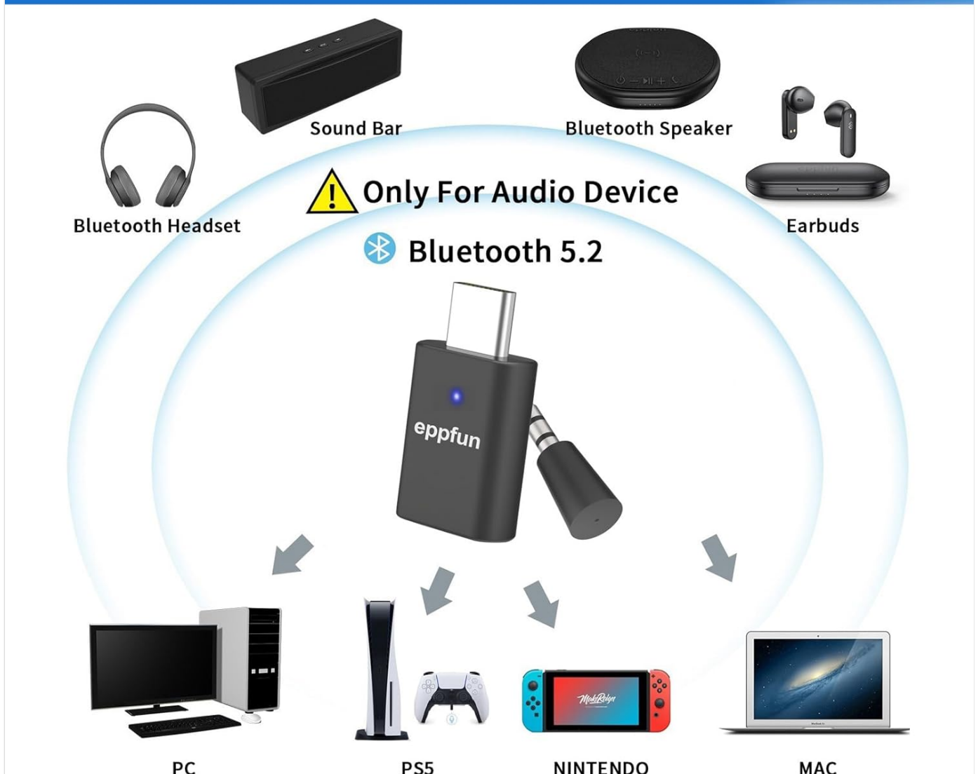
Image: The eppfun AK3040Pro adapter connected to a Nintendo Switch, enabling wireless audio for gaming.

Connect a dedicated microphone to the PS5 controller and enjoy voice chat