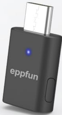
AK 3040 pro