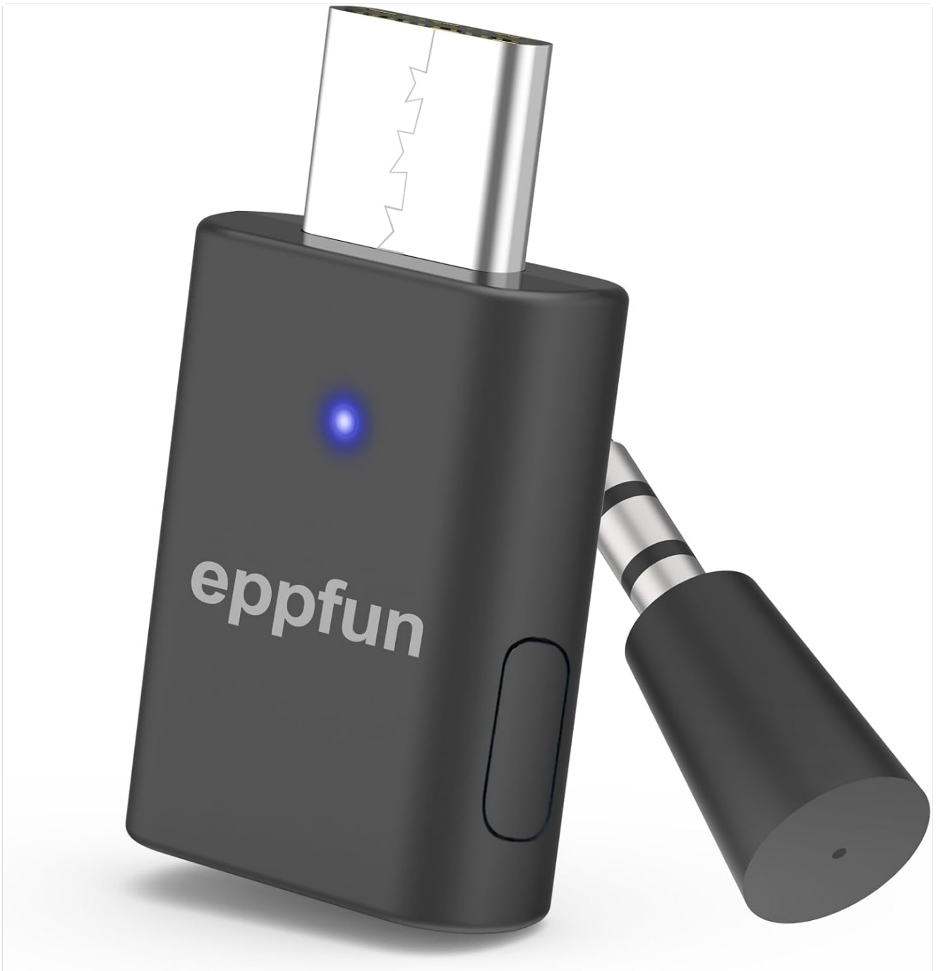
Image: The eppfun AK3040Pro USB C Bluetooth Adapter.