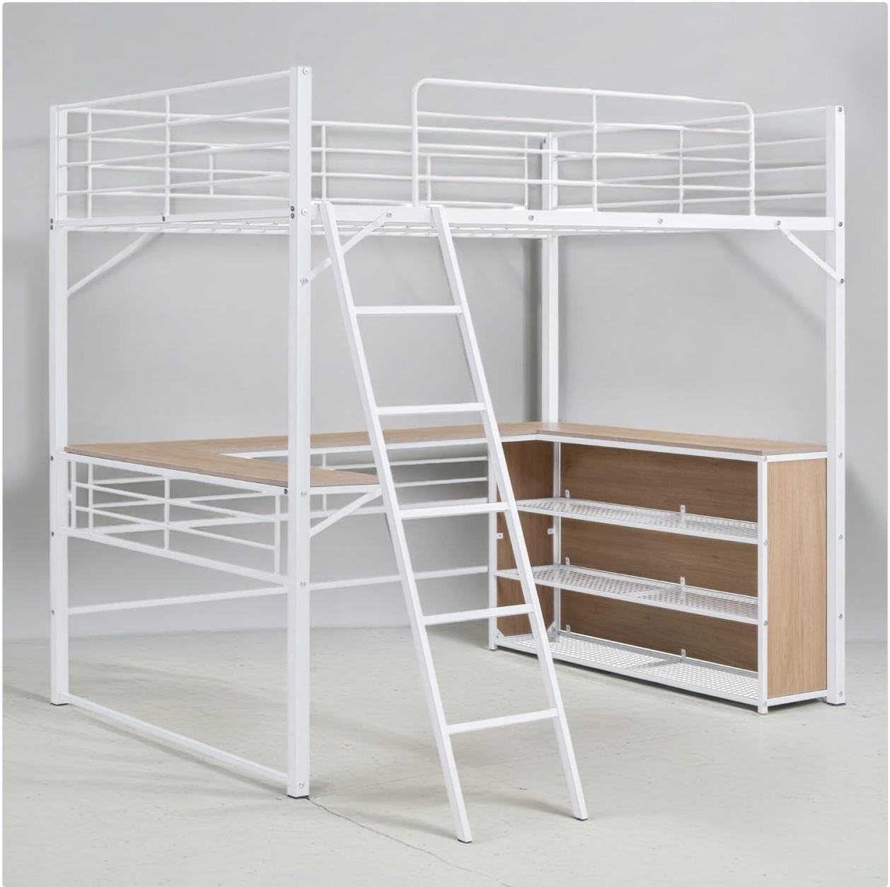
Figure 3.1: Assembled loft bed frame, illustrating the structure before adding a mattress or personal items.