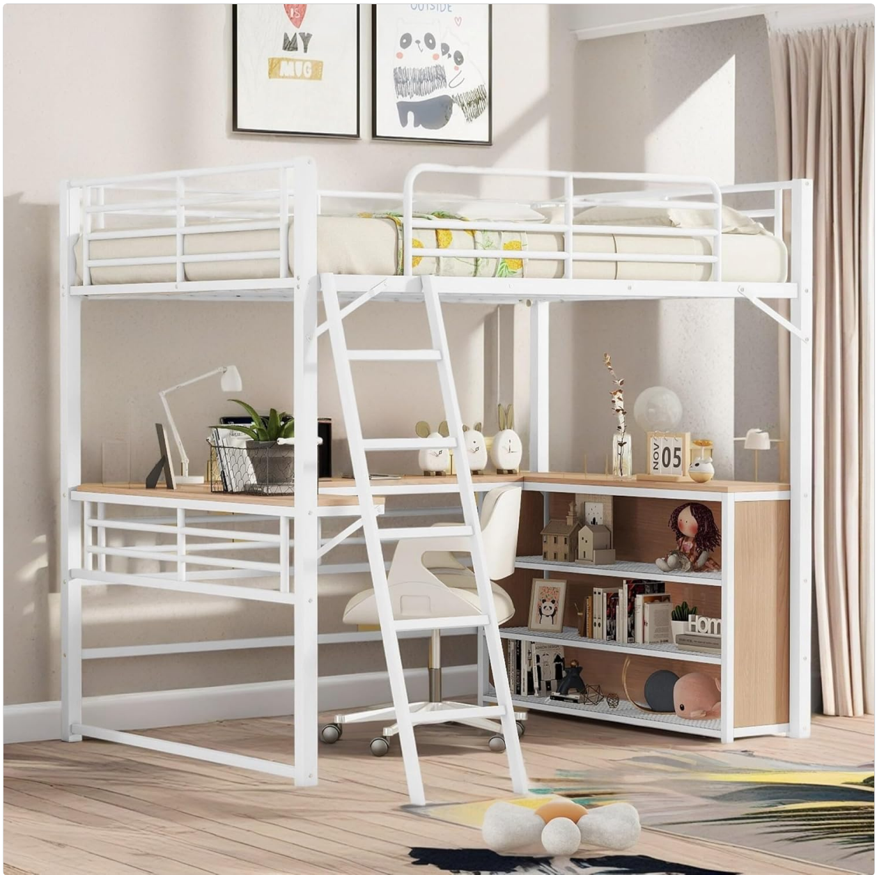
Figure 4.1: The ROOMTEC loft bed in a typical room setup, showcasing its functionality with a desk and shelves.