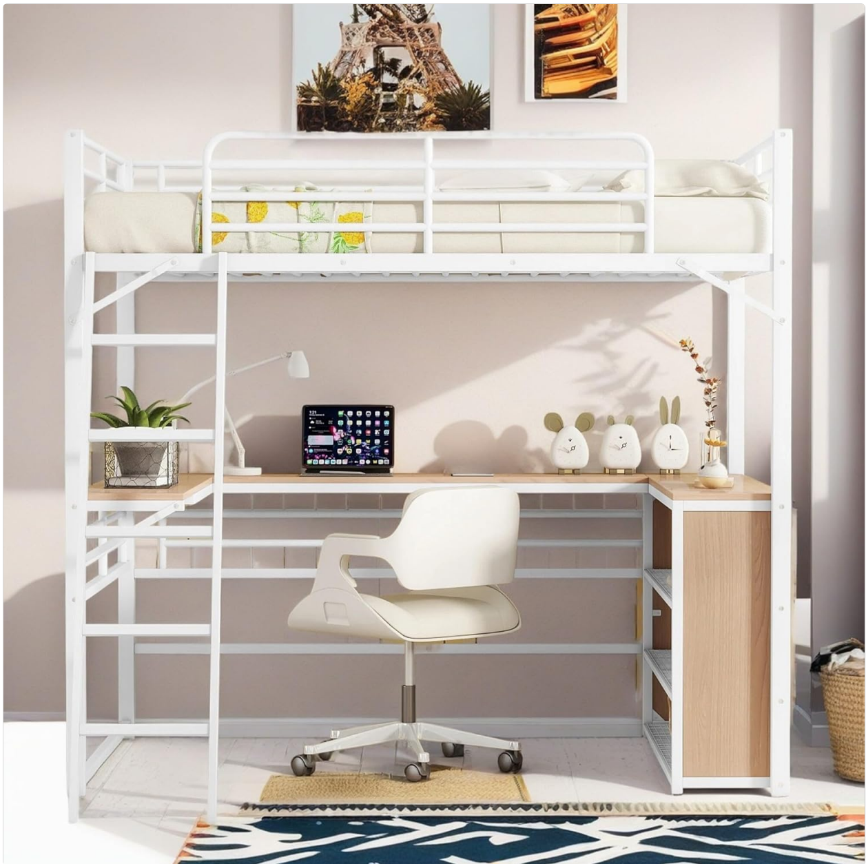
Figure 4.2: Detailed view of the L-shaped desk area and integrated shelves, demonstrating potential use for study or work.