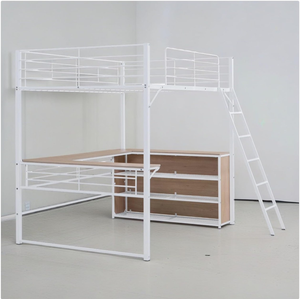
Figure 3.2: Side view of the loft bed frame, highlighting the integrated L-shaped desk and shelving unit.