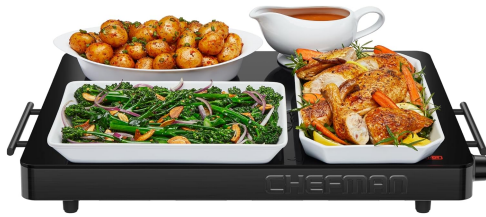
The Chefman Electric Warming Tray, showcasing its sleek black glass top and cool-touch handles.