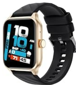
Image: The Weofly Smart Watch screen showing detailed activity tracking data, including steps, calories, heart rate, and distance covered.