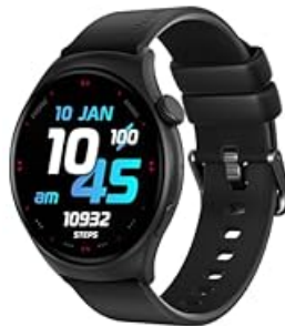
Image: A selection of unique and customizable watch faces available for the Weofly Smart Watch.

Personalize your watch face with over 300 available dials or create custom ones through the companion app to match your style and preferences.