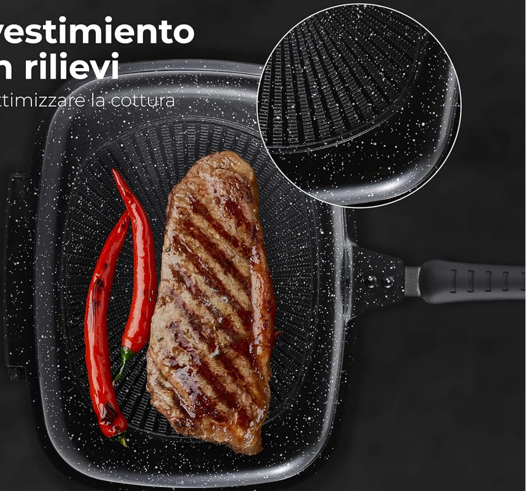
Image: A close-up of the ribbed cooking surface, showing a piece of grilled meat and chili peppers, demonstrating its use for optimal grilling.