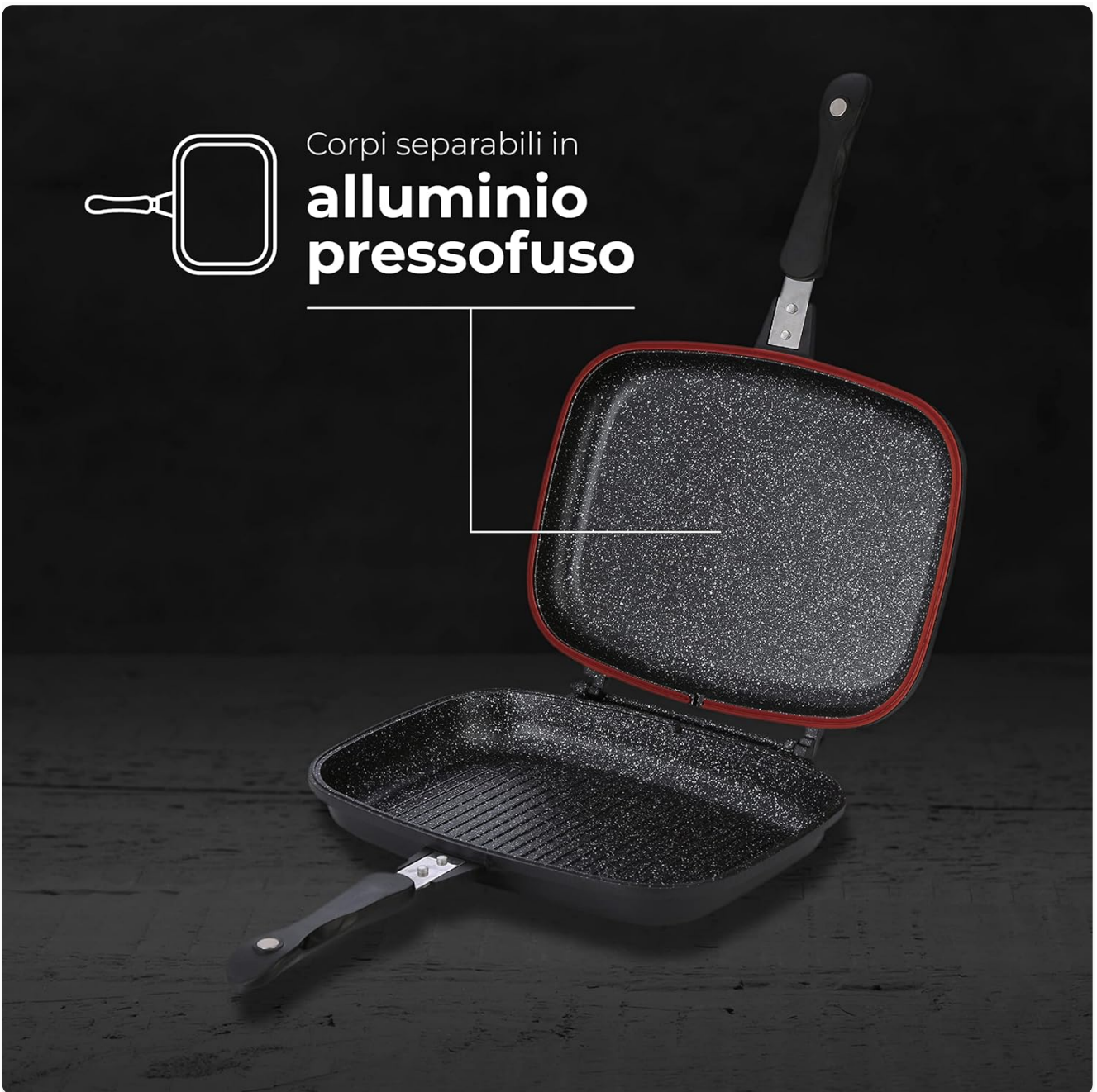
Image: The two halves of the grill pan are shown separated, highlighting the cast aluminum construction and the hinge mechanism that allows them to detach.

Corpi separabili in alluminio pressofuso