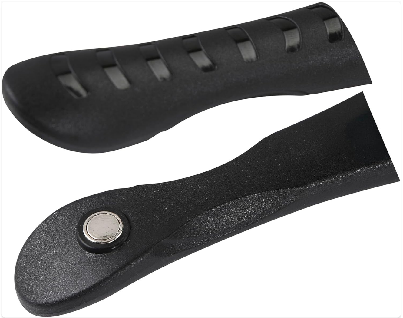
Image: A close-up view of the bakelite handle, showing the integrated magnet that ensures a secure closure when the two pan halves are brought together.