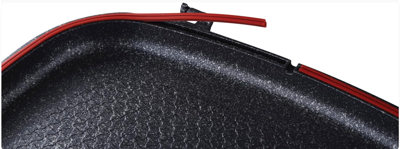
Image: A detailed view of the red silicone gasket, which fits into the rim of the pan to create an airtight seal for the 'oven effect' cooking.