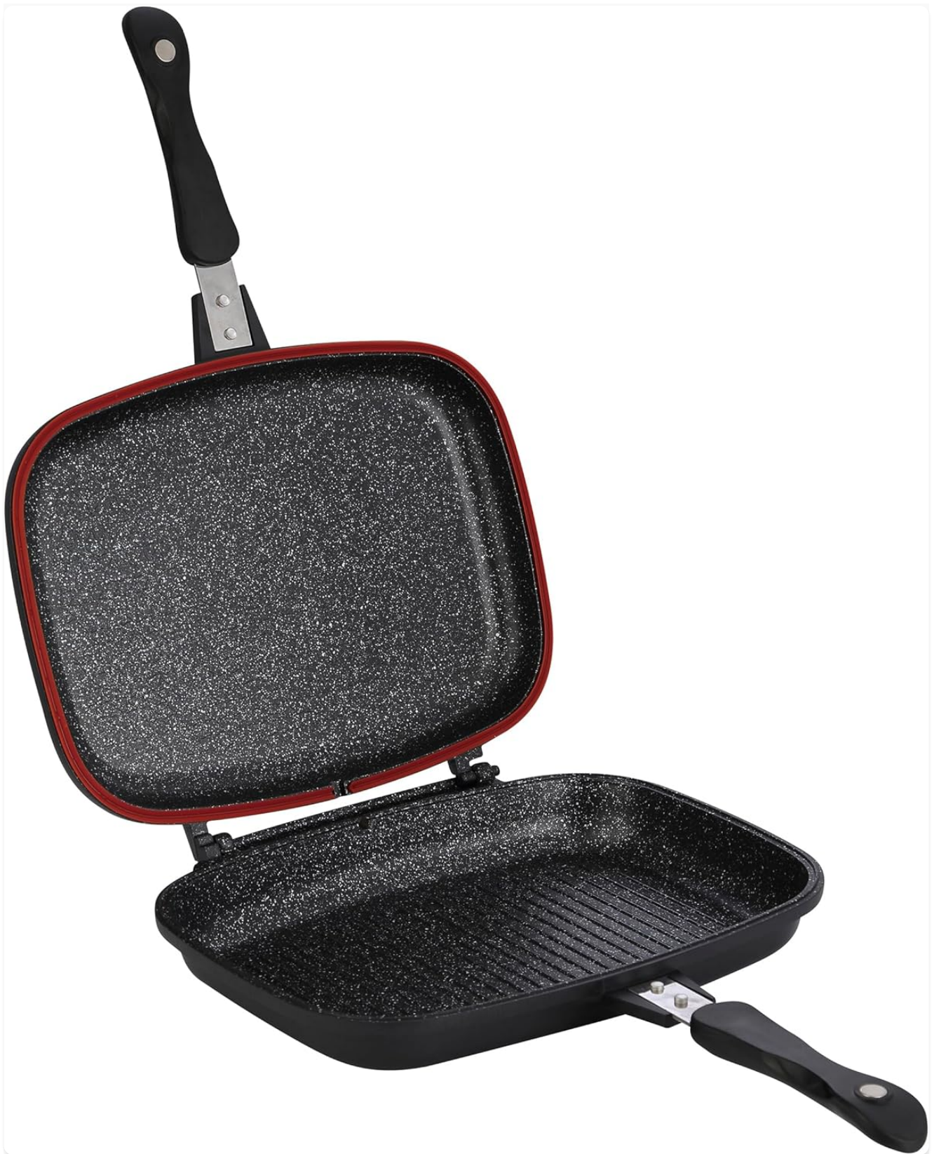
Image: The double grill pan opened, revealing both the ribbed and smooth non-stick cooking surfaces, ready for use.