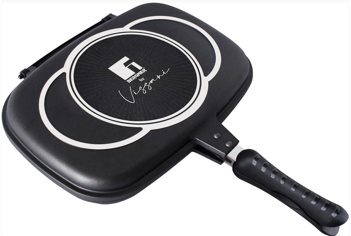
Image: The BERGNER by Vissani Double Grill Pan in its closed position, showcasing the sleek black exterior and the 'BERGNER by

Thank you for choosing the BERGNER by Vissani Double Grill Pan. Designed in collaboration with Chef Gianfranco Vissani, this innovative cookware offers a unique 'oven effect' for healthier cooking with less smoke and odors. Crafted from durable cast aluminum with a high-performance non-stick stone effect coating, it features separable bodies and a secure magnetic closure for versatile use. Please read this manual carefully before first use to ensure proper operation and maintenance.