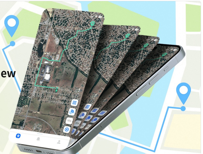
Image: An illustration of the app's 180-day trip replay feature, showing historical routes on a map.

Supports 180-days trip replay, allowing you to review detailed movement history over half a year. Easily track past routes, monitor activities, and analyze patterns for enhanced insights and management.