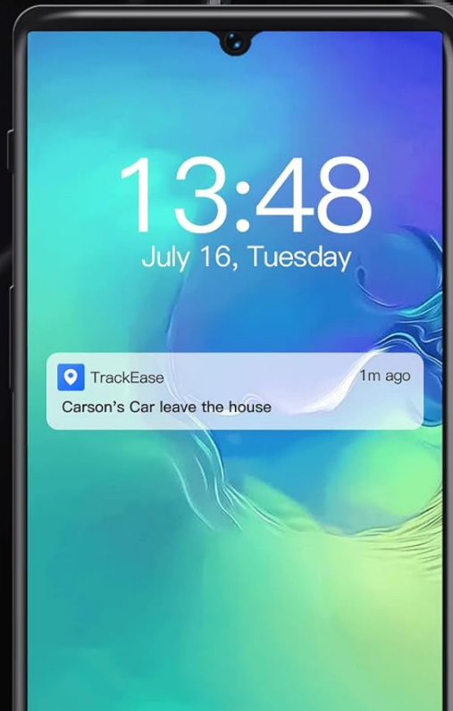
Image: A smartphone screen showing push notifications for various driving alerts, such as vehicle overspeed and geo-fence breaches.