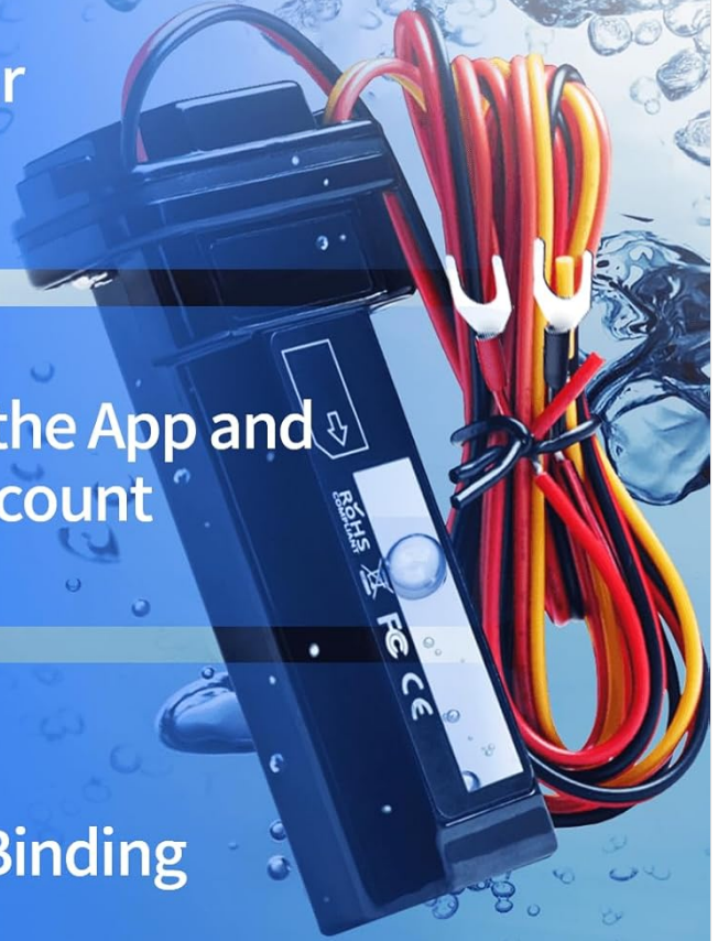
Image: Visual guide for the 3-step installation process: connecting to the car battery, downloading the app and registering, and scanning the device's serial number.