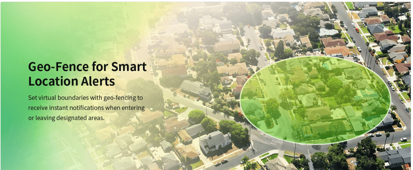
Image: An aerial map view highlighting a geo-fenced area, illustrating how virtual boundaries are set for location alerts.

Set virtual boundaries with geo-fencing to receive instant notifications when entering or leaving designated areas.