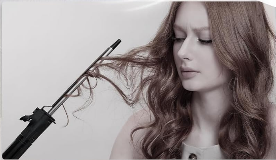
Image: The smart chip technology prevents hair from getting stuck or tangled during curling.