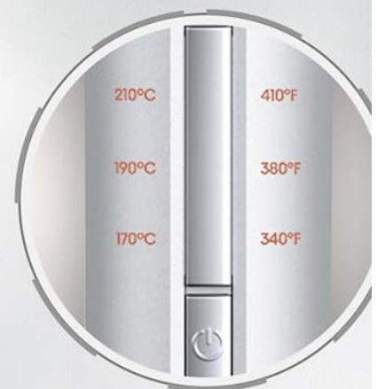
Image: Three temperature settings for different hair textures (fine, medium, coarse) are indicated on the curling iron's display.

3 TEMPERATURE SETTINGS FOR EVERY HAIR TYPE AND TEXTURE.