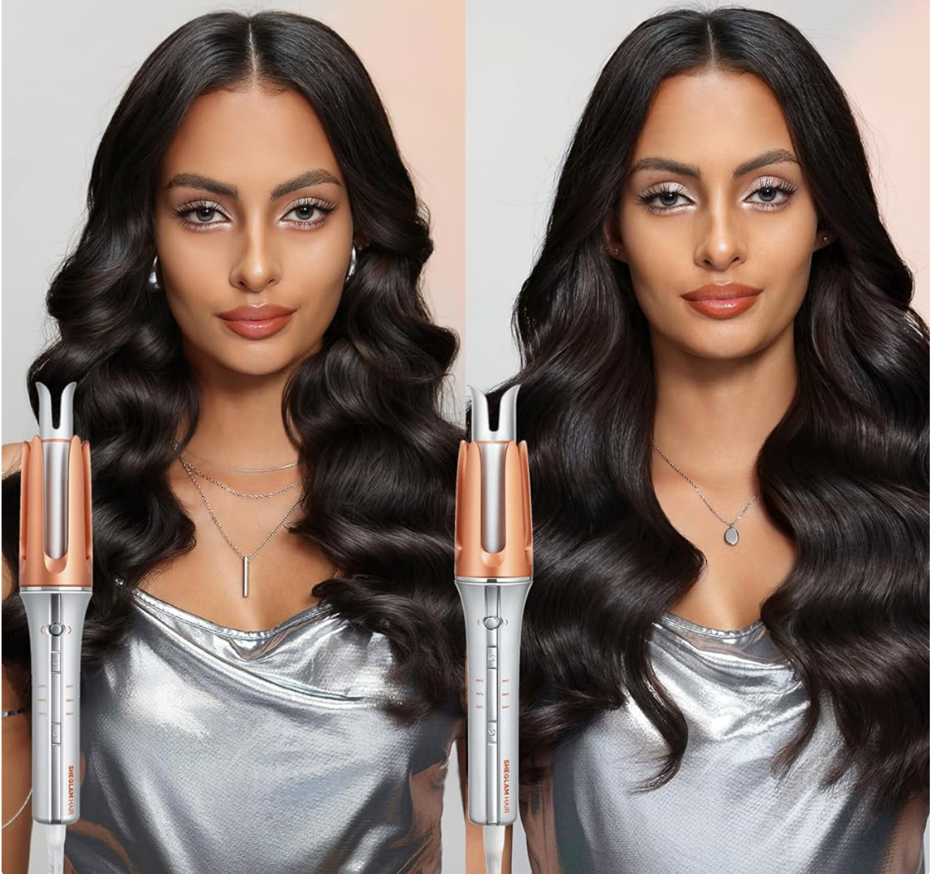
Image: Demonstrates the difference between tight curls (1-inch barrel) and loose waves (1.25-inch barrel).