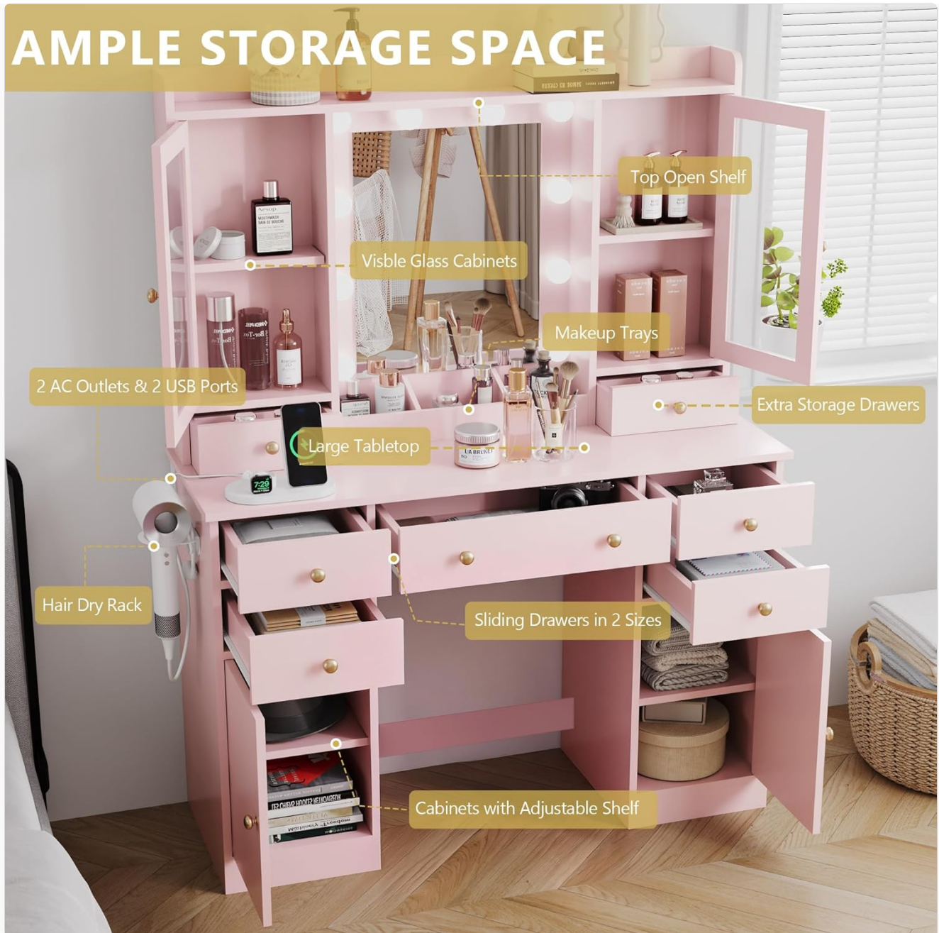
Image: An exploded view of the vanity desk, highlighting the various storage options including drawers, glass cabinets, and open shelves.