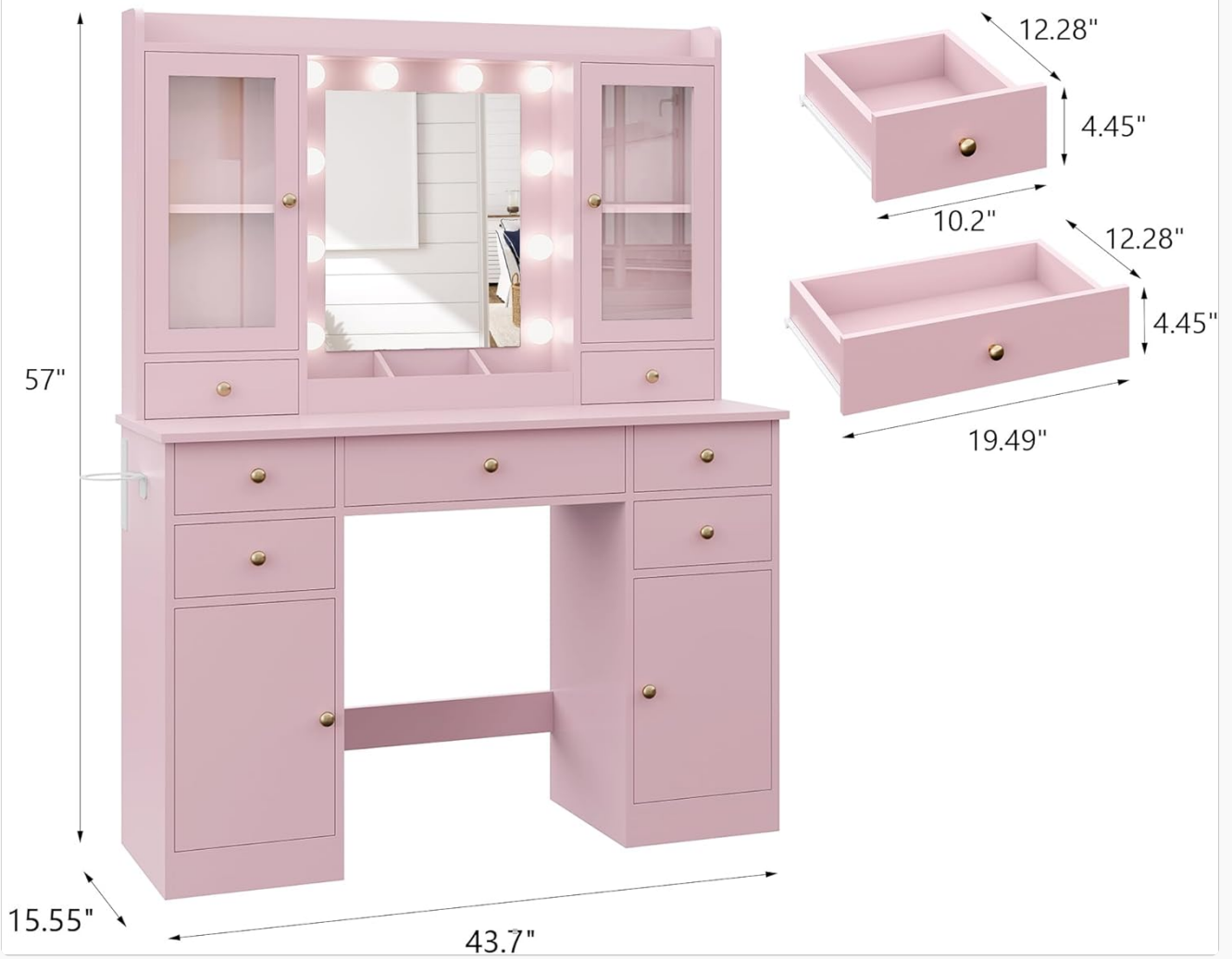
Image: A visual representation of the vanity desk's dimensions, including height, width, and depth.