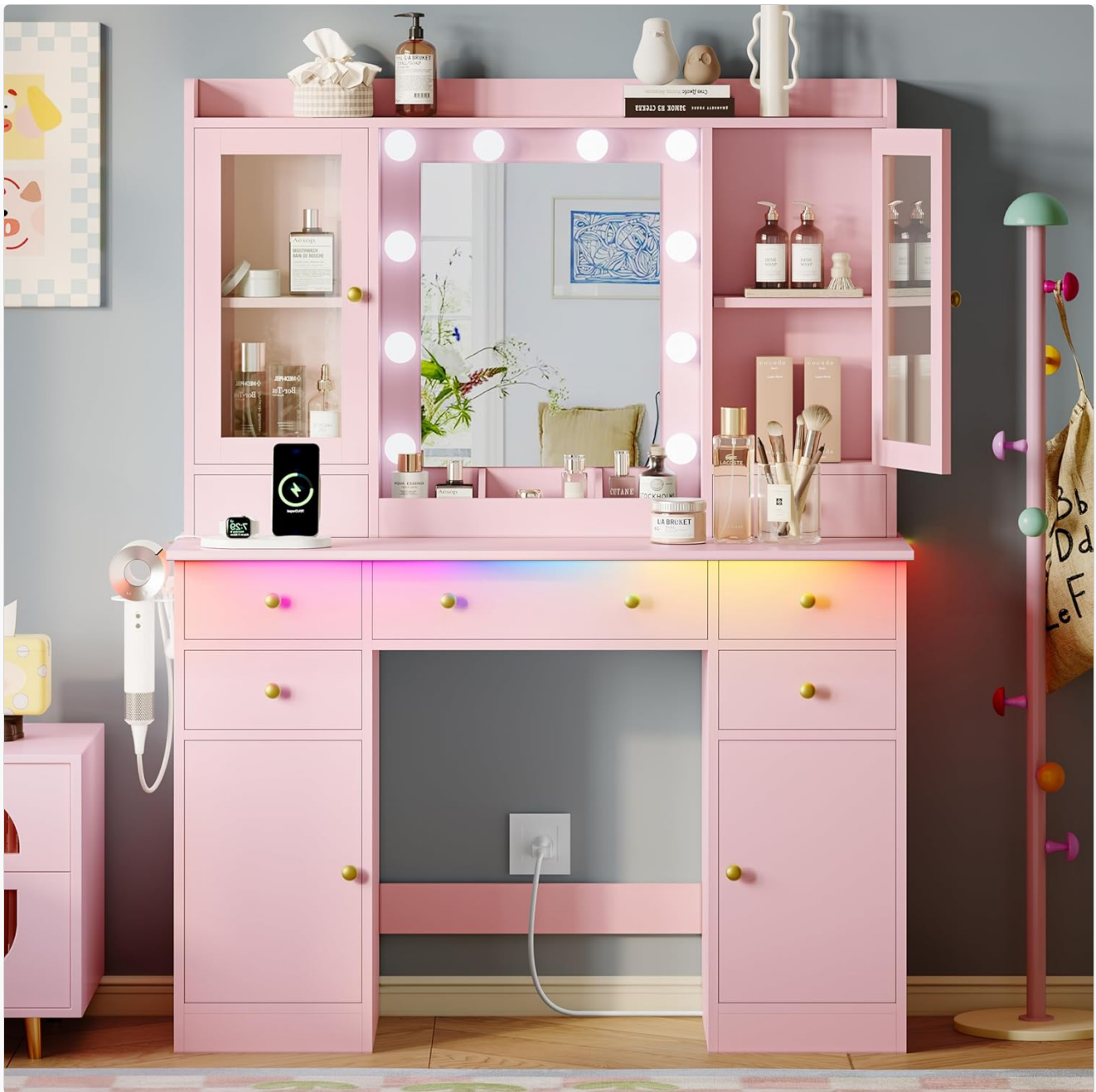
Image: The Xixini Makeup Vanity Desk in pink, featuring a lighted mirror, multiple drawers, and cabinets.