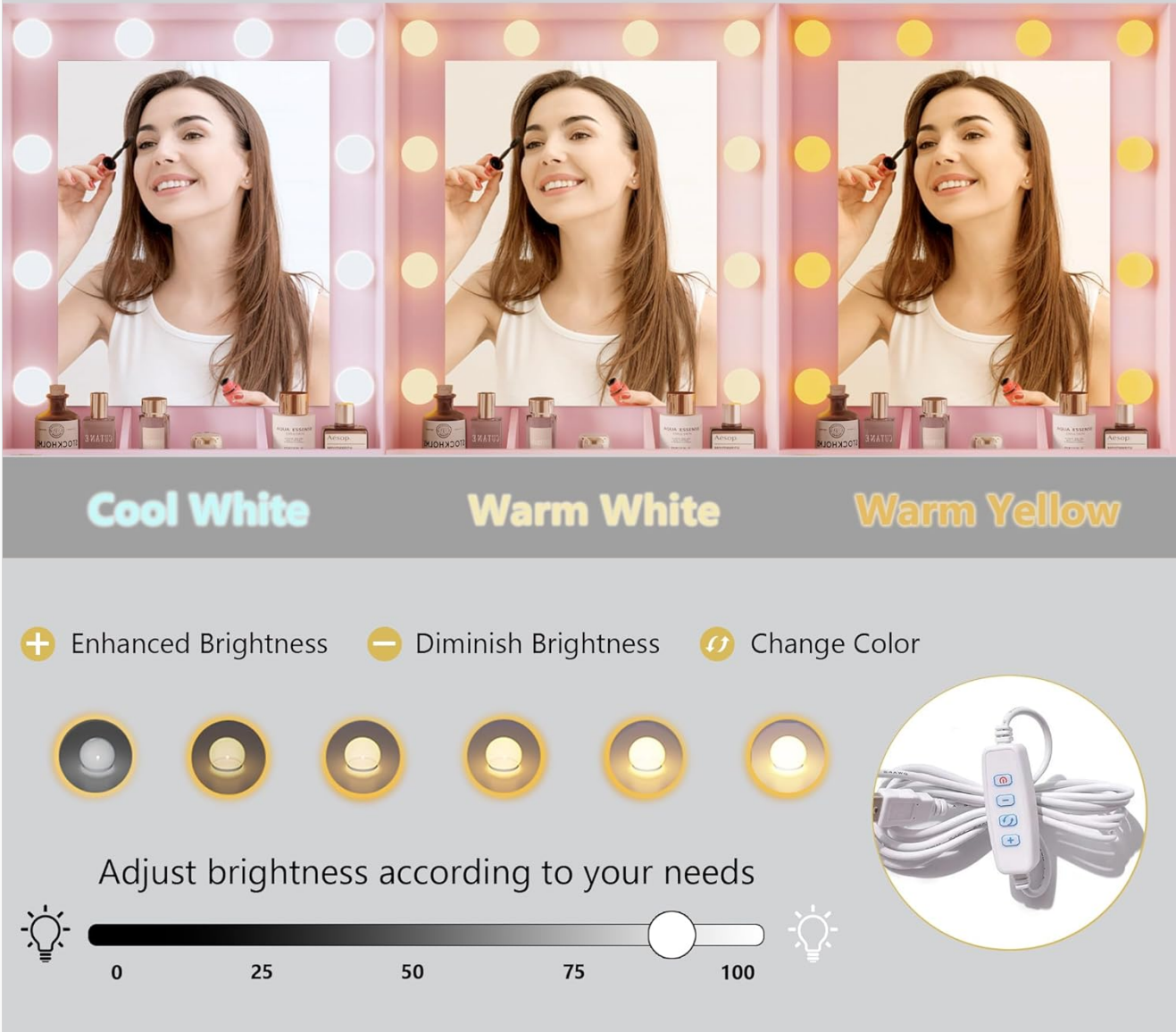
Image: Demonstrates the three available lighting modes for the mirror: Cool White, Warm White, and Warm Yellow, along with brightness adjustment controls.