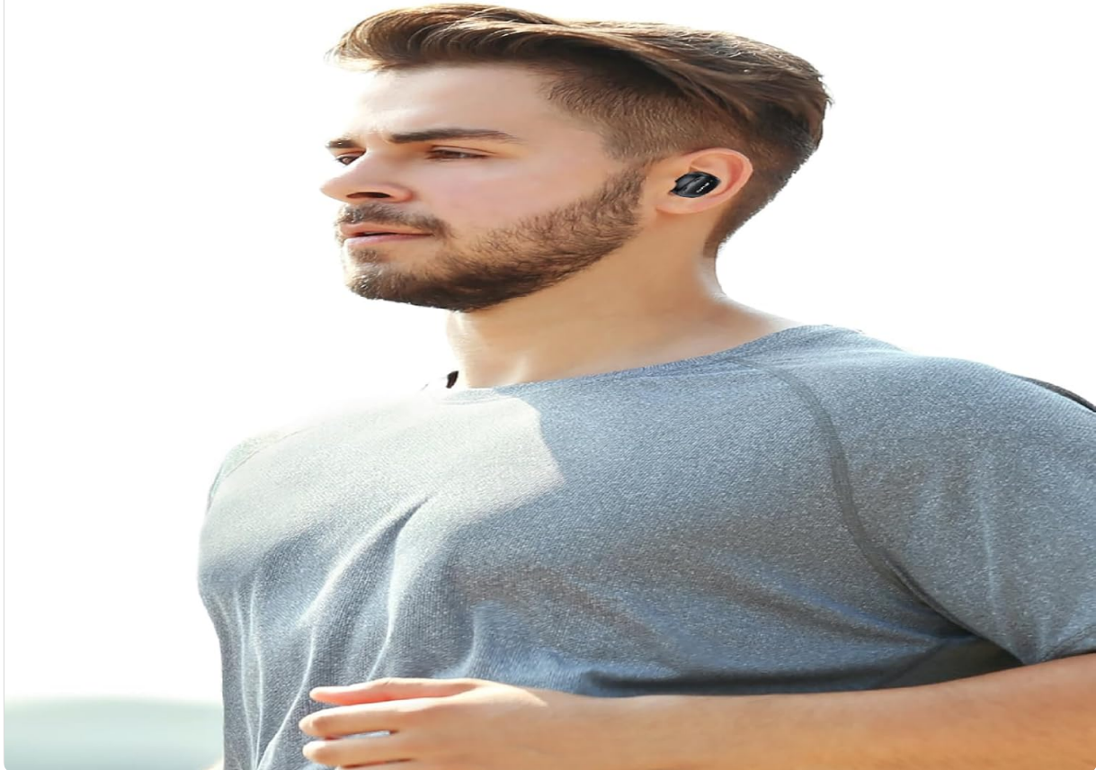
Image depicting a person wearing the AWEI T13 Pro earbud, demonstrating its ergonomic and lightweight design for comfortable wear.

The shape has been finely crafted and adjusted. The single earbud is as light as 4.2g without burden to wear