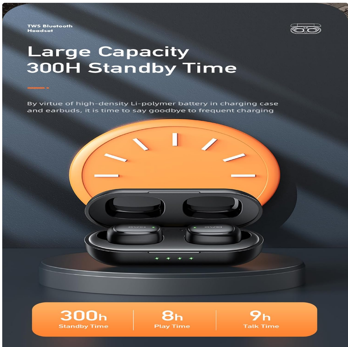
Image showing the charging case with earbuds inside, indicating battery life metrics: 300 hours standby time, 8 hours play time, and 9 hours talk time per charge.