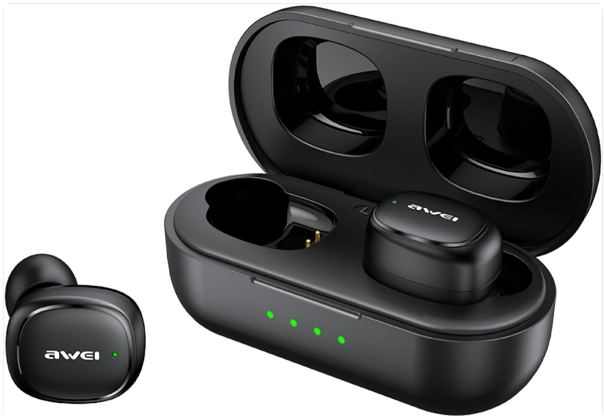
Image showing the AWEI T13 Pro wireless earbuds and their charging case, both in black, with the case open.