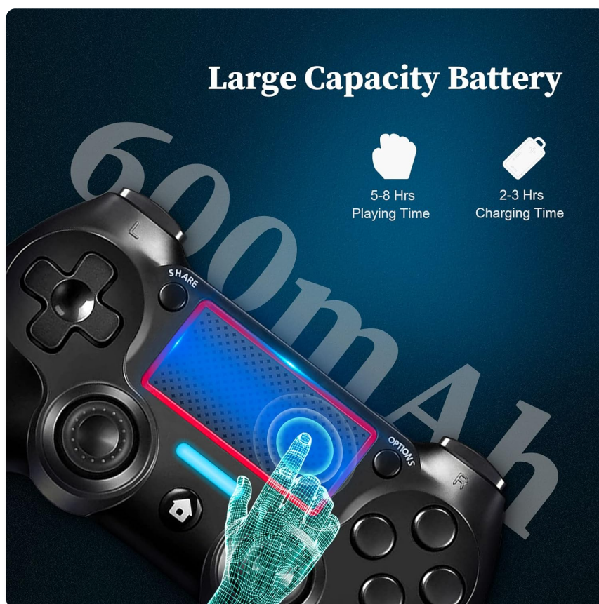
Figure 5.1: Information on the 600mAh large capacity battery, providing 5-8 hours of playing time and requiring 2-3 hours for a full charge.