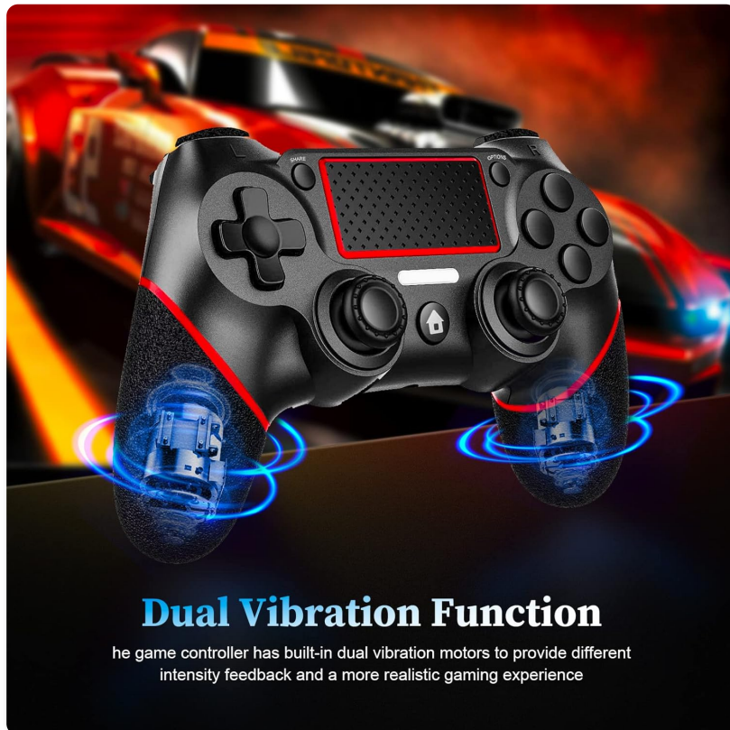
Illustration of the dual vibration function providing intensity feedback.