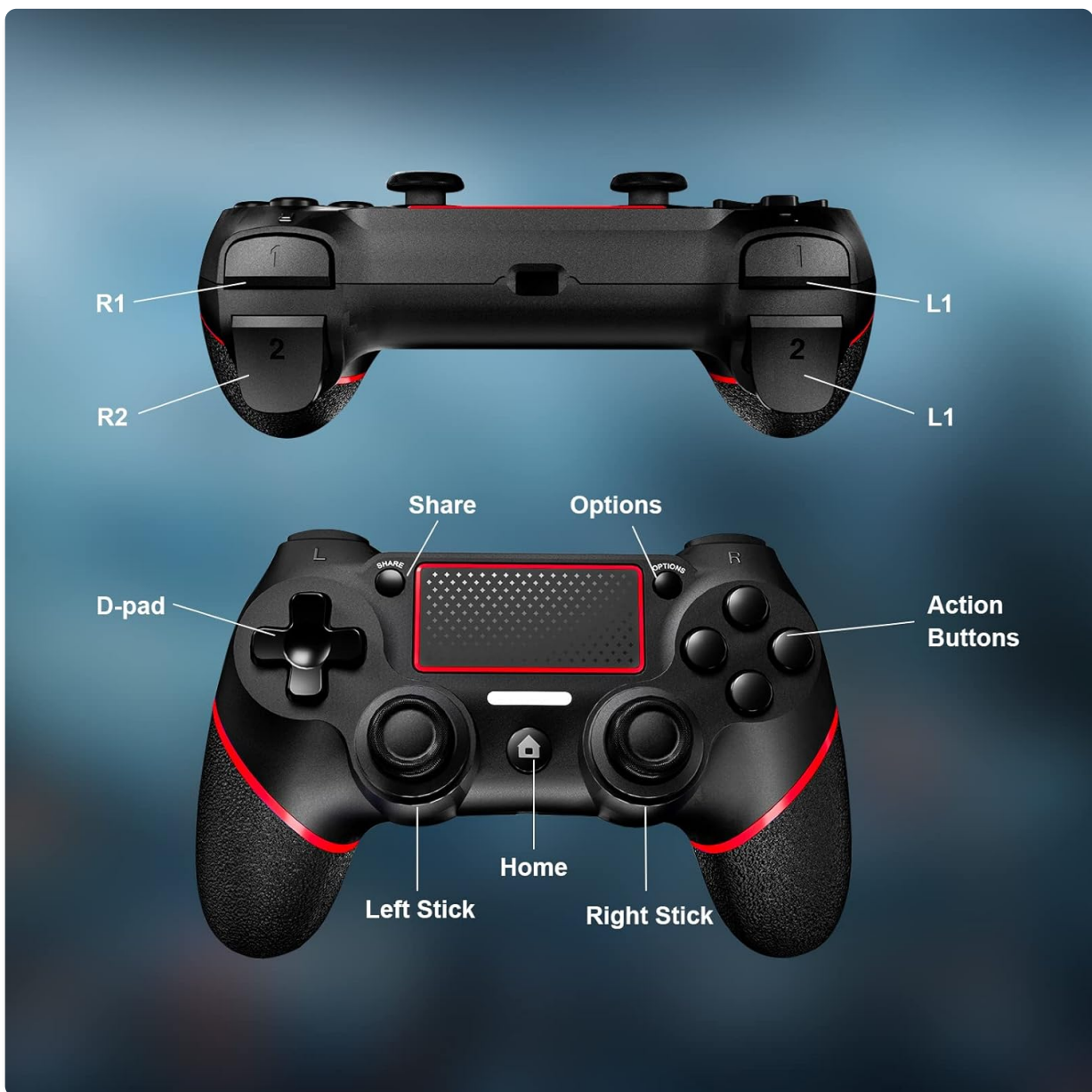
Figure 4.1: Detailed diagram of the controller's buttons and their labels, including L1, L2, R1, R2, Share, Options, D-pad, Action Buttons, Left Stick, Right Stick, and Home button.