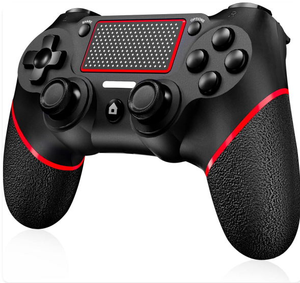
Figure 2.1: Front view of the Shiptree Wireless Pro Controller, showcasing its ergonomic design and button layout.