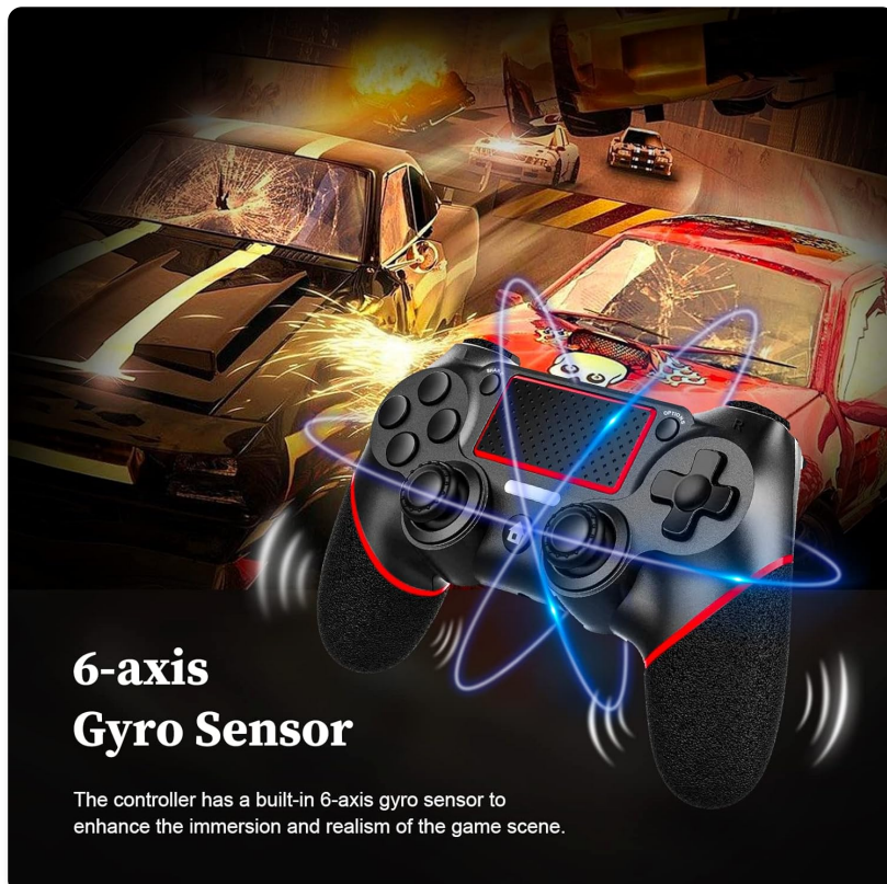
Illustration of the 6-axis gyro sensor enhancing immersion and realism.