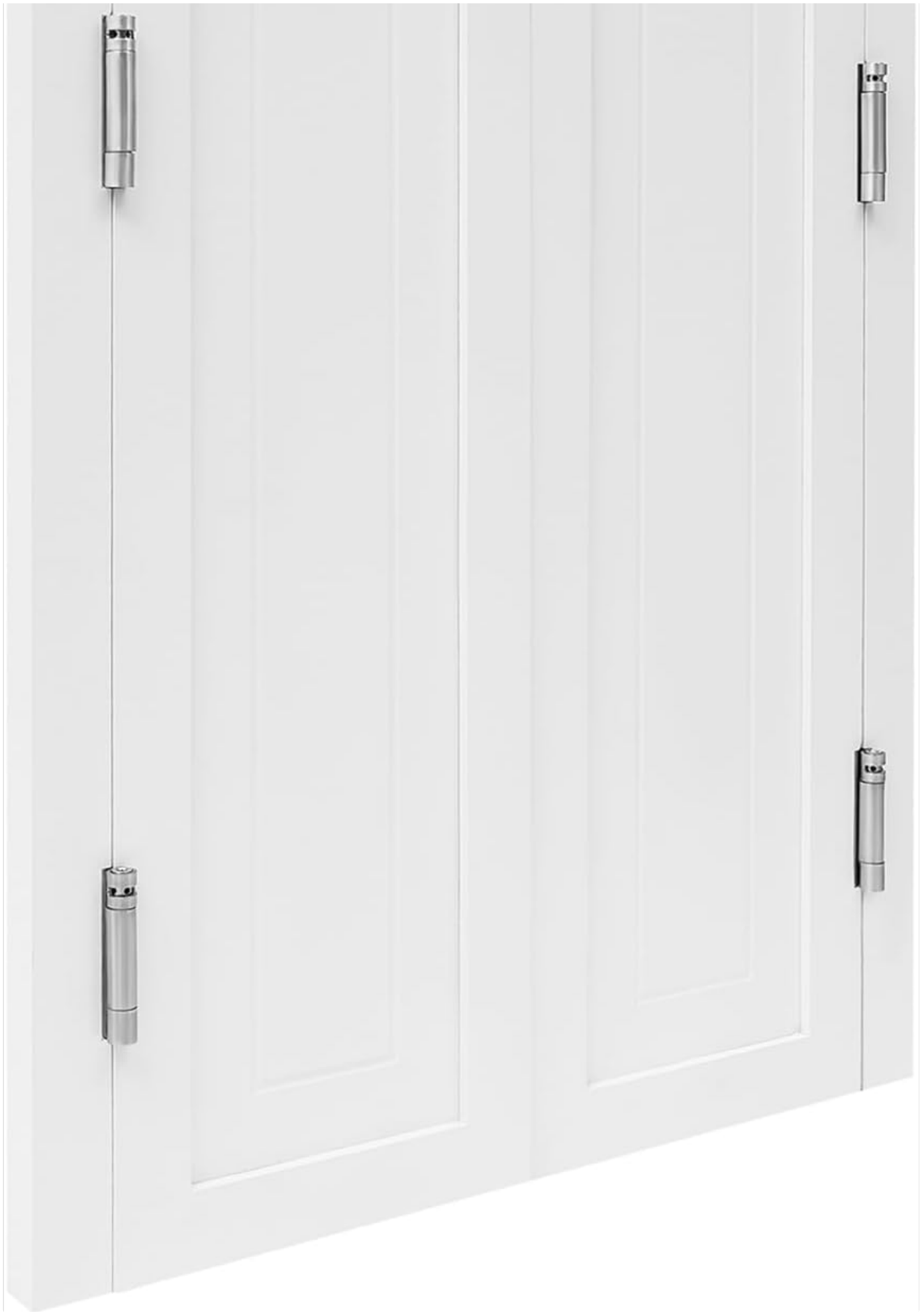
Figure 1: Package Contents - Two door panels, hinges, and assembly accessories.