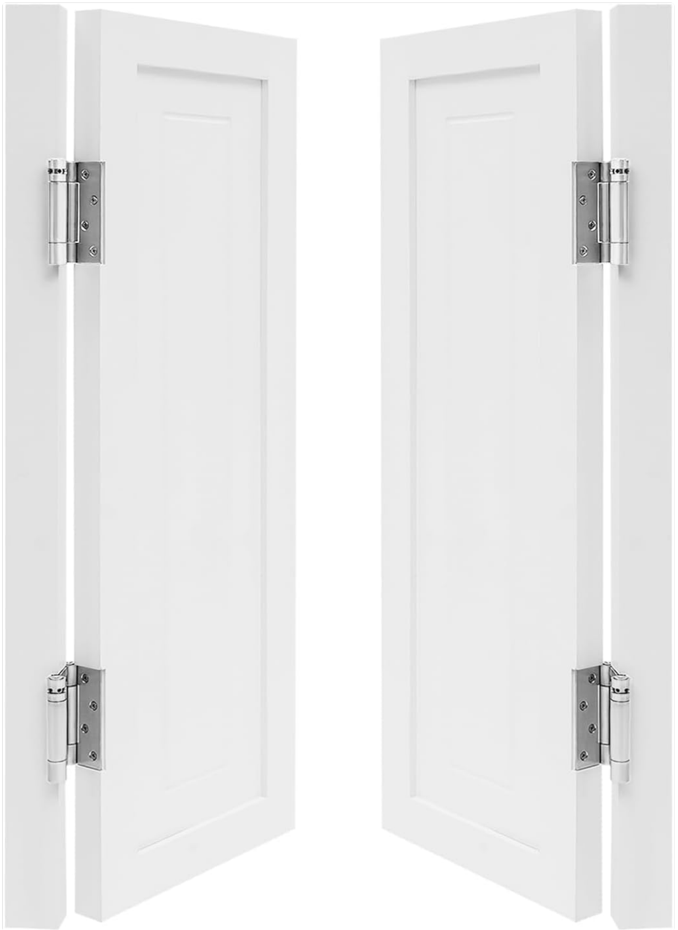
Figure 5: Doors in open position, demonstrating bi-directional swing.