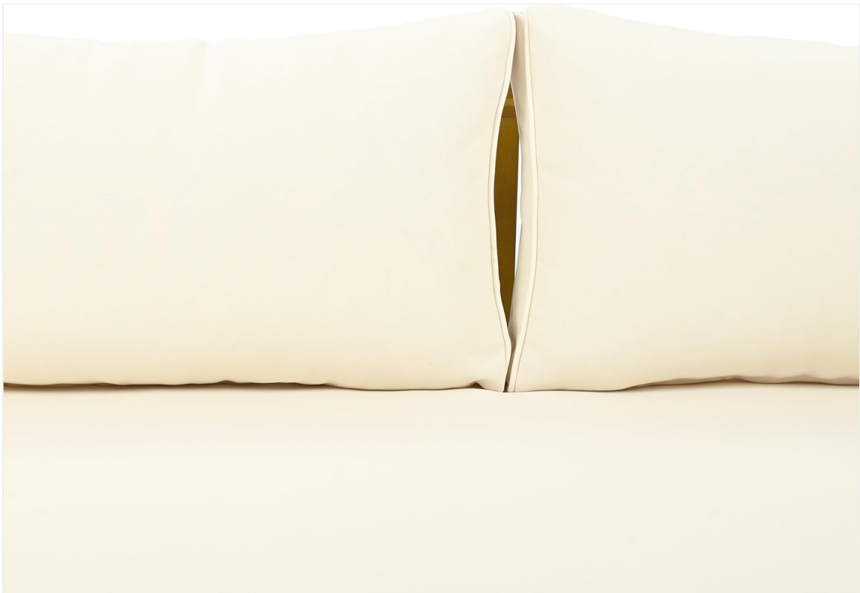
Figure 5: Detail of the cushion zipper, indicating removable covers for cleaning.