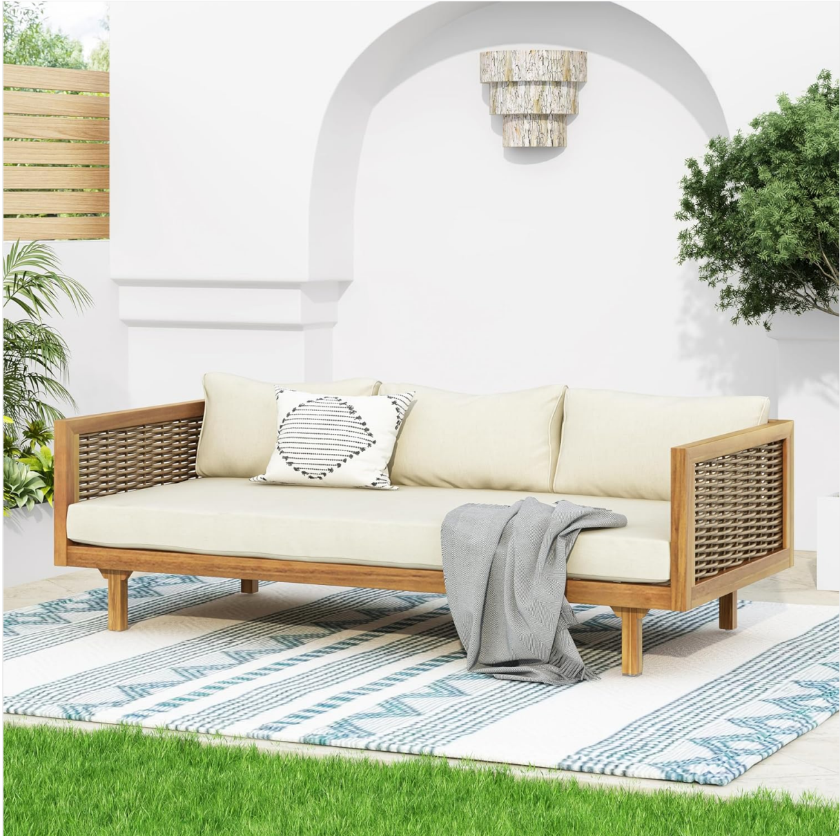
Figure 2: Fully assembled Merax Outdoor Patio Daybed in an outdoor environment.