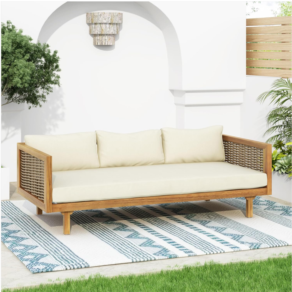
Figure 3: Front view of the daybed, illustrating the integrated rattan armrests and the overall structure.