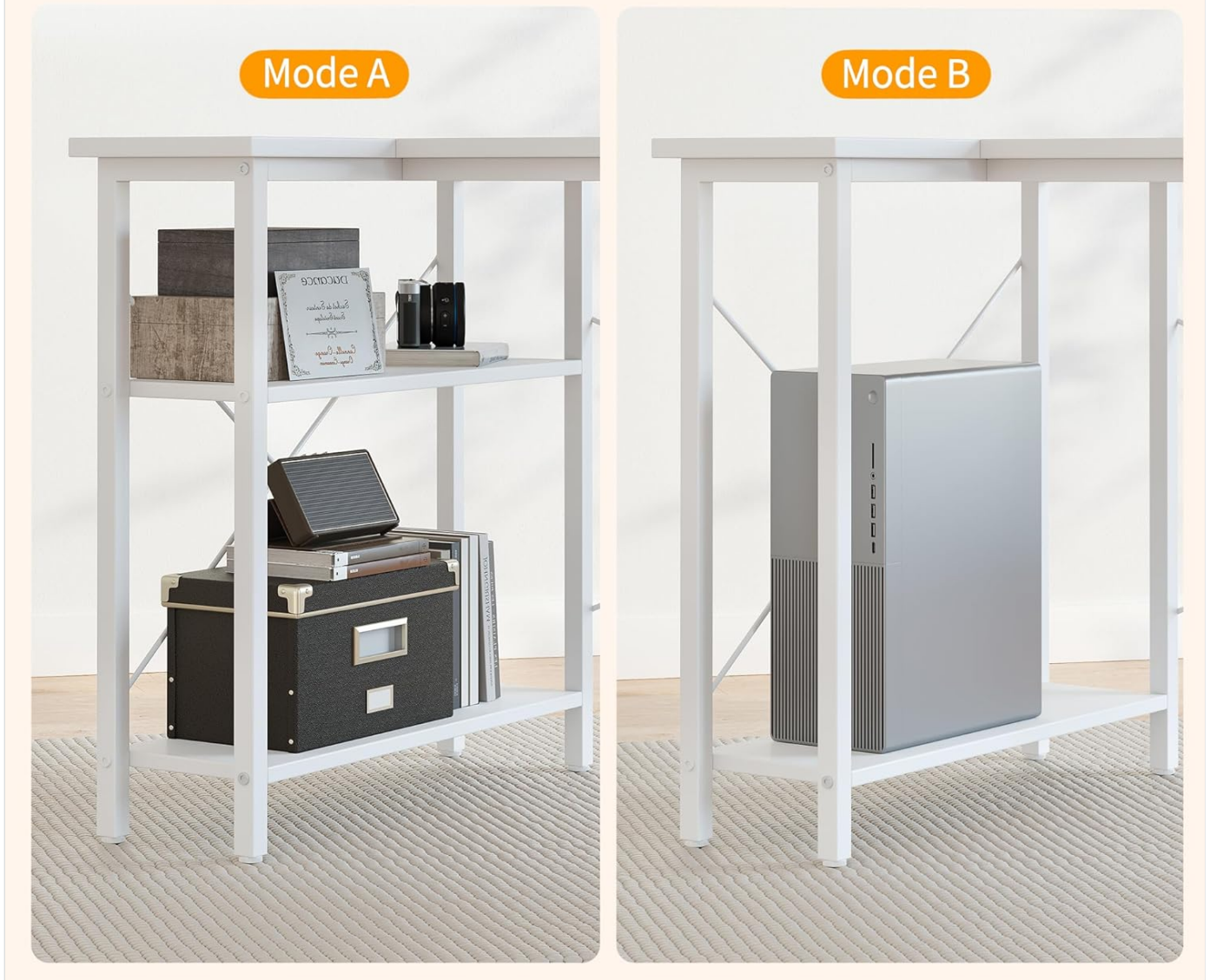
Figure 5.3: Versatile Shelf Modes for Storage or PC Setup.

Customize Your Space for Storage or Tower PC Setup