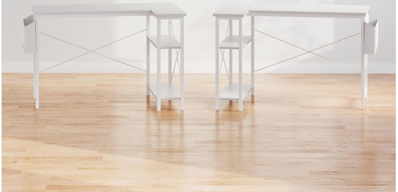
Figure 5.2: Reversible Design for Flexible Setup.