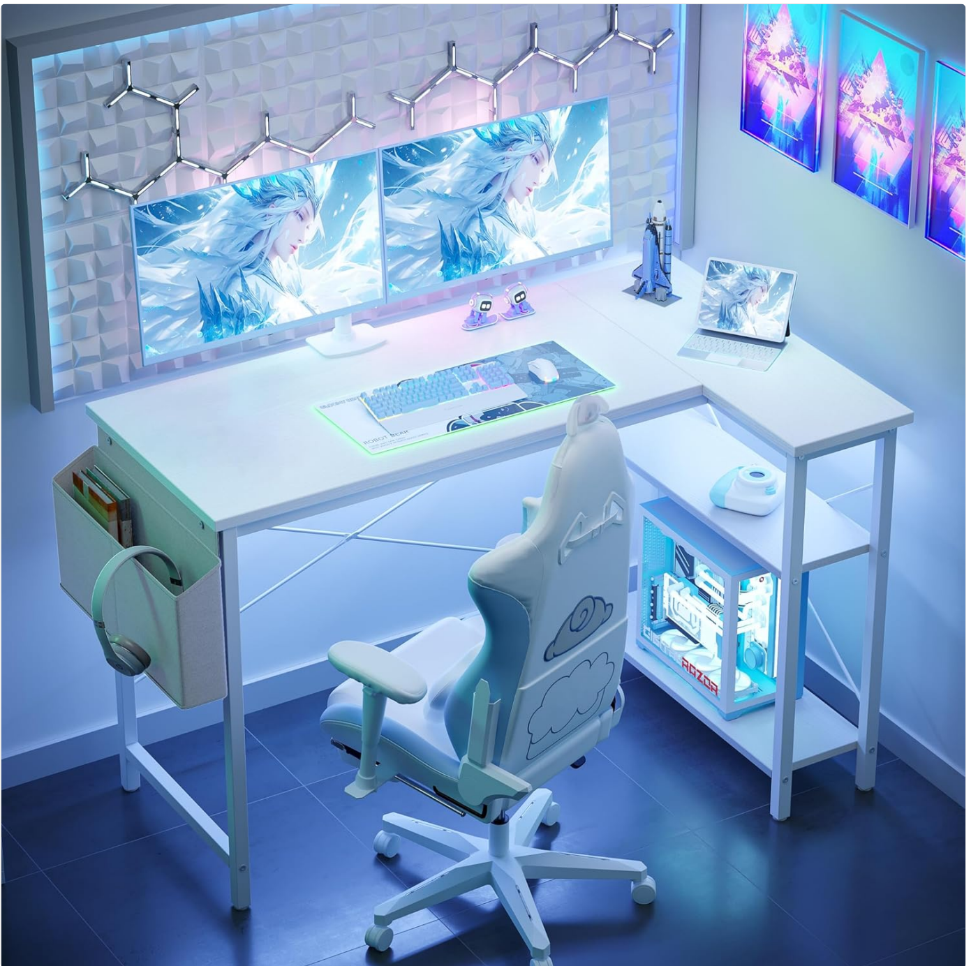
Figure 7.2: Adjustable Feet Pads for Stability and Floor Protection.