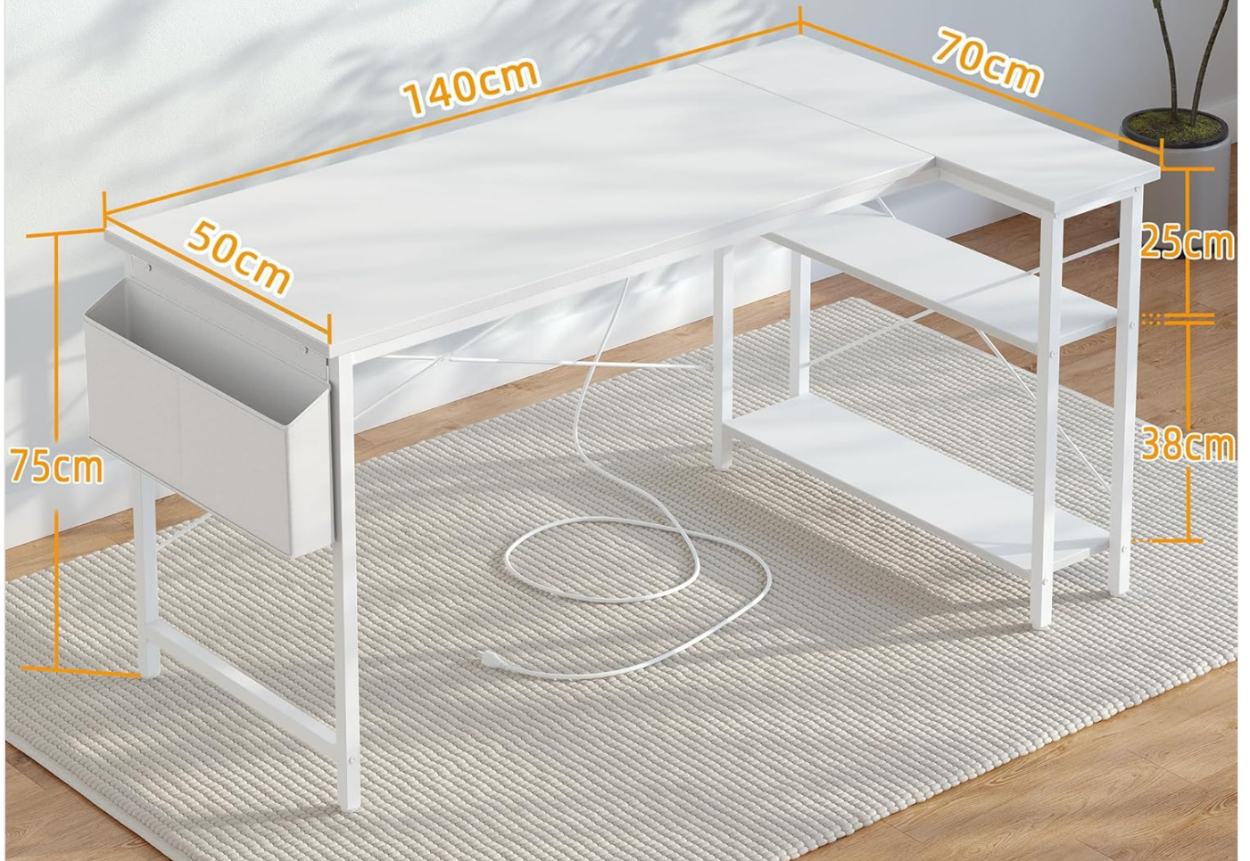
Figure 5.1: Desk Dimensions and Load Capacity.

Max Static Load Capacity 250 lb (120 kg)