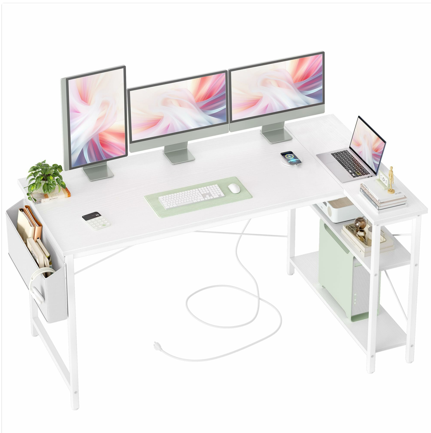
Figure 2.1: Overview of the BEXEVUE L-Shaped Reversible Desk.