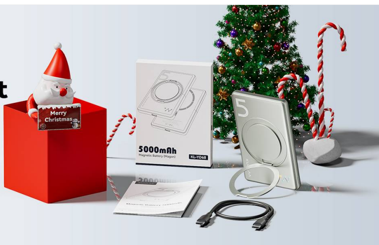
Image: Package contents of the Kuulaa Magnetic Power Bank, showing the device, a USB-C cable, and the user manual.

1x 5000 Magnetic Power Bank 1x USB C to C Cable 1x Manual