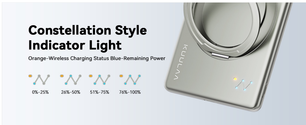
Image: Close-up of the power bank's indicator lights, showing orange for wireless charging and blue for remaining power levels.