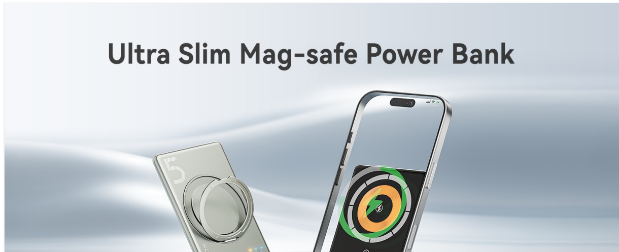
Image: The power bank attached to an iPhone, demonstrating the rotatable stand in various viewing positions.