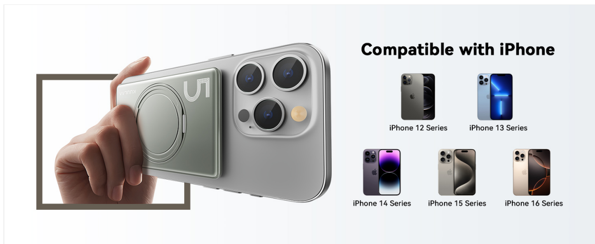
Image: The power bank attached to an iPhone, illustrating its compatibility with iPhone 12, 13, 14, 15, and 16 series.