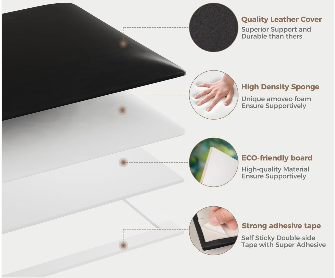
Image: An exploded view diagram illustrating the construction of the headboard panels, highlighting the quality leather cover, high-density sponge, eco-friendly board, and strong adhesive tape layers.