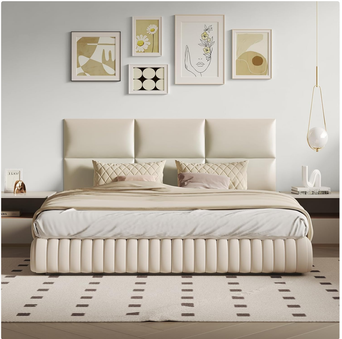
Image: The MAQQL Beige Stick Headboard installed above a queen-size bed, showcasing its elegant and modern appearance.