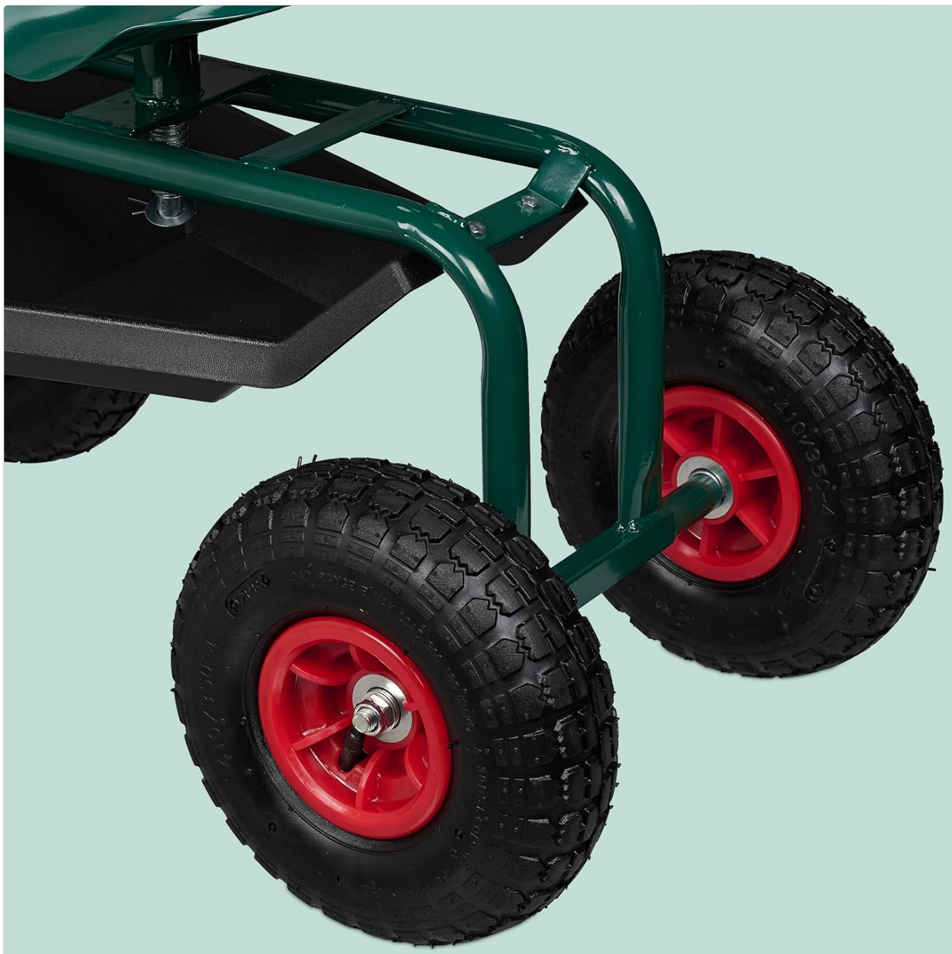
Image: Detailed view of the pneumatic wheel, highlighting the robust construction and air valve for inflation.