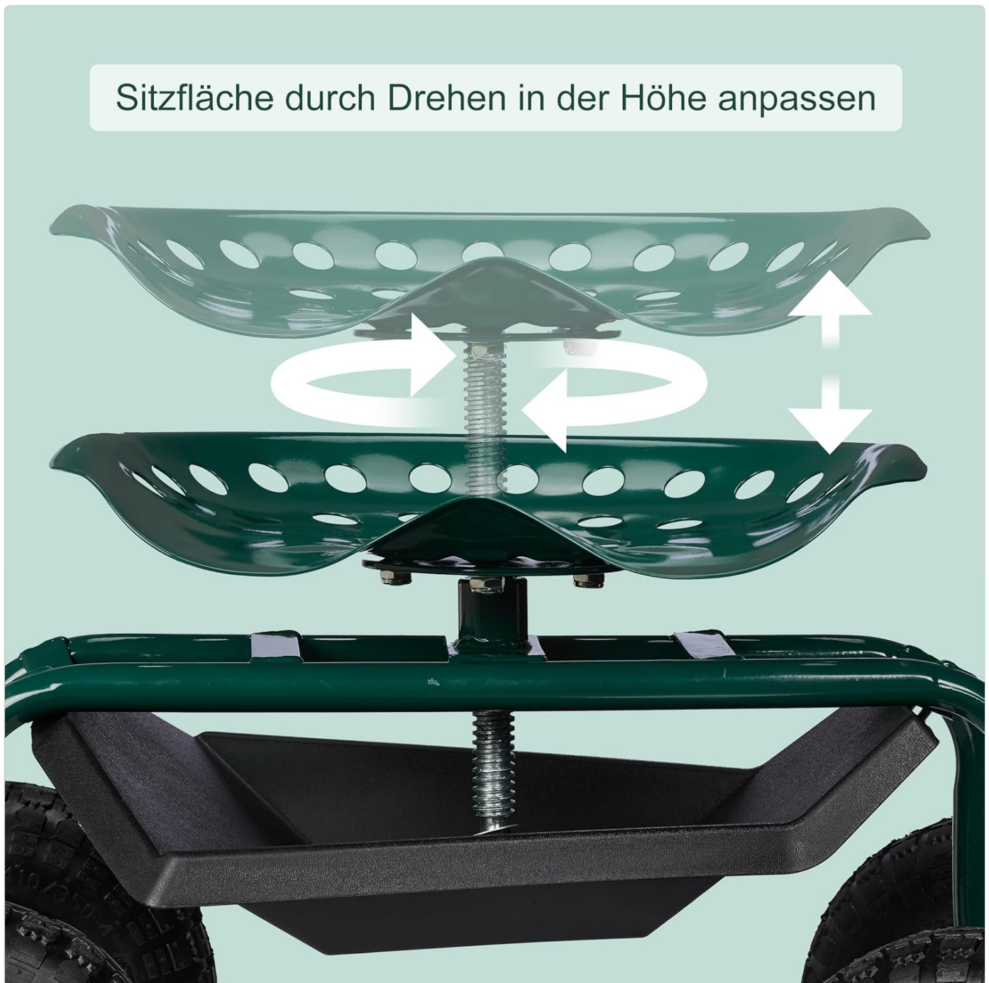
Image: Visual guide demonstrating the rotation mechanism for adjusting the seat height of the garden seat.