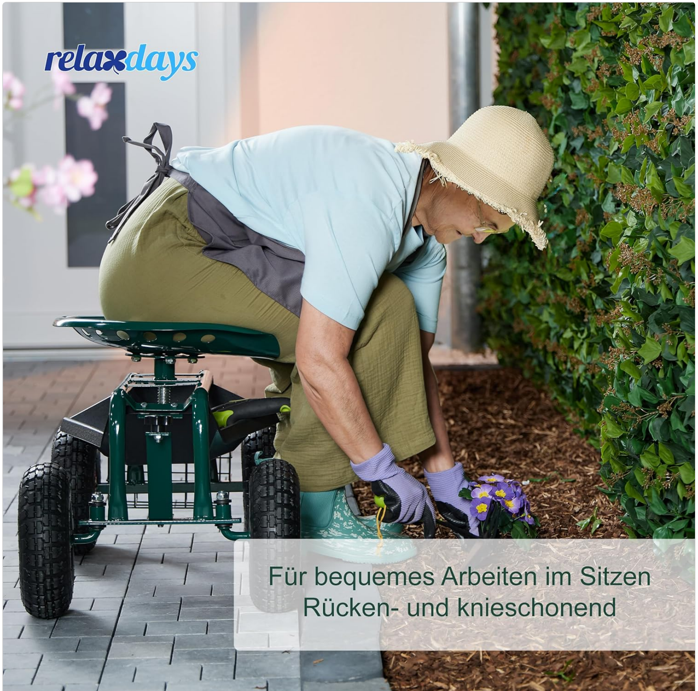
Image: The fully assembled Relaxdays Rolling Garden Seat, showcasing its robust design and large pneumatic wheels.