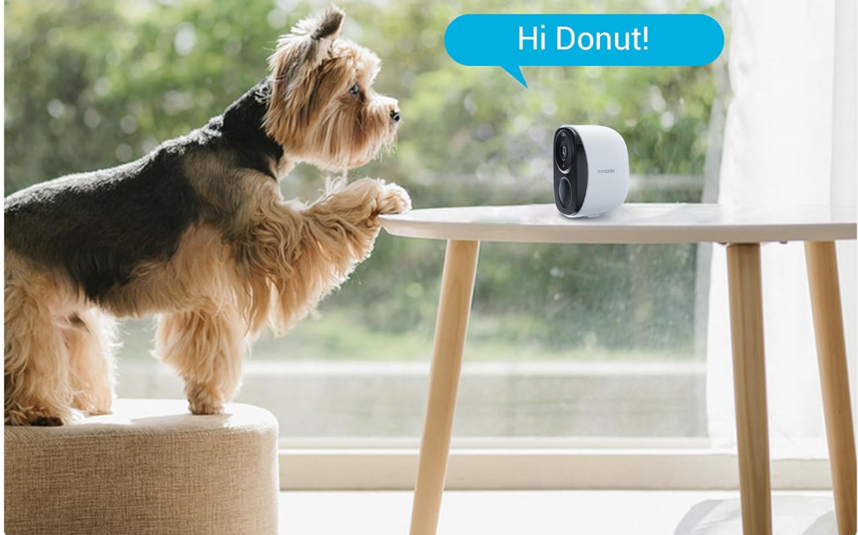
Image: The camera's two-way audio feature allows for communication, illustrated by a dog looking at the camera with a greeting.