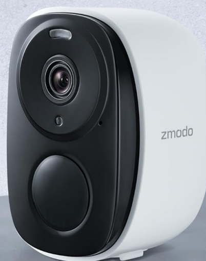
Image: The Zmodo camera supports both cloud storage and local SD card storage options.