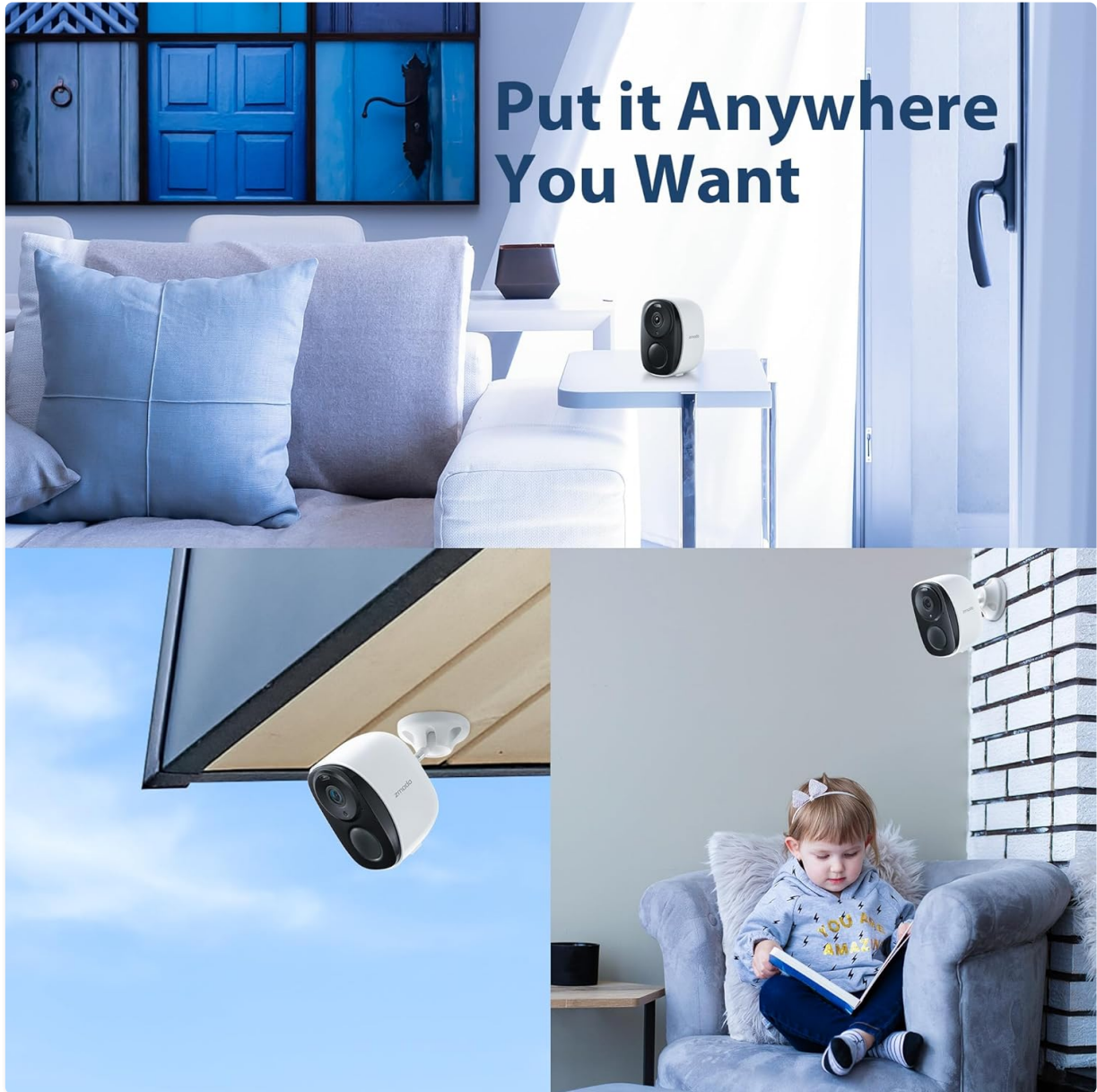
Image: The Zmodo camera can be placed on a table indoors, mounted on a ceiling outdoors, or mounted on an exterior wall, demonstrating its versatile placement options.

The Zmodo ZMD-BC-H1001 camera is wire-free, allowing flexible placement. Use the included mounting bracket and hardware to secure the camera to a wall or place it on a flat surface like a bookshelf. Ensure the camera has a clear line of sight to the area you wish to monitor.