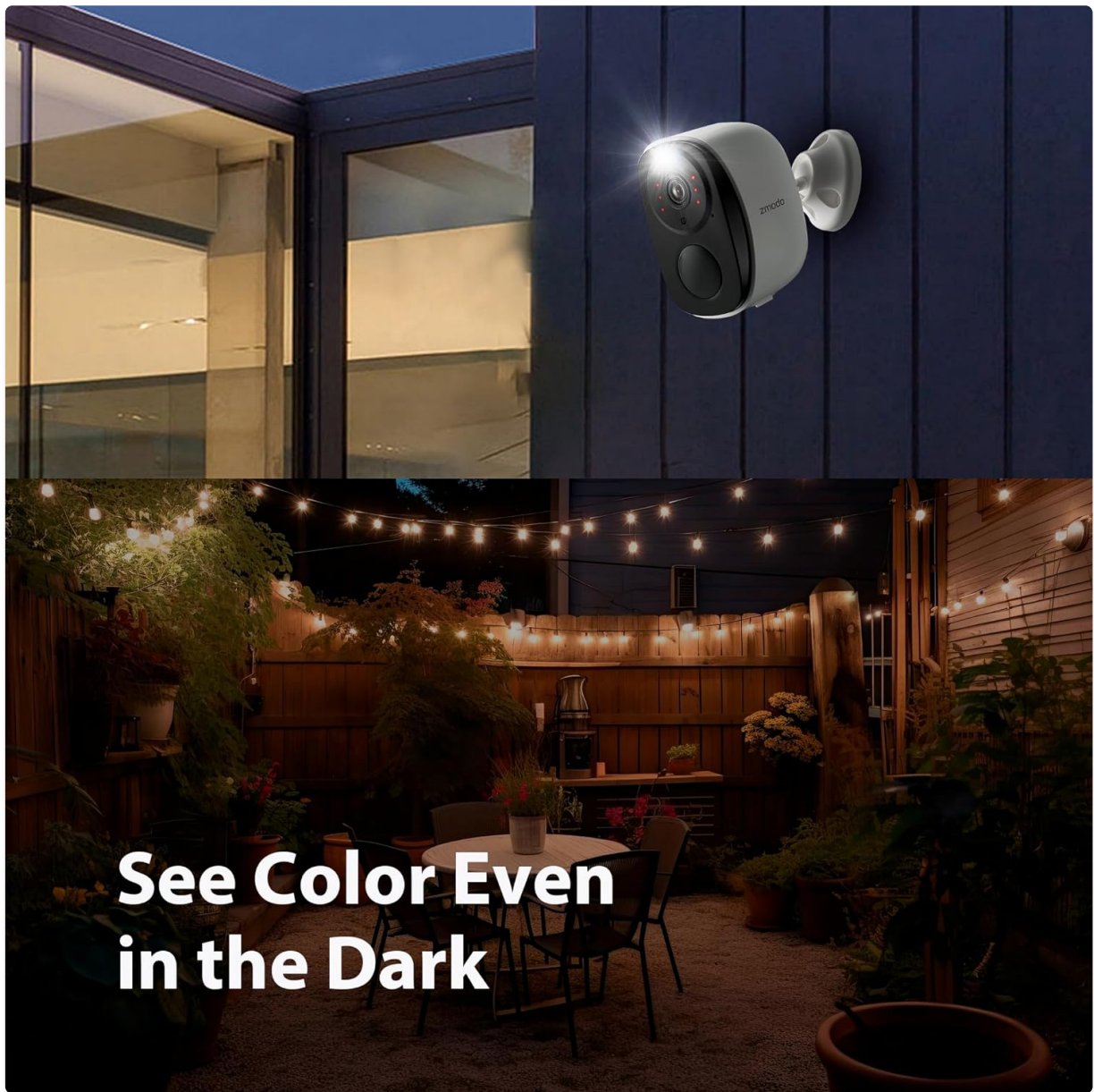
Image: The Zmodo camera provides clear, color night vision, as shown by an outdoor scene at night with string lights.