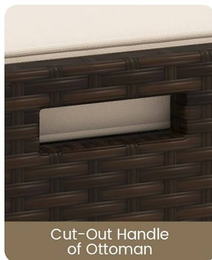
Cut-Out Handle of Ottoman

Image: Close-up of the premium mix brown PE rattan weave and curved armrests.