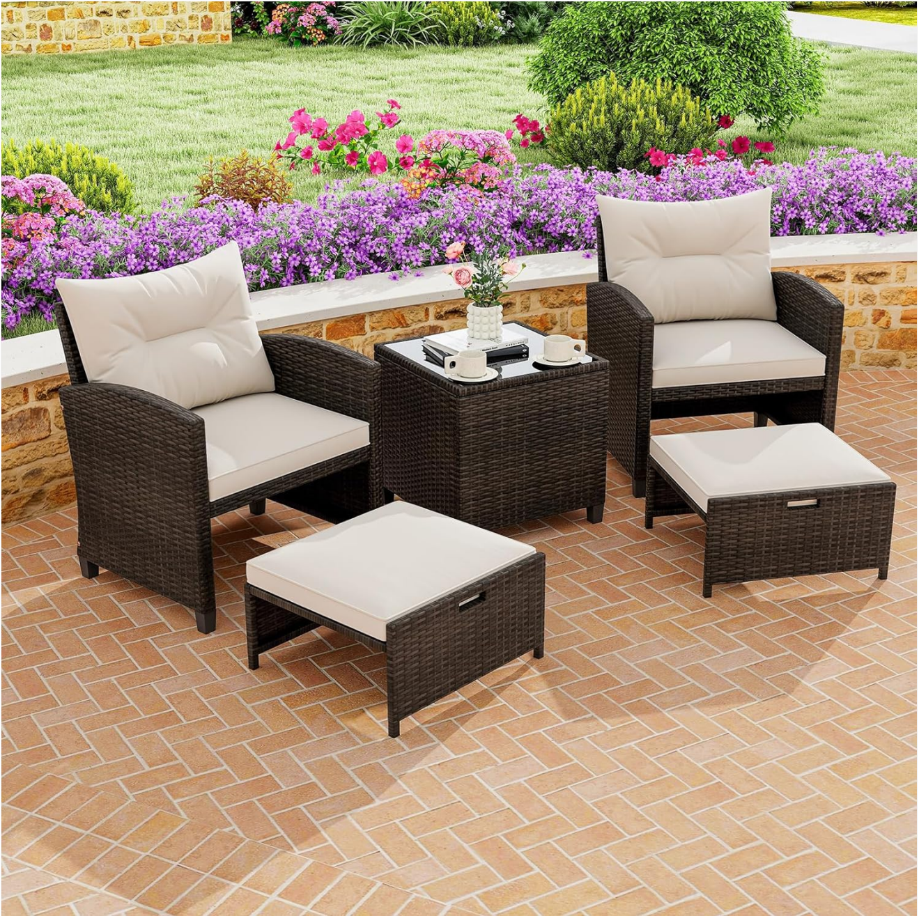
Image: The complete 5-piece patio furniture set, showcasing the two chairs, two ottomans, and the central coffee table.