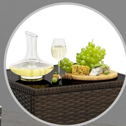
Tempered Glass Tabletop