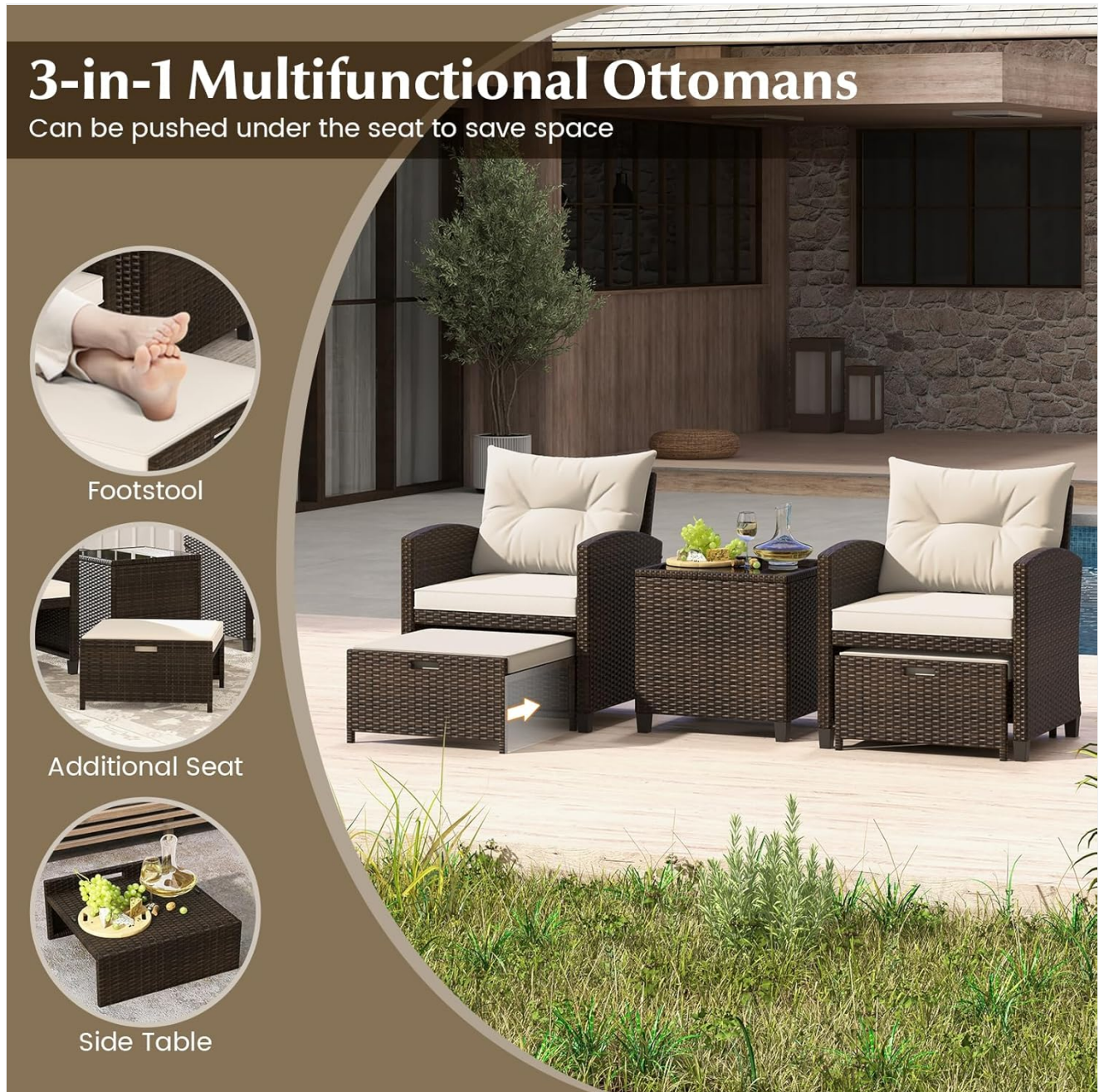
Image: The versatile ottomans shown as a footstool, an additional seat, and a side table.

The tempered glass coffee table is suitable for holding beverages, snacks, books, or decorative items. Ensure items are placed gently on the glass surface. The glass is secured by suction cups to prevent movement.