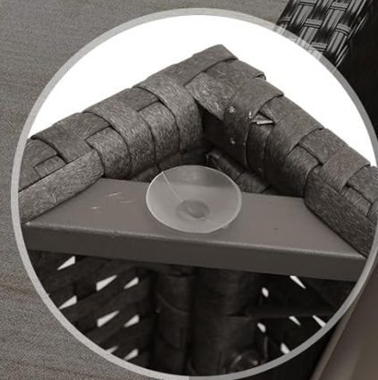
4 Suction Cups

Image: Details of the cushions, highlighting the high-density filling, removable zippered covers, and toggle buttons for securing ottoman cushions.