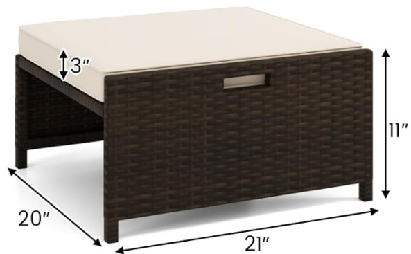
Image: Detailed product dimensions and weight capacities for chairs, ottomans, and the coffee table, useful for assembly reference.