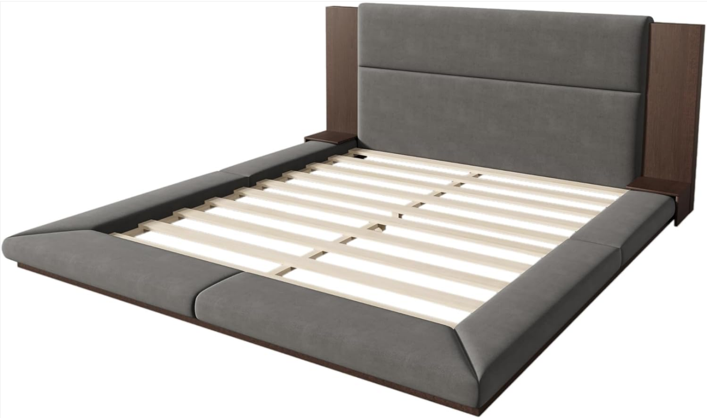
Image 4.2: View of the bed frame's interior, highlighting the robust wooden slat system designed to support your mattress directly.