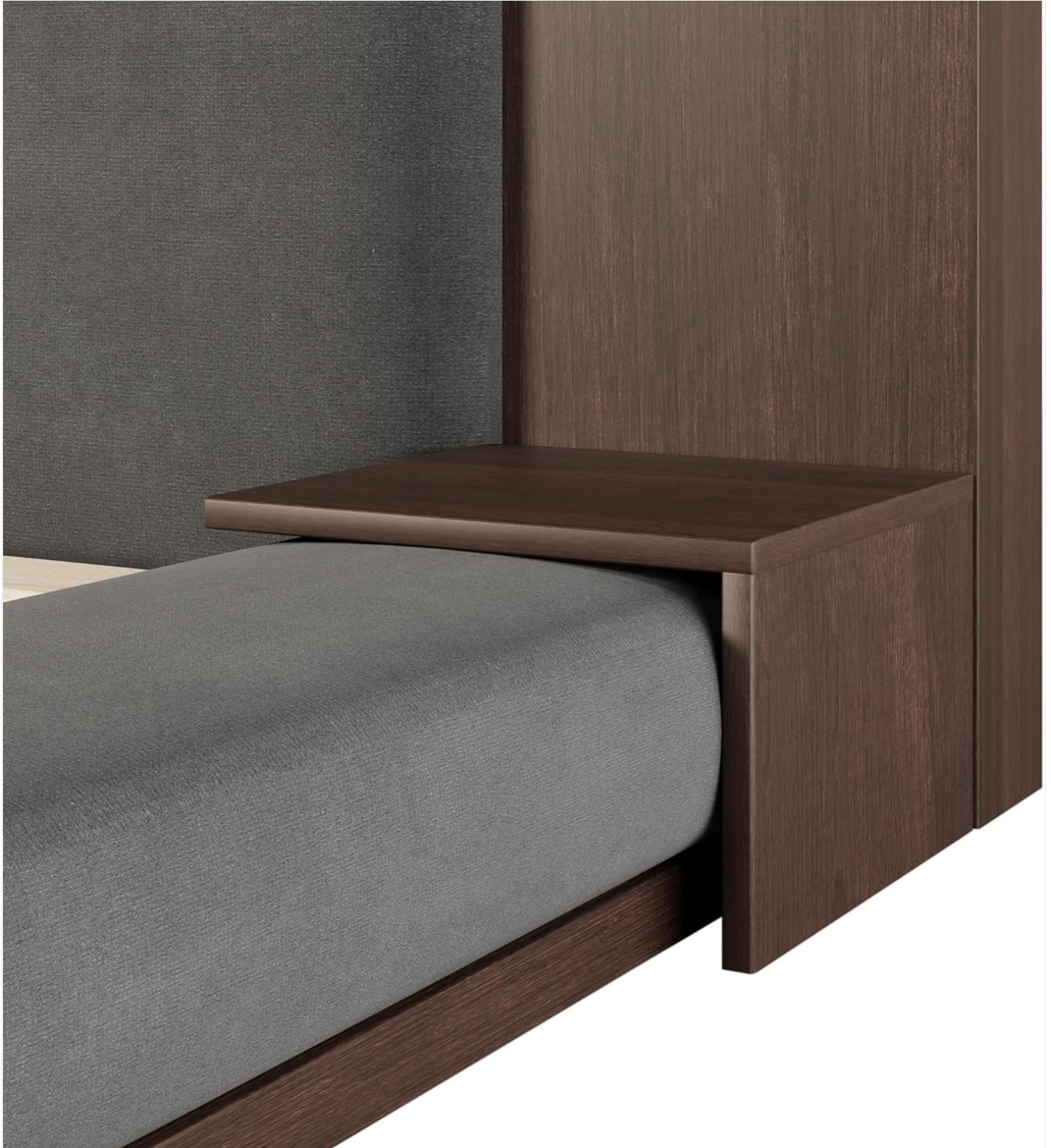
Image 5.1: Detail of the convenient bedside shelf, part of the extended headboard design.