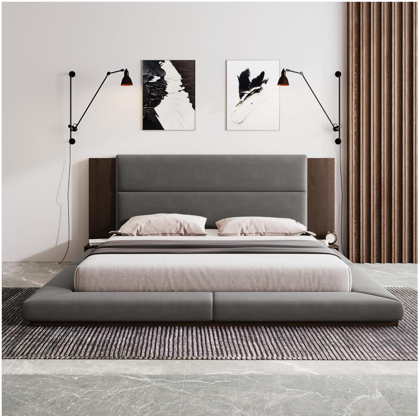
Image 1.1: The SOFTSEA King Size Upholstered Floor Platform Bed Frame, featuring an extended headboard and integrated bedside shelves.