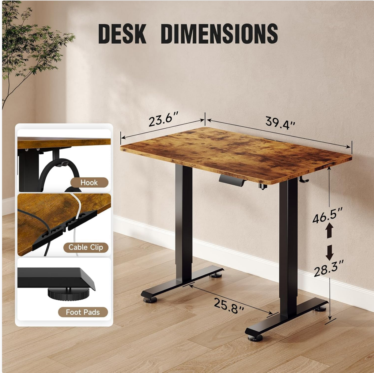
Image: Detailed dimensions of the Veken 39.4" Electric Standing Desk.