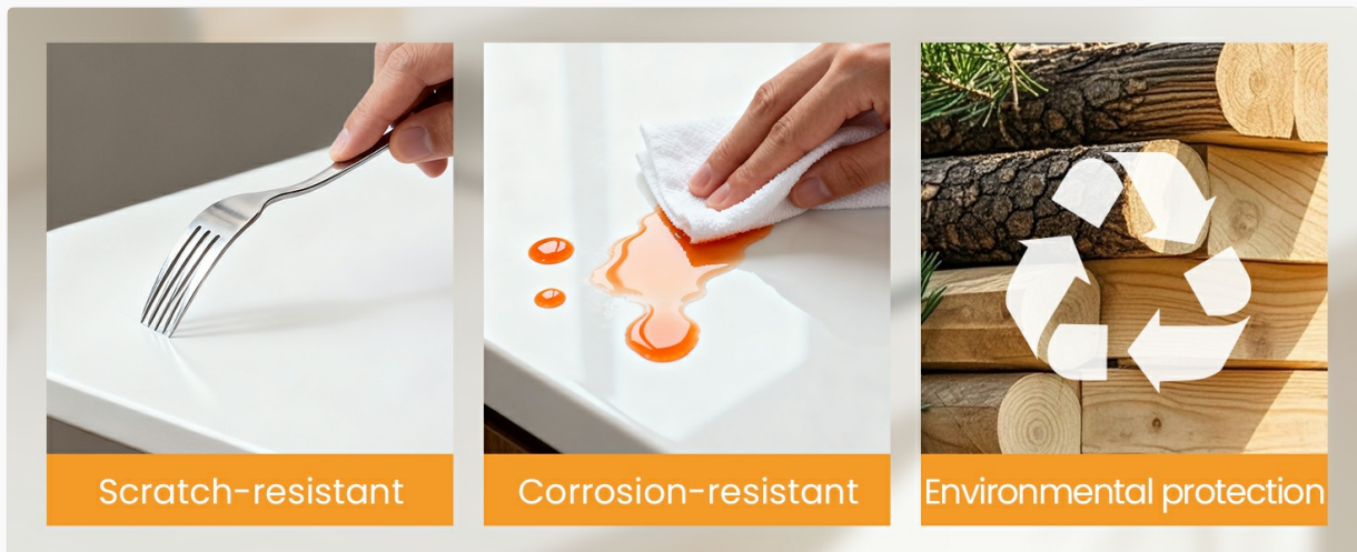
Image: The desktop is designed to be scratch-resistant and corrosion-resistant for long-term durability.