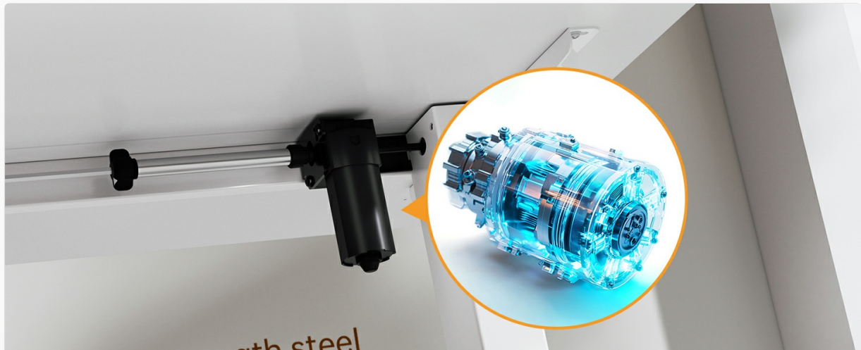
Image: The desk features a high-efficiency electric motor for smooth and reliable height adjustments.