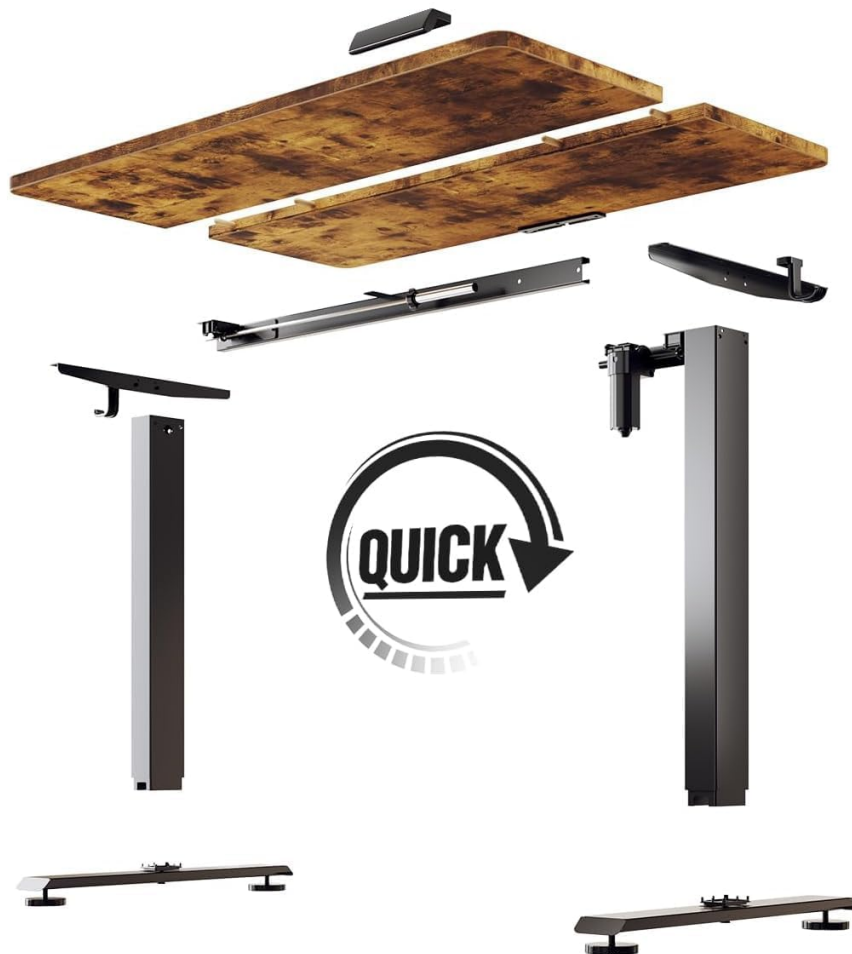
Image: The desk includes integrated cable clips and headphone hooks for organization.

All Holes Pre-drilled, All Accessories Pre-labeled Clearly