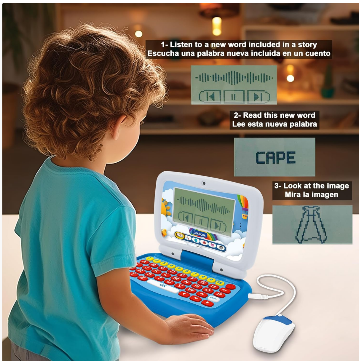
Figure 5: Reading activity on the laptop screen.