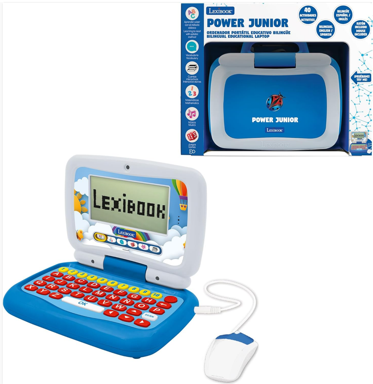
Figure 1: Lexibook Power Junior Bilingual Educational Laptop with wired mouse.