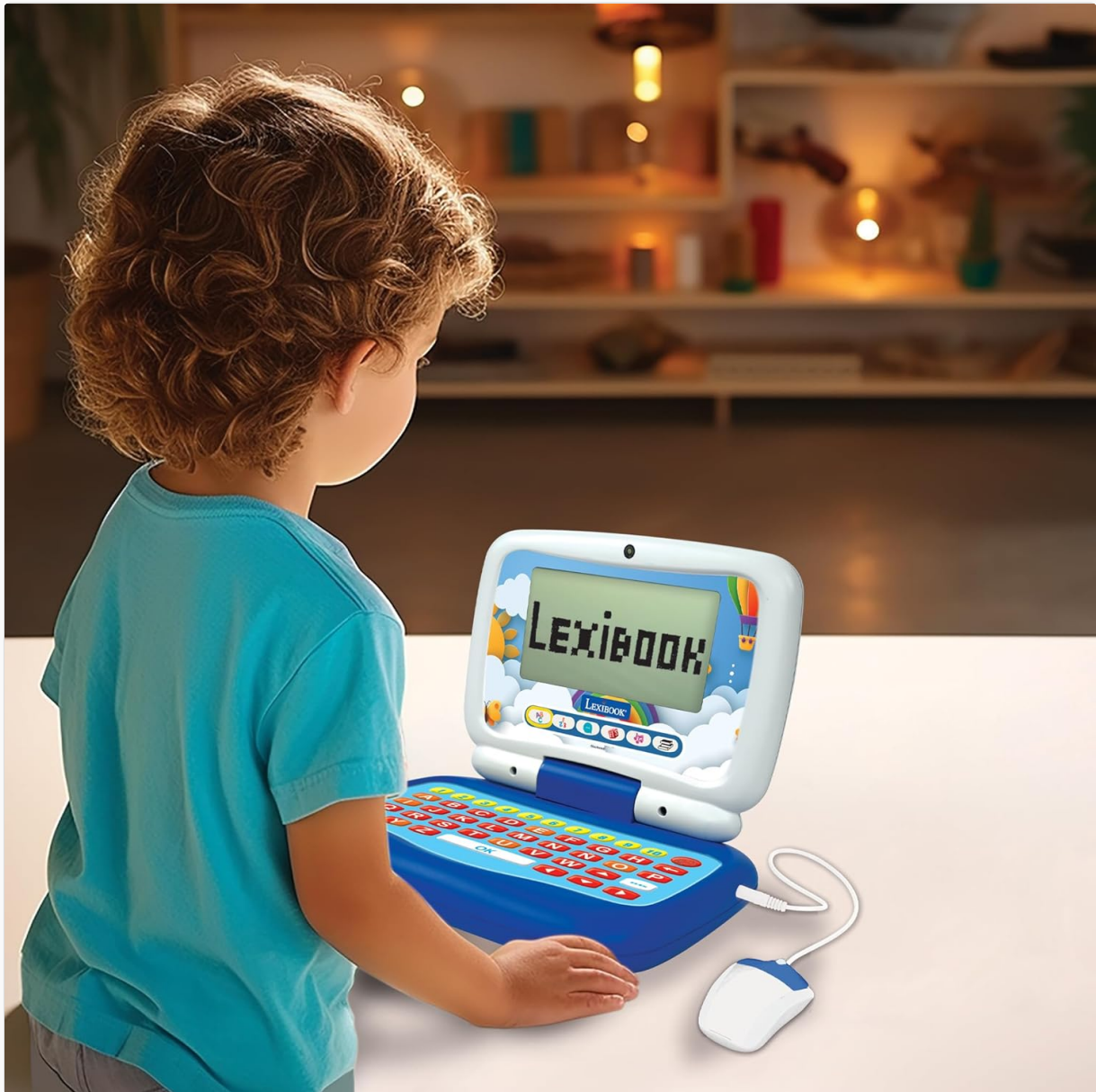
Figure 3: Child engaging with the Lexibook Power Junior laptop.