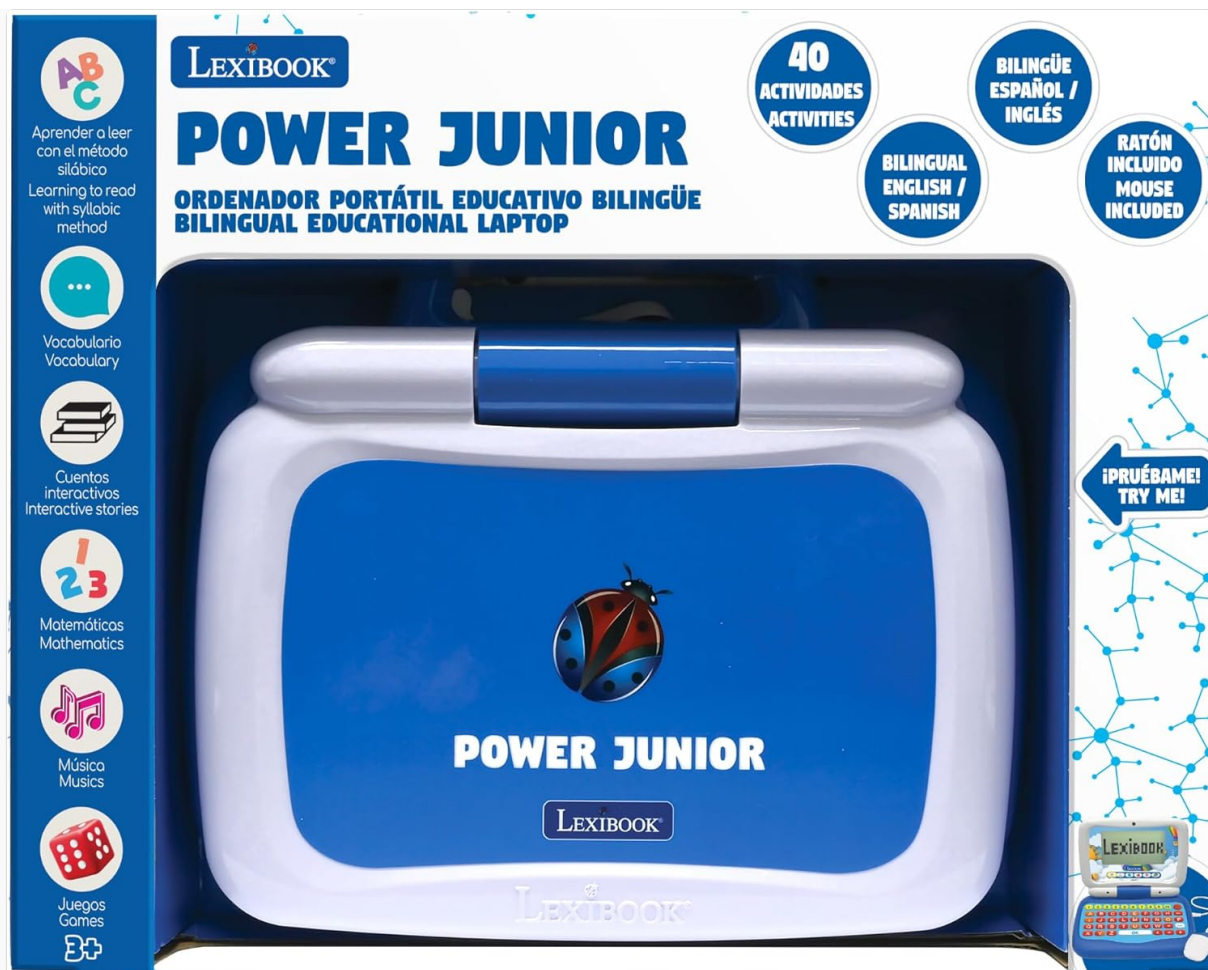
Figure 2: The Lexibook Power Junior Laptop as packaged.