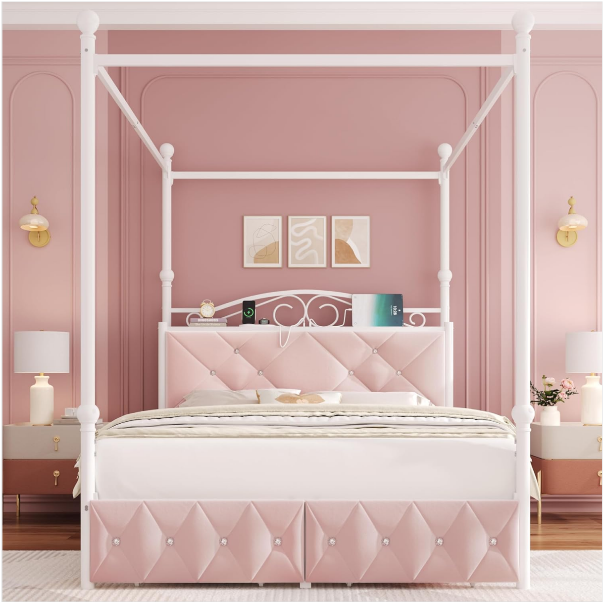
Image: Overview of the Keyluv Queen Canopy Bed Frame, highlighting its design and features.