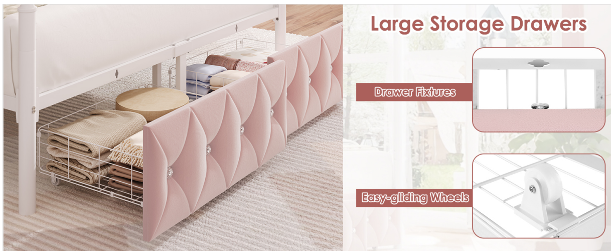
Image: View of the large storage drawers under the bed, showing their capacity.

The bed frame includes two large sliding drawers at the foot of the bed. These drawers are equipped with smooth rollers for easy access and locking holes to prevent accidental sliding. Use them to store linens, clothing, or other personal items.