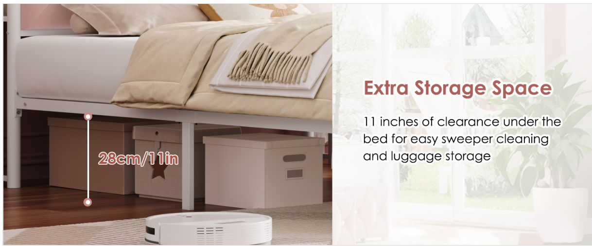
Image: Demonstrates the 11-inch under-bed clearance, suitable for cleaning robots and storage.