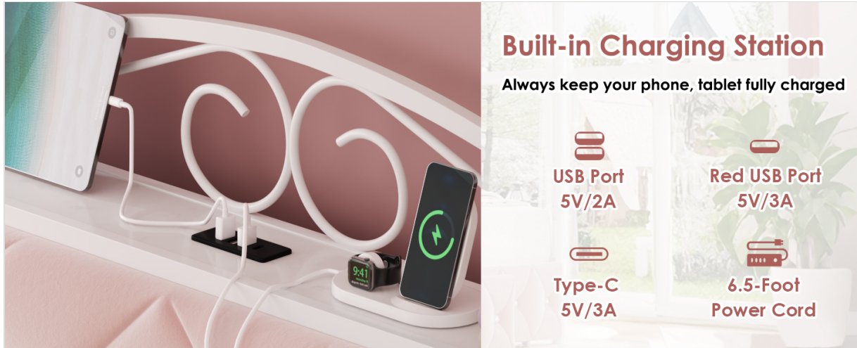
Image: Detail of the integrated charging station on the headboard.

The headboard features a built-in charging station. To use, ensure the bed frame is properly connected to a power source. You can then plug your devices into the 3 USB-A ports (5V/2A) and 1 Type-C port (5V/3A) located on the headboard.