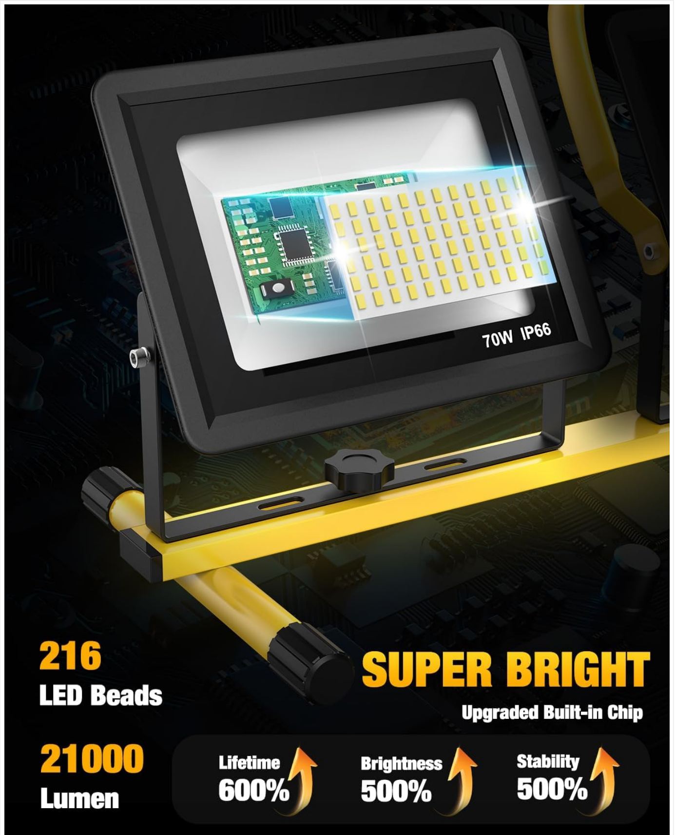
Image: The SOARFLY LED Work Light fully assembled on its adjustable tripod stand, showcasing the three light heads and power cord.