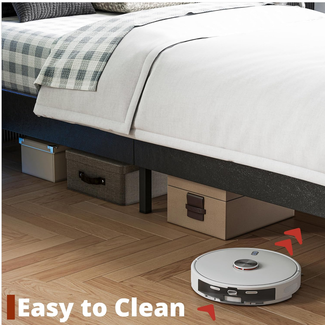
Image: Robot vacuum cleaning under the LIKIMIO bed frame. This image demonstrates the ample under-bed clearance for easy cleaning and storage.