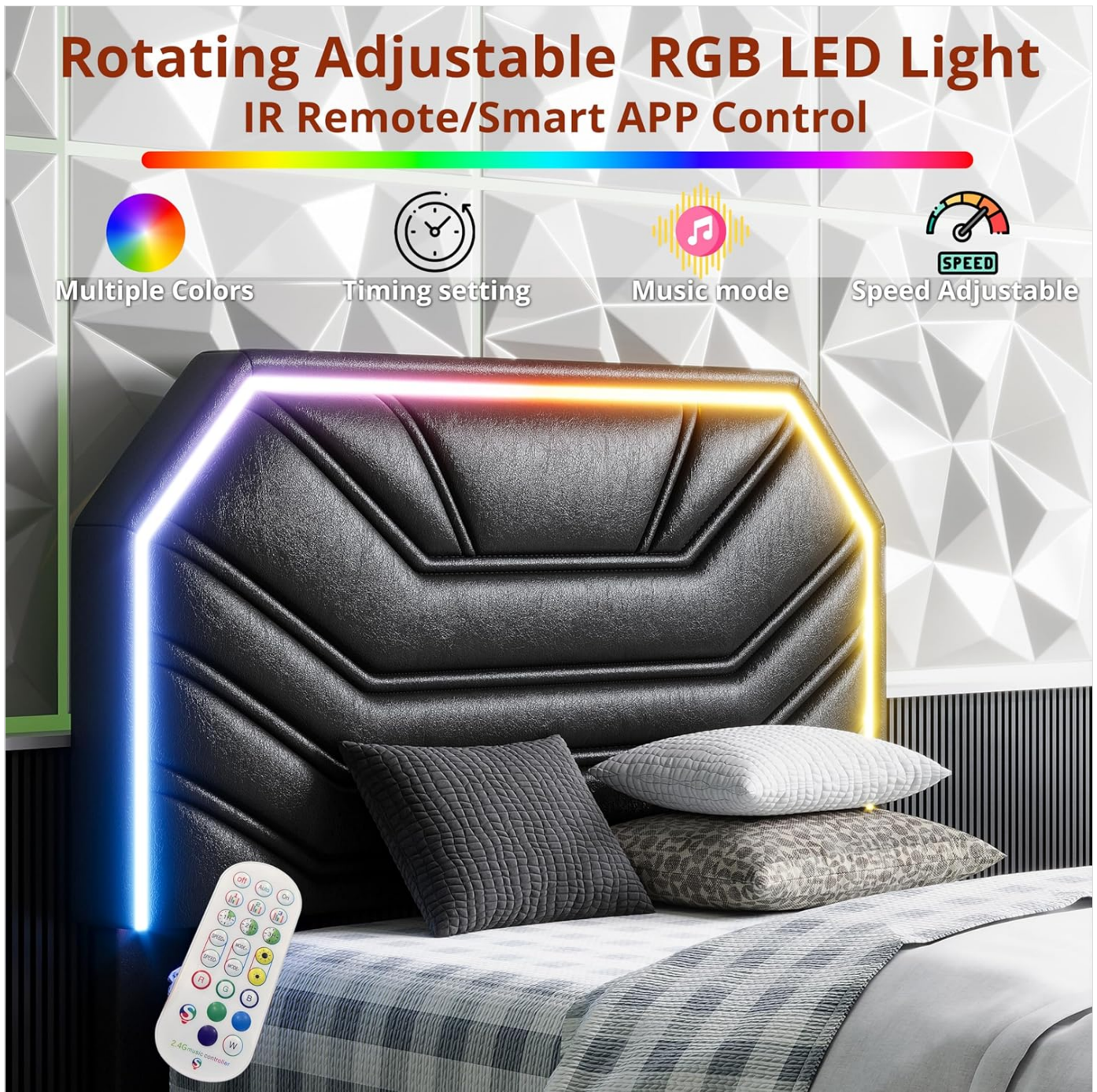
Image: Remote control for the LIKIMIO LED headboard. This image displays the remote control with buttons for color selection, mode changes, and brightness adjustments.