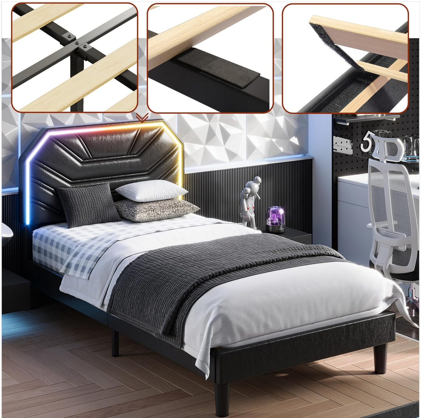
Image: Close-up of the bed frame's sturdy slat support system. This image highlights the wooden slats and metal frame, demonstrating the robust construction.