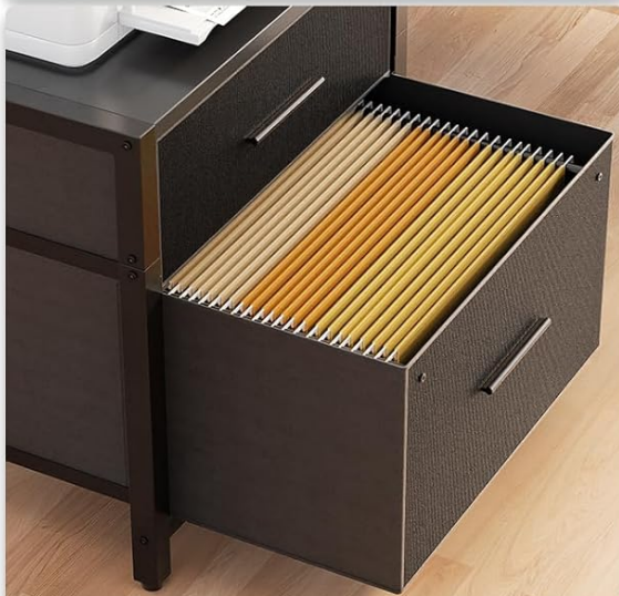
for Letter Size File