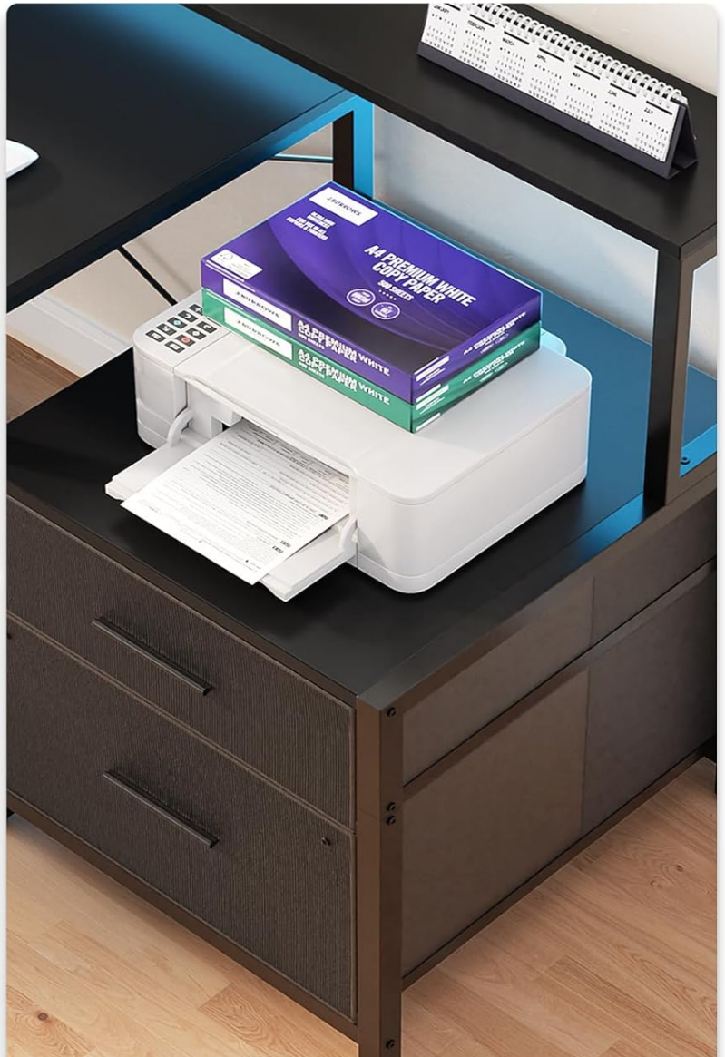
Open Shevle for Printer Stand

Image: Flexible storage options including fabric drawers and printer stand.