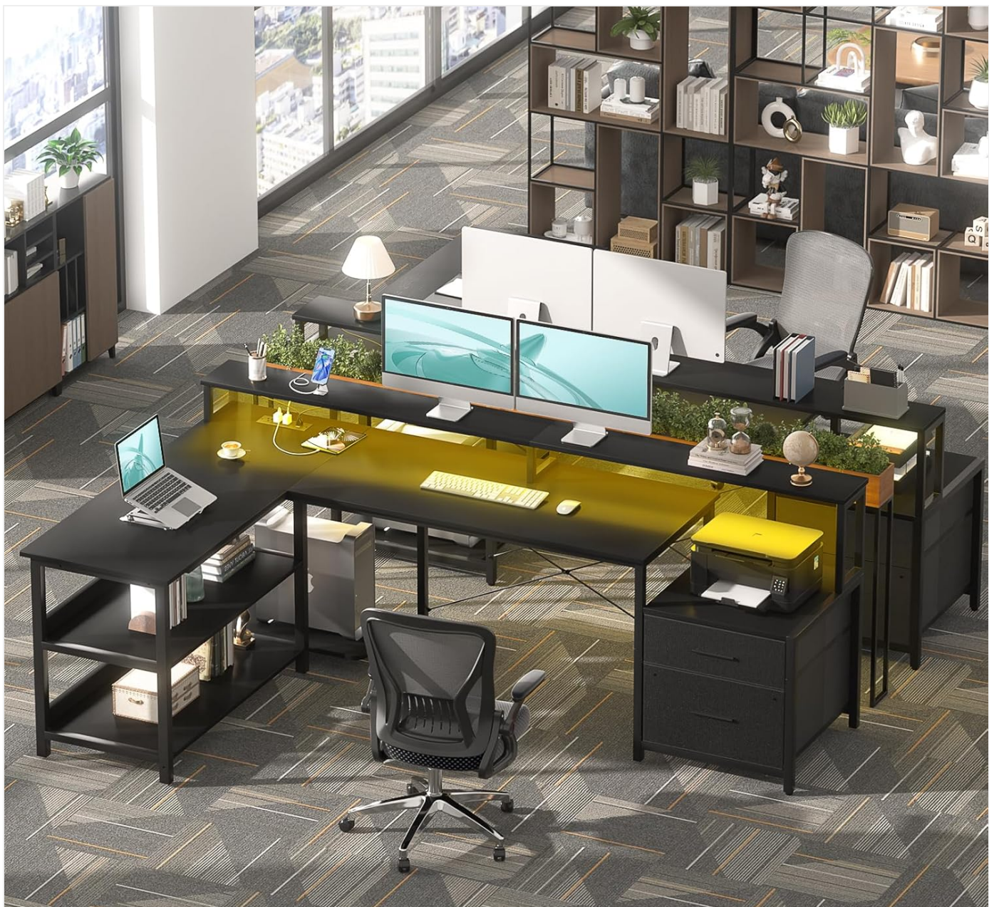
Reversible L Computer Desk