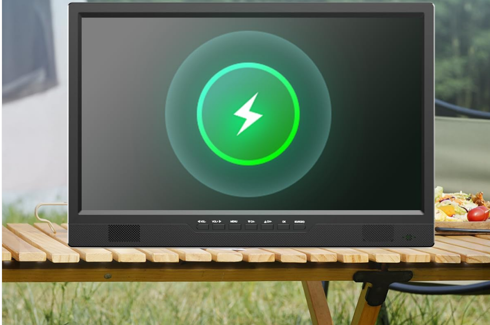
Image: The portable TV being charged, highlighting its 8000mAh battery capacity and the included AC adapter.