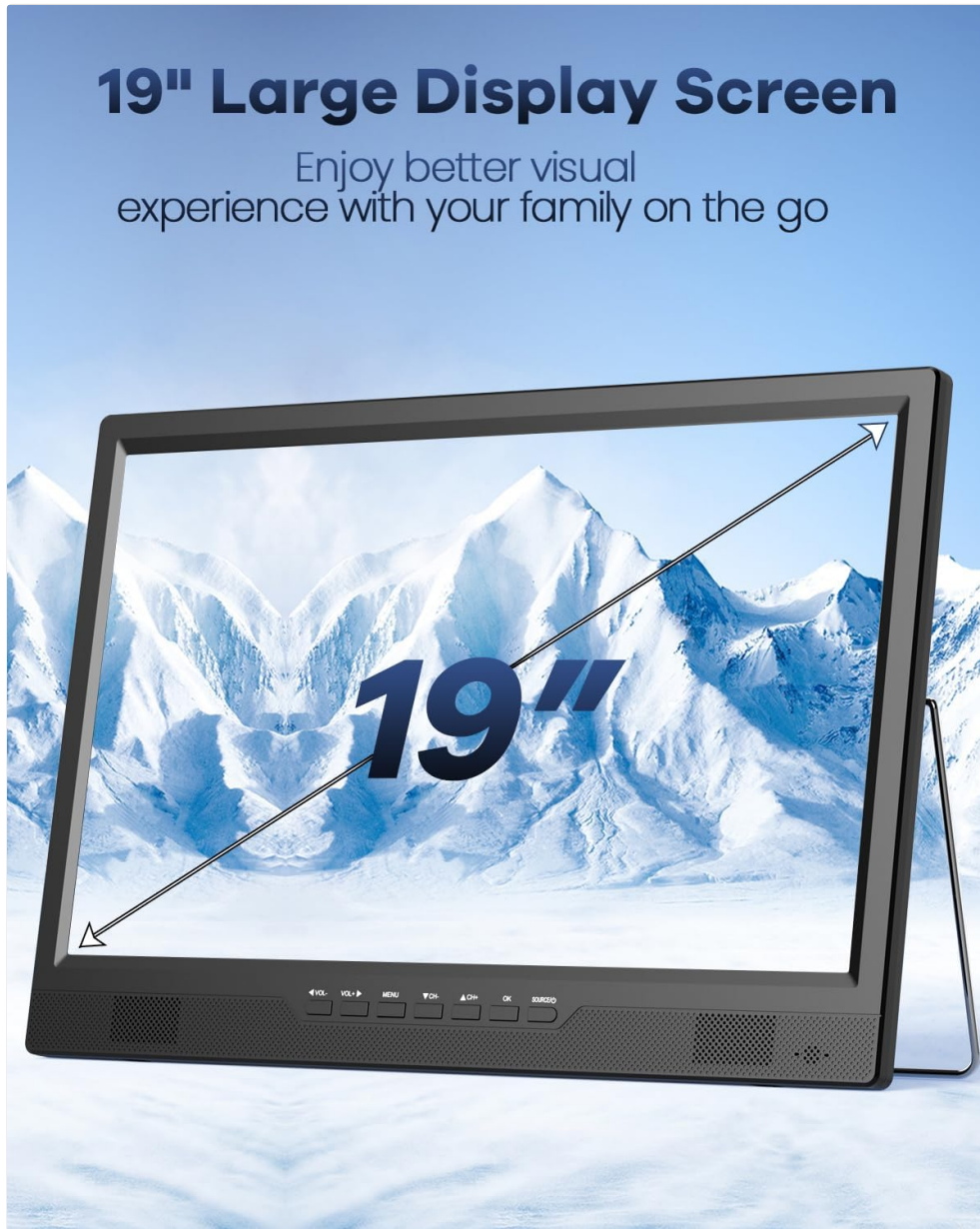
Image: The 19.1-inch screen of the Desobry Portable TV, showcasing its display area.