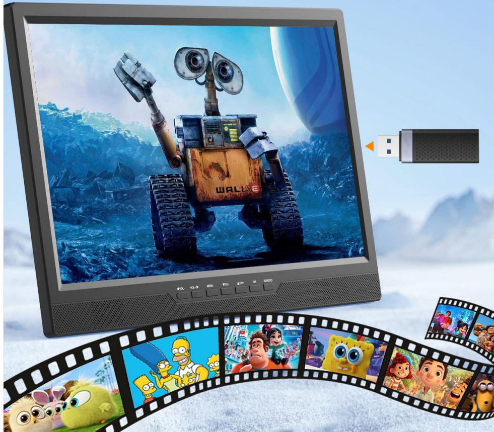
Image: The TV playing media from a USB drive, illustrating its multi-format playback capability.