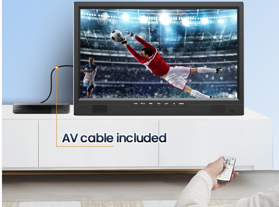
Image: The TV connected to a DVD player using the AV input, showing a movie playing.