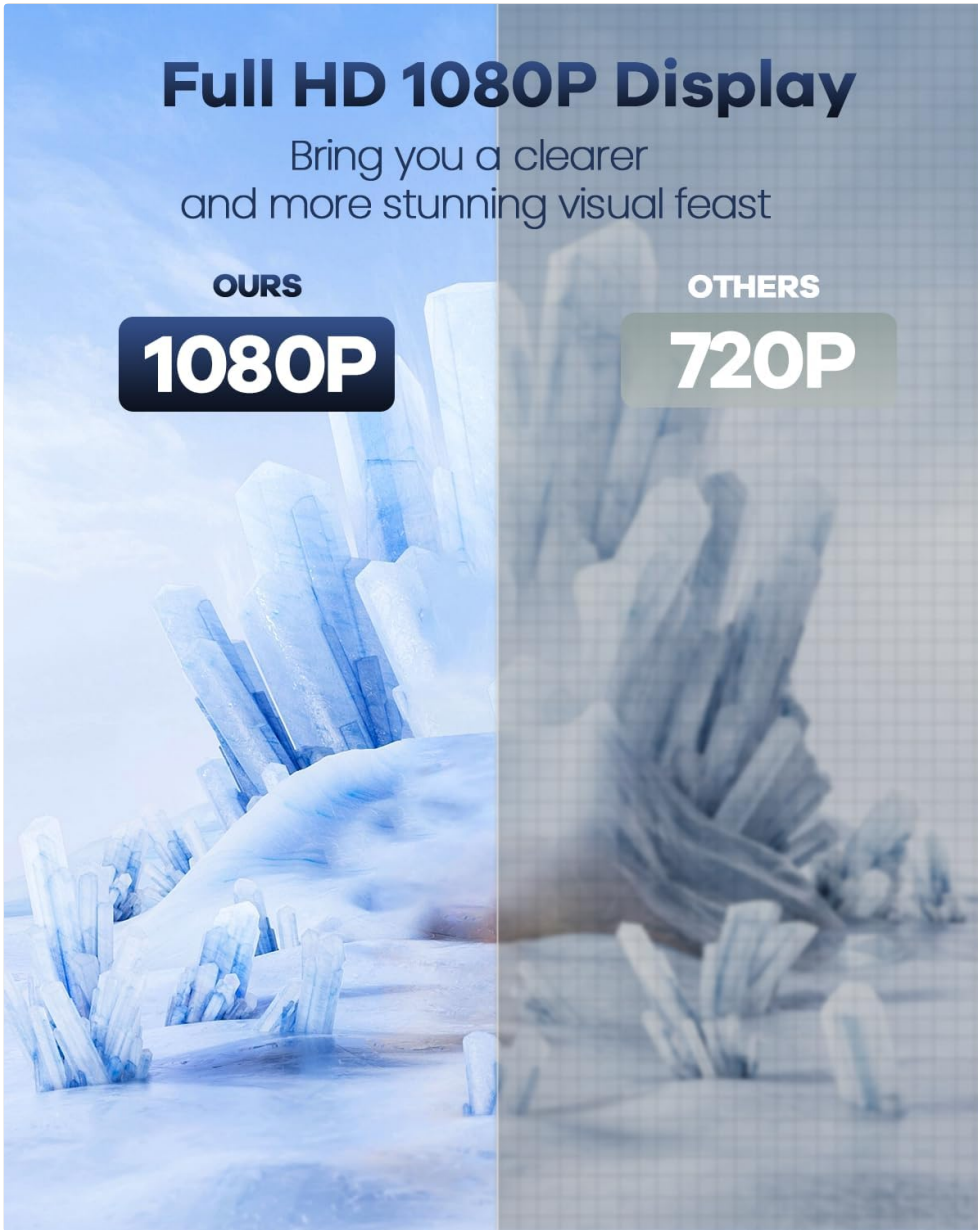
Image: Visual comparison illustrating the clarity of a 1080P display versus a 720P display, demonstrating the superior resolution of the Desobry TV.