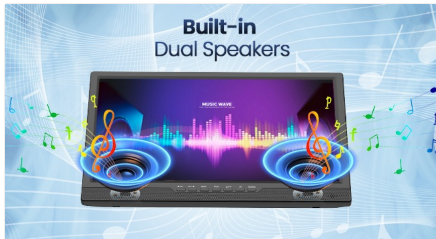
Image: A visual representation of the sound output from the TV's built-in dual speakers.