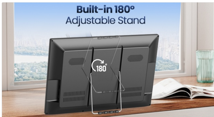
Image: The adjustable stand on the back of the Desobry Portable TV, demonstrating its 180-degree rotation capability.