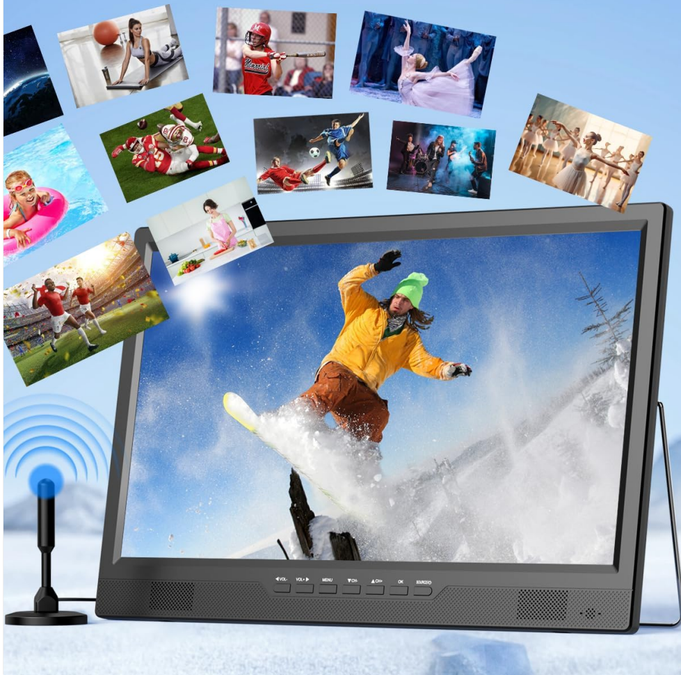
Image: The portable TV receiving local channels via the included antenna, showing a live broadcast.

Come with antenna to get free channels in local.