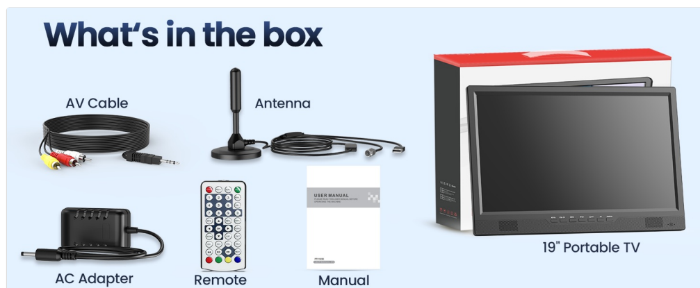
Image: Contents of the Desobry Portable TV package, including the TV unit, AV cable, antenna, remote control, instruction manual, and wall charger.