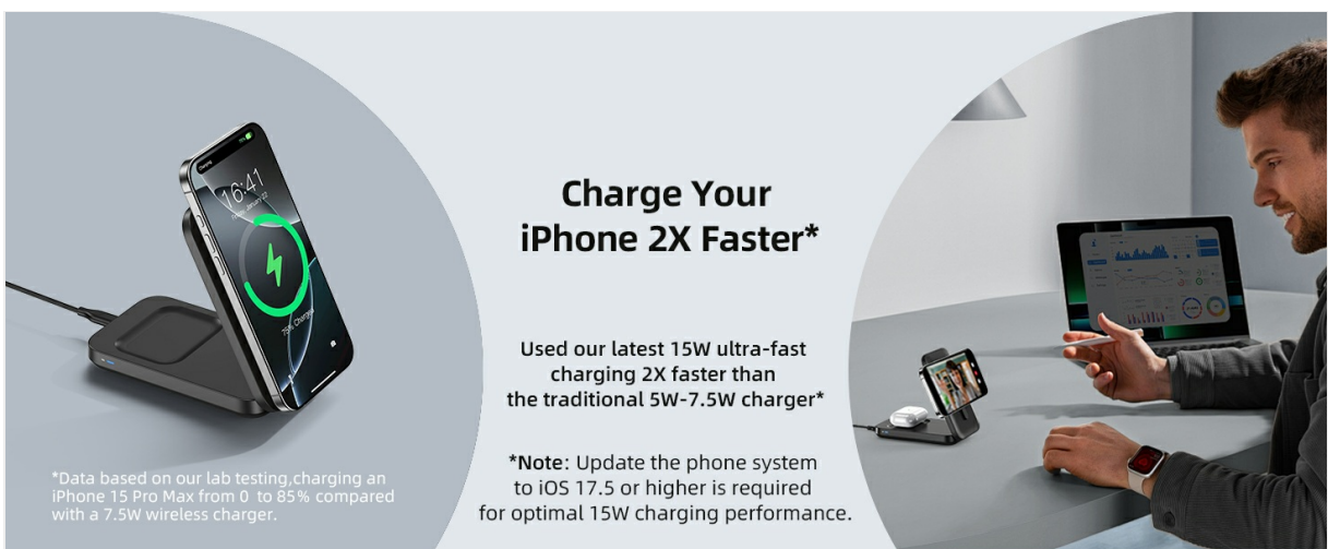
Image: Comparison showing 2X faster iPhone charging with the 15W Qi2 certified station.