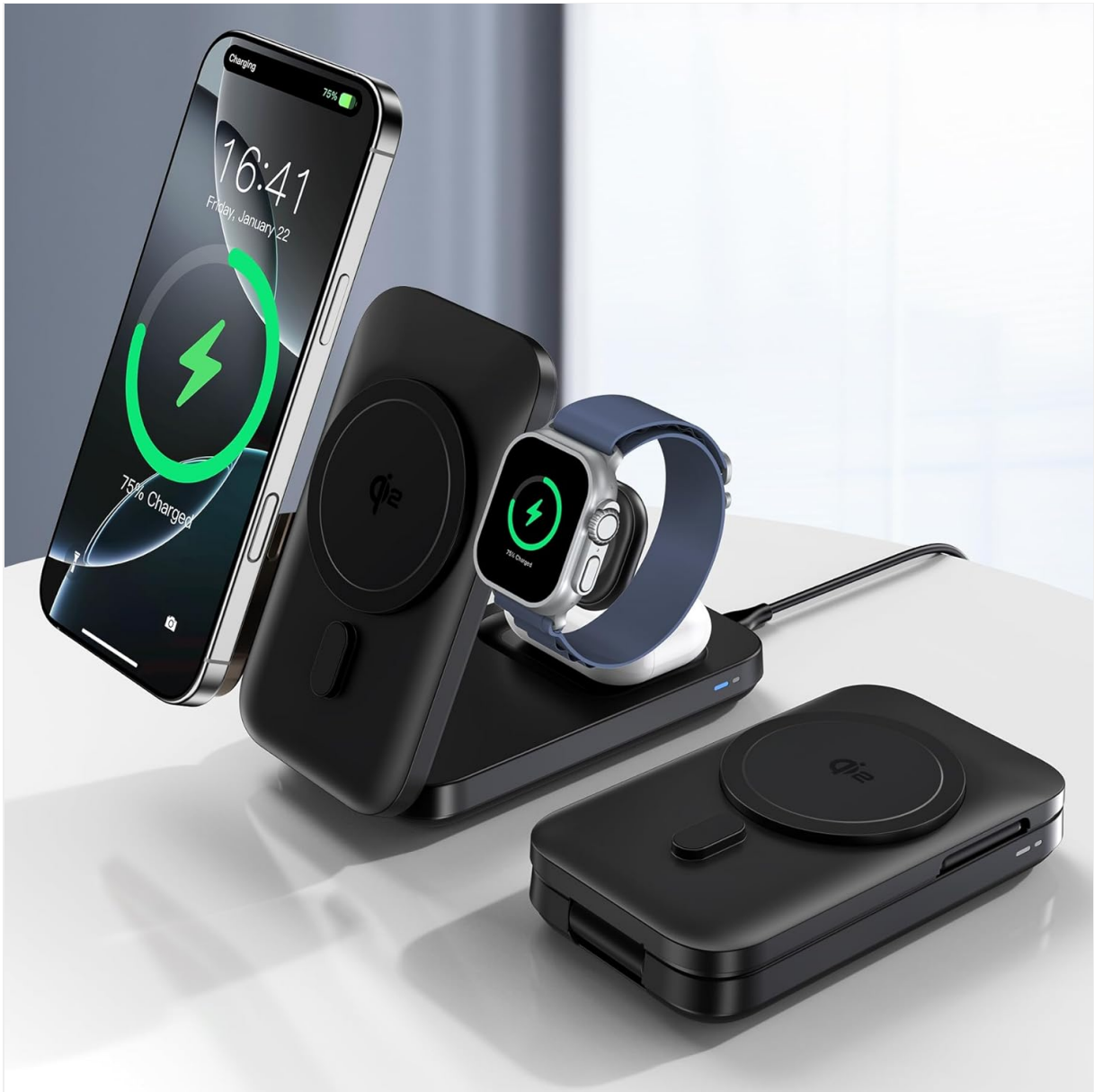
Image: The RoRoSkin V21 charging station in use, demonstrating simultaneous charging of an iPhone, Apple Watch, and AirPods.