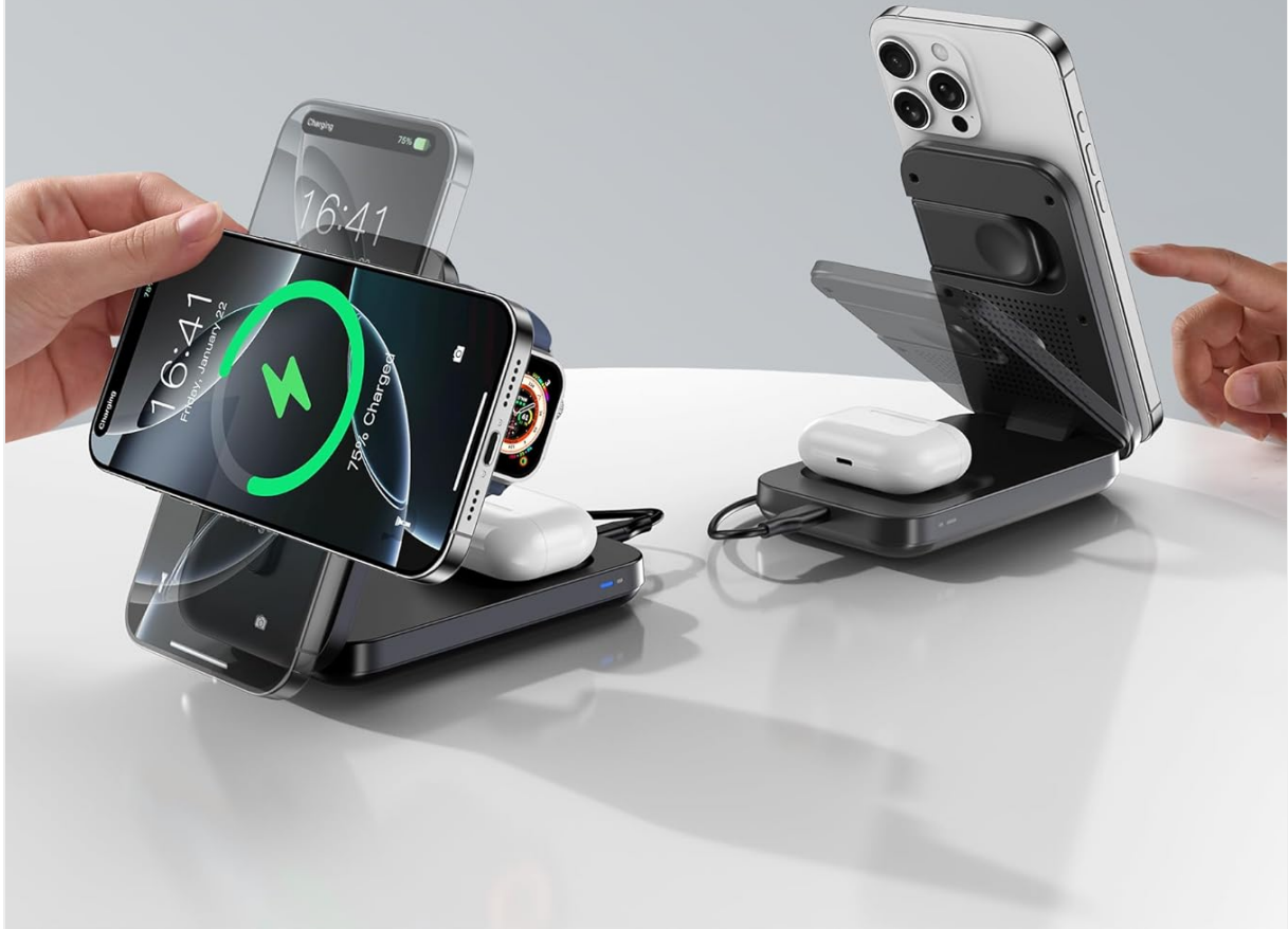
Image: Demonstrating the adjustable stand features, including rotation and tilt angles.