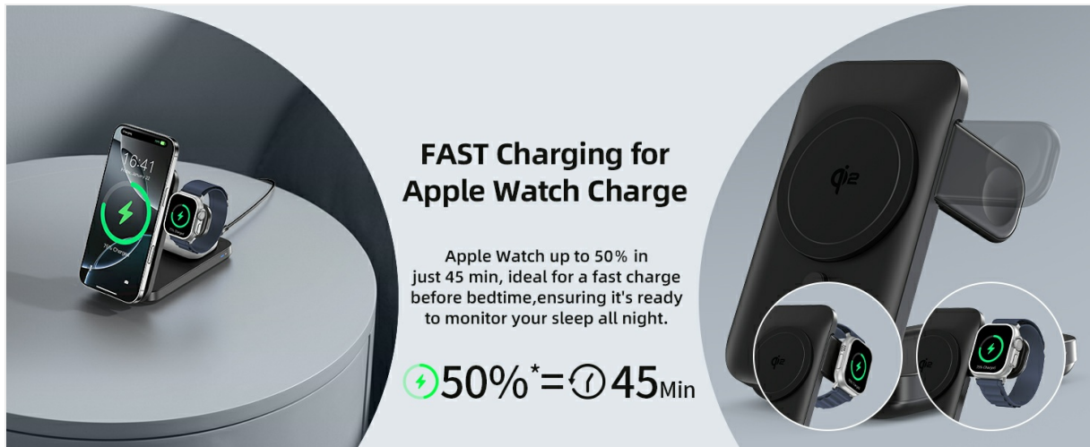
Image: Information on Apple Watch charging speed, achieving 50% charge in approximately 45 minutes.