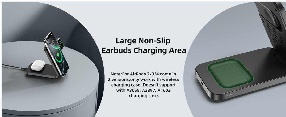
Image: The dedicated non-slip charging area for AirPods, with a reminder about specific incompatible AirPods case models.