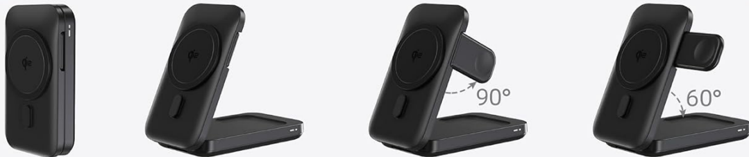
Image: The compact and foldable design of the charging station, highlighting its dimensions and portability.