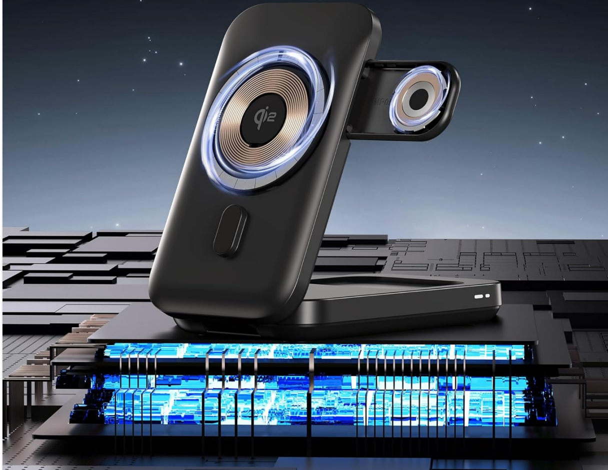
Image: Safety features of the RoRoSkin V21 charging station, including protection against overheating, power surges, overcharging, and short circuits.