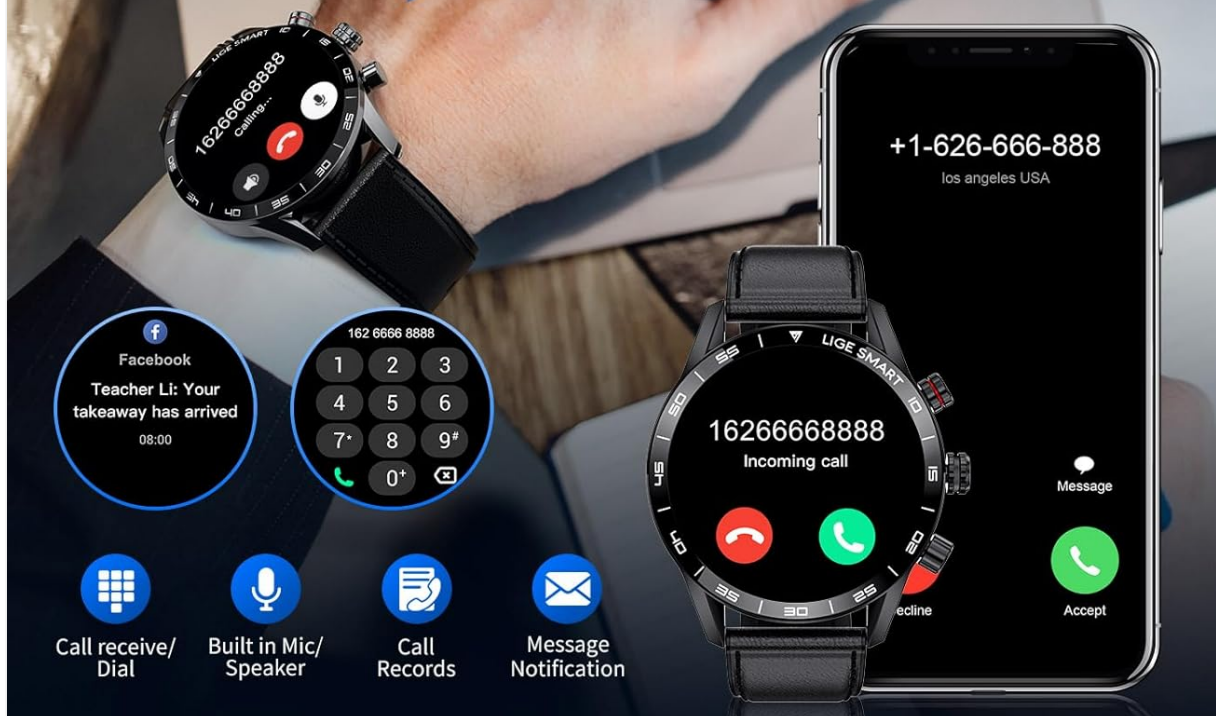
Image: A LIGE Smartwatch worn on a wrist, showing the main watch face with time and date.